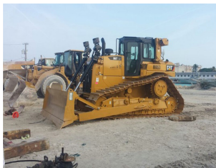
Working at reclamation