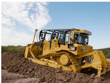
Working at: all over the world.