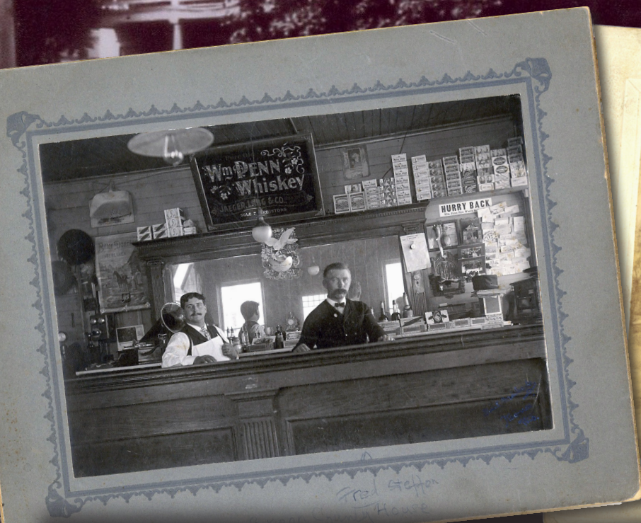
Fred Steffen House