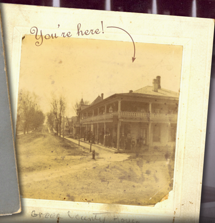
Green County House