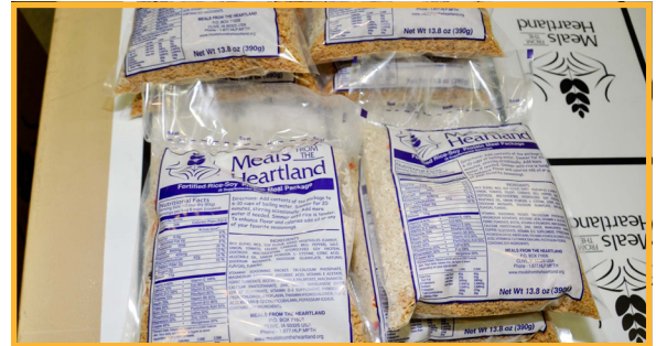
Meals from the Heartland

Each package is designed to feed a family of six. The West Campus volunteers prepared meals for more than 3,000 people. More than four million meals were prepared over four days at Hy-Vee Hall. The meals will be distributed as far away as Kenya.