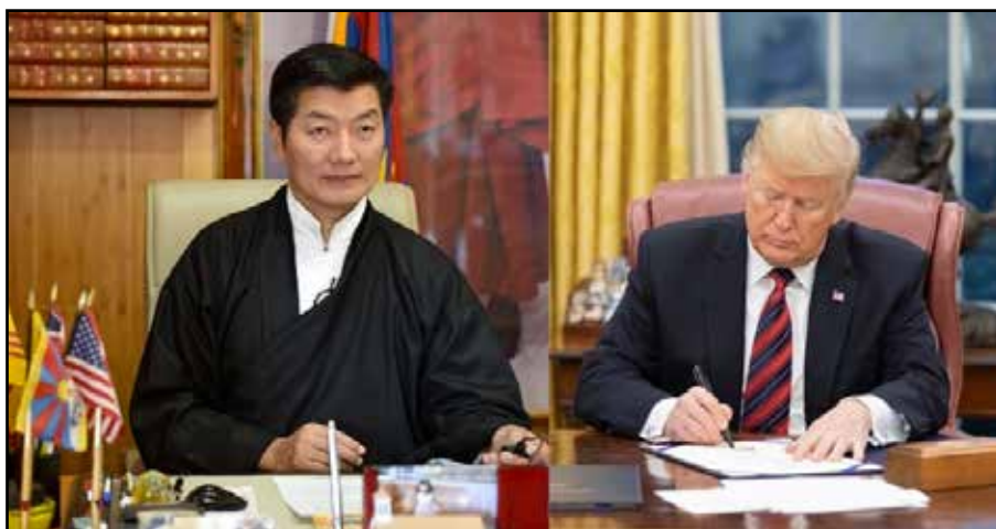
CTA President hails the Asia Reassurance Initiative Act.

President Dr Lobsang Sangay of Central Tibetan Administration hailed the enactment of the Asia Reassurance Initiative Act (ARIA) , saying that the passage is a much-welcomed move. US President Donald Trump signed the ARIA Act into law on 31 December 2018, having passed the Senate and the House on 4 and 12 December respectively.