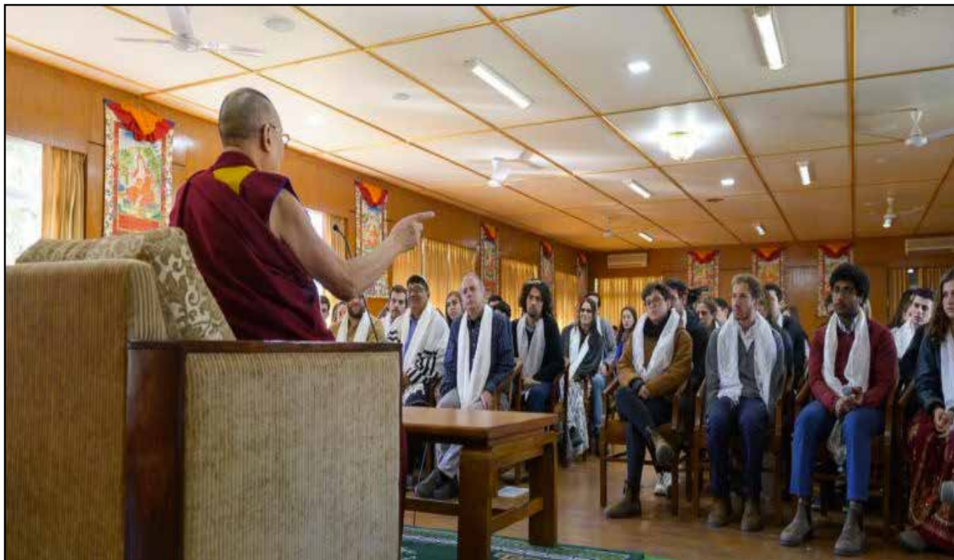
His Holiness the Dalai Lama speaking to students from the USA and Israel at his residence in Dharamshala, HP, India on January 28, 2019.

Tibetan spiritual leader His Holiness the Dalai Lama met with a group of students from the US and Israel at his residence in Dharamshala where he gave a 40-minute audience.