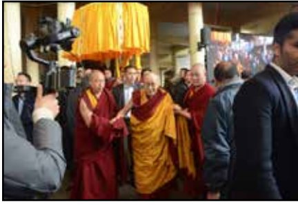
His Holiness the Dalai Lama after concluding his teachings on Jataka Tales and other texts on the festival of Chotrul Duchen, 19 February 2019.

“The tradition of rigorous study, practice using logic has enabled Tibetan scholars to successfully engage in two-way dialogue with modern scientists. If we wish these traditions to survive now we have to engage them with our intellect.”