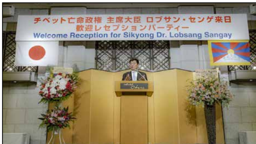
CTA President Dr. Lobsang Sangay speaking at the welcome reception in honour of his visit to Japan organized by the Liaison Office of His Holiness the Dalai Lama in Tokyo, Japan, on 26 January 2019.

criticism of the Chinese government. Though the Czech Republic is a small country and faces very strong pressure from China's influence in its business, politics and universities, it has decided