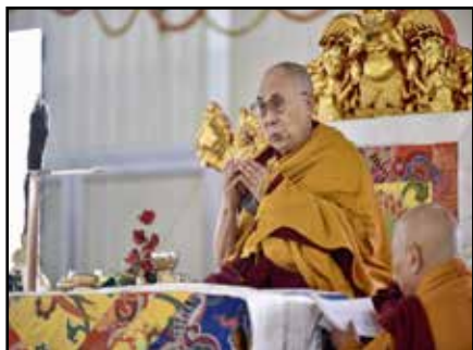
His Holiness the Dalai Lama conferring long-life empowerment based on White Heruka at Kalachakra ground in Bodh Gaya, Bihar on 30 December 2018.

His Holiness the 14th Dalai Lama concluded teachings at Bodh Gaya, Bihar, the place where Gautama Buddha attained enlightenment. Attending the annual teachings and prayers conferred by His Holiness has almost become an intrinsic part of an individual Tibetan's annual religious sojourn. Tibetans all over the world try to attend the same.