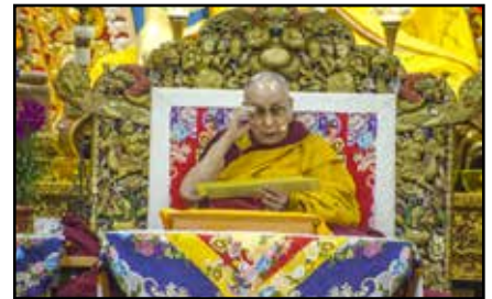
His Holiness the Dalai Lama reads from Bhavaviveka’s “Essence of the Middle Way” at the Main Tibetan Temple in Dharamsala, HP, India on February 20, 2019.

“Climate change is not the concern of just one or two nations. It is an issue that affects all humanity, and every living being on this earth. This beautiful planet is our only home. If, due to global warming or other environmental problems, the earth cannot sustain itself, there is no other planet to wish we can