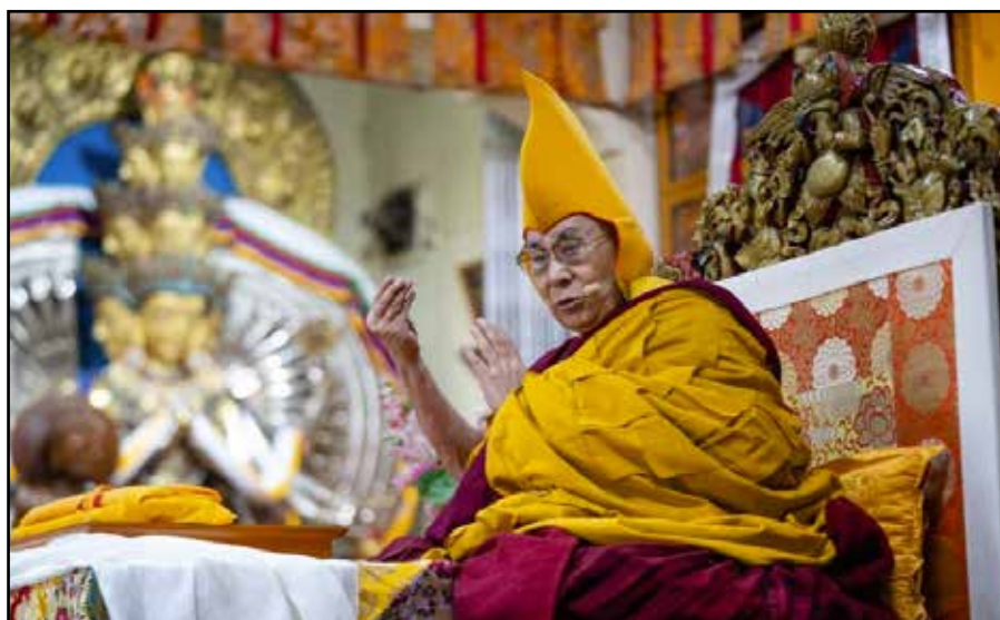
His Holiness the Dalai Lama giving teachings on the final day of the Great Prayer Festival at Tsuglagkhang, Dharamshala on 19 February 2019.

“The undaunted and unwavering spirit of Tibetans in Tibet and the committed efforts of those in exile have ensured that the Tibet issue is not forgotten,” His Holiness said.