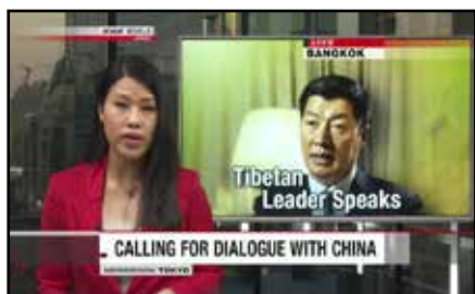
Video grab of the NHK interview broadcast on NHK World News in Tokyo, Japan, 25 Jan 2019.

Dr. Sangay said the Chinese government should listen to the voices and cries of the Tibetan people. "153 Tibetans have self-immolated calling for the return of His Holiness the Dalai Lama to Tibet and basic freedom for Tibetan people. If the Chinese government listen to their voices, it will be good for the Chinese government and harmony in Tibet and China, which is a win-win proposition," he said.