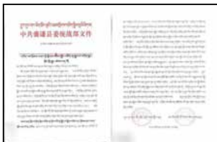
The Communist Party of China’s United Front Work Department (UFWD) issued an order dated December 25, 2018, banning Tibetan monasteries from teaching informal language classes during the school break.

Tibetan students in Kham Nangchen, Yushu (Chinese: Yushu) prefecture, incorporated into China’s Qinghai province, are barred from joining the voluntary informal Tibetan classes conducted by monasteries this winter break for schools. Chinese authorities, mainly the Communist Party of China’s United Front Work Department (UFWD), issued an order dated December 25,