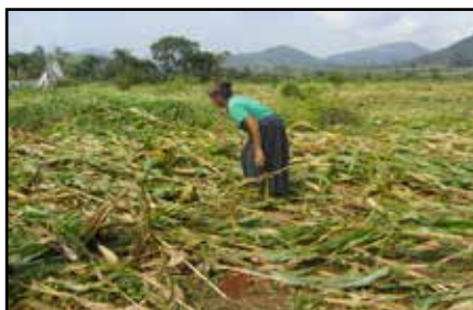
Several hundreds of acres of crop destroyed as Cyclone Titli made landfall in Odisha.

“Similarly, I would like to extend my sincere gratitude to the state government for compensating our people to the