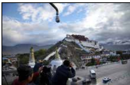
A security camera monitored visitors to the Potala Palace in Lhasa, the capital of the Tibet Autonomous Region in China.

The Central Tibetan Administration's spokesperson and Department of Information & International Relations Secretary Dagpo Sonam Norbu remarked, "The ban shows Tibet's instability under the Chinese rule and the Tibetan people's constant defiance of Chinese occupation which it claims as 'liberation of Tibet' after the Tibetan