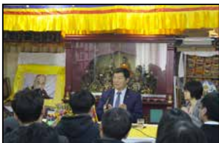
CTA President Dr. Lobsang Sangay giving a public talk to Tibetan community and Japanese public at the Liaison Office of His Holiness the Dalai Lama in Tokyo, Japan, on 26 January 2019.

"I have been saying for the last 7 years that what happened to Tibet could happen to you and will happen to you. Many leaders in Europe, Latin America, South Africa and Australia, have now realized how China threatens by spreading its tentacles in their social, culture, political affairs. So the narrative on China is changing and this is an assertion on the part of different countries to speak for Tibet, human rights and democracy and