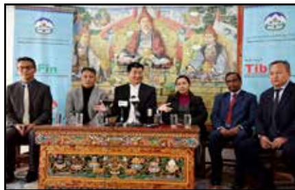
President Dr Lobsang Sangay addressing the press conference on the launch of new Summer Livelihood Support Programme for the year 2019 by SARD, Department of Finance, CTA at Kashag Secretariat hall.

The Social and Resource Development Fund (SARD), Department of Finance rolled out a new Summer Livelihood Support Programme for 2019, under which CTA will provide loans worth a total of Rs 12 Crores (120 Million) at a minimal 3% interest rate to support Tibetan Summer businesses across India.