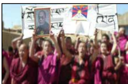
File Image

In 2018, China has sentenced 25 Tibetans in the central Tibet, the so-called Tibet Autonomous Region (TAR) under charges of “inciting separatism” and endangering “national security,” reported the state mouthpiece Global Times. The TAR high court presented the information in its work report last weekend.