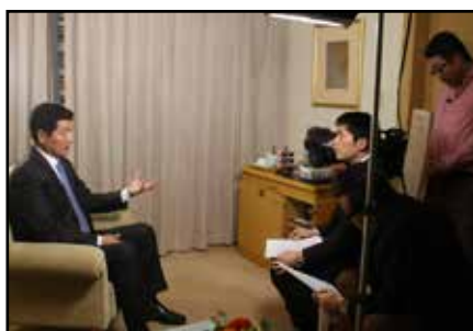
CTA President Dr. Lobsang Sangay being interviewed by NHK, Tokyo, Japan, 25 Jan 2019.

Dr. Sangay said the harsh clampdown on religious in and Tibet reflects the Chinese government's sense of insecurity due to growing number of people devotion to religion. "At present there are more religious people than communist party members. The Chinese communist party is facing an institutional threat and it feels insecurity. Hence there is clampdown on all kinds of religions and practitioners including Muslims, Uighurs, Tibetan Buddhists," he said.