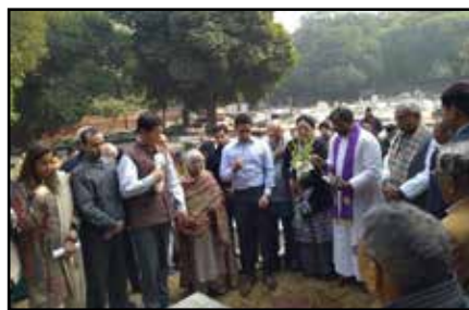
President Dr Lobsang Sangay pays his last respects to the former defence minister George Fernandes in New Delhi, 1 February 2019.