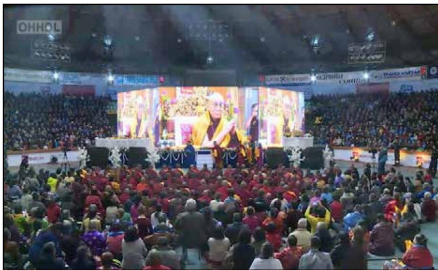
His Holiness the Dalai Lama begins teaching on Je Tsongkhapa's 'Concise Stages of the Path' and 'In Praise of Dependent of Origination' through live teleconference participated by Buddhist groups from Mongolia on Thursday, 28 February 2019.

His Holiness the Dalai Lama gave teachings on Je Tsongkhapa's 'Concise Stages of the Path' and 'In Praise of Dependent of Origination' through a live teleconference participated by Buddhist groups from Mongolia on Thursday, 28 February.