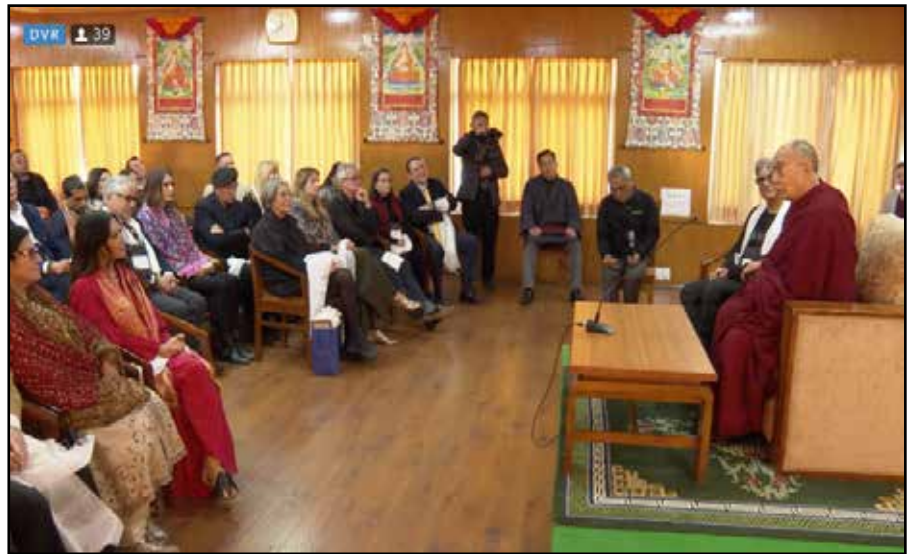
His Holiness the Dalai Lama, alongside former Indian Prime Minister Dr Manmohan Singh, addressing the audience at celebrations of Guru Nanak's 550th Birth Anniversary in New Delhi, India on November 10, 2018.

“India particularly should lead these efforts in this and also in promoting