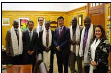
His Excellency Prince Mangosuthu Buthelezi, President of Inkatha Freedom Party hosts a felicitation ceremony for President Dr Lobsang Sangay, Central Tibetan Administration, 6 February 2019.

“The reality is that the international community supported South Africa’s struggle for freedom now it must support that struggle for Tibet.”