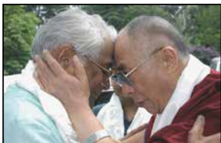
His Holiness the Dalai Lama saddened by the demise of 'heroic leader and steady friend of Tibet', George Fernandes.