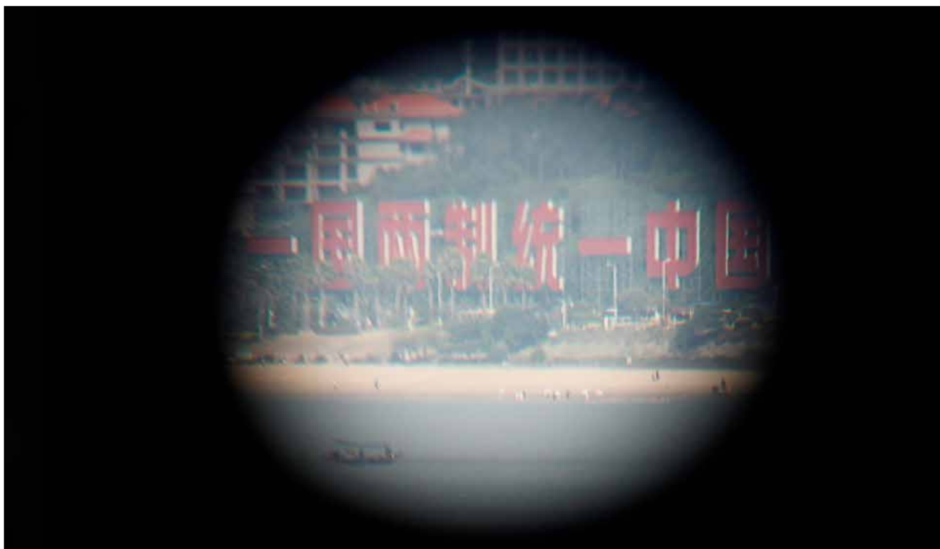
China's banner reading "One China, Two System, One Unified China is seen from a former military fort in Kinmen County, Taiwan, ahead of the 60th anniversary of the second Taiwan Strait crisis with China. August 20 2018.