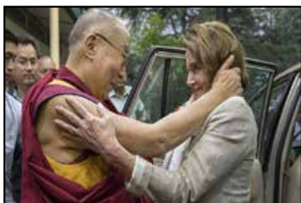
His Holiness the Dalai Lama greeting his friend then House Democratic Leader Nancy Pelosi as she arrives at his residence leading a bipartisan US Congressional Delegation on a visit to the Tibetan community in Dharamsala HP, India on May 9, 2017.

His Holiness also thanked Speaker Pelosi for her personal friendship and for her loyal and unwavering support in the past decades to the just cause of the Tibetan people.