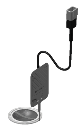
Axius SC with burst indicator

The flexible circuit is physically attached at two locations and is broken in a predetermined pattern. This eliminates the possibility of the conductive loop remaining intact after disc rupture.