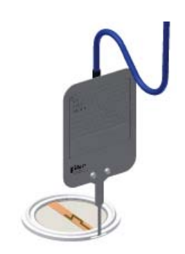
BCH burst indicator

NOTE: While similar in appearance, the BCH is not a rupture disc and cannot be used as such. There should be no pressure differential across the BCH.