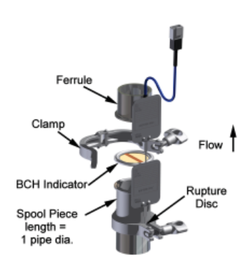
Schematic of BCH with rupture disc