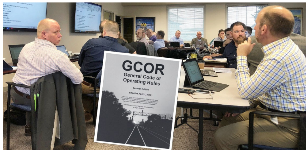
The GCOR committee held meetings in the ARRC headquarters / GOB building's third-floor Board Room.