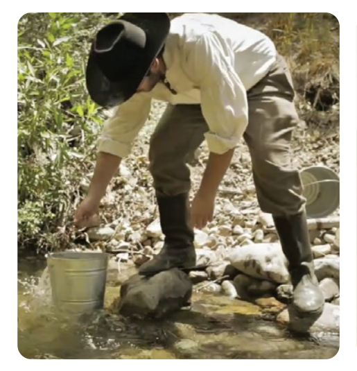
THERE WAS A MAN WHO HAULED BUCKETS OF WATER FOR A LIVING.

Every day he hauled water from the nearest source to his village miles away. If he wanted to make more money, he would simply work longer hauling buckets.