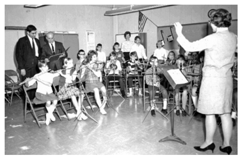
Shawnee Mission School District music classroom in the 1960s.

1975 - As the population in southern Johnson County swelled, Blue Valley School District was established. Enrollment nearly quadrupled in the district's first 10 years.