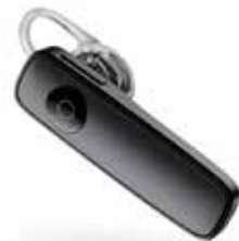
Marque 2 M165