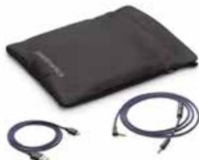
Travel Sleeve and Cables