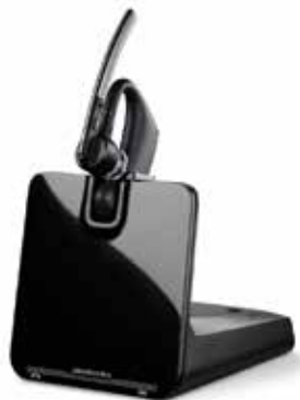
Voyager Legend CS