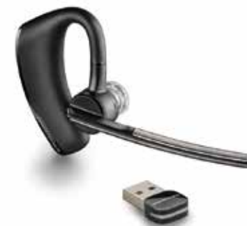
Voyager Legend UC

BackBeat FIT Wireless Headphones: powerful audio to power you through a week of workouts.