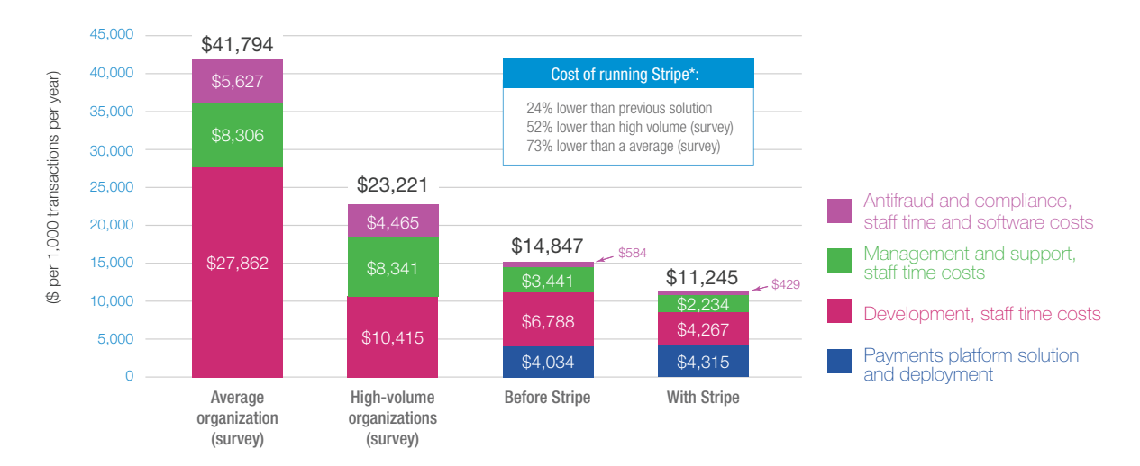
FIGURE 1 Total Cost of Running Online Payments Transactions Platform per Year

*The data is based on cost of operations categories shown in Figure 1.