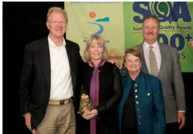
2013 Ed Begley Jr. + Sheila Kuehl