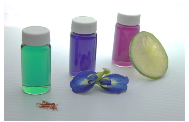
Figure 3. Butterfly pea ( Clitoria ternatea ) flower extract at normal pH (blue), lowered pH (purple/pink) and raised pH (green).