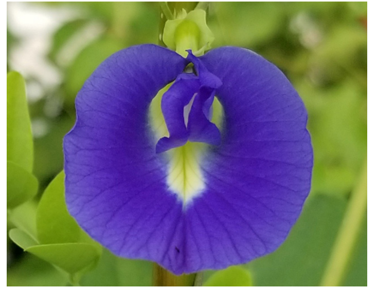
Figure 1. Butterfly pea ( Clitoria ternatea ) flower.

young shoots and tender pods are all edible and commonly consumed, and the leaves can also be used as a green colorant (Mukherjee et al., 2008).