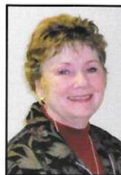
The Real Estate Nurse