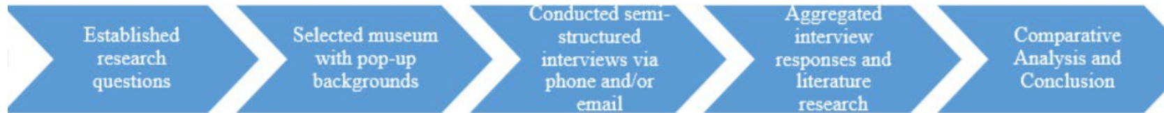
Figure 3-1. Flowchart of research timeline.