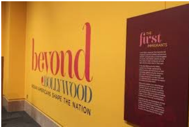
Figure 2-5. Photo of Smithsonian APA’s “Beyond Bollywood” exhibition (2014-2015) from the February 2014 Smithsonian Folklife Festival Blog.