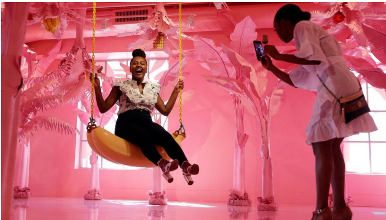
Figure 2-3. Museum of Ice in Miami, FL (now permanently closed).