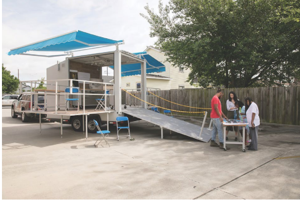
Figure 2-4. Photo of NOMA+ mobile pop unfolded from its truck from the New Orleans Museum of Art 2018 article titled ‘Noma+ Brings a “Pop-Up Museum” to the Community’.