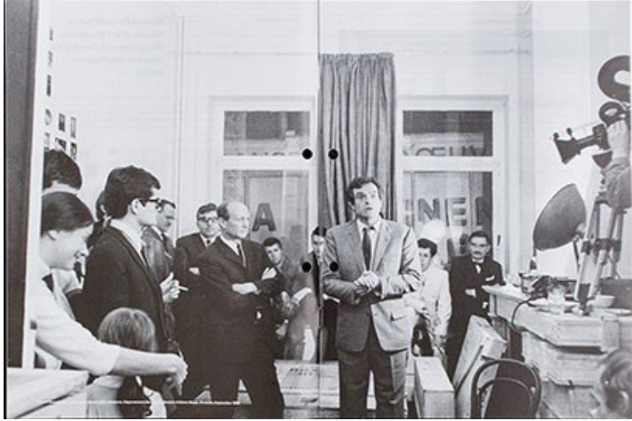
Figure 2-1. Marcel Broodthaers at the opening of Musee d'Art Moderne in Brussel, Belgium (1968).