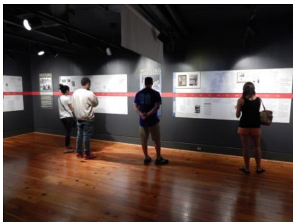
Figure 2-6. Photo of The Levine Museum’s “K(NO)W Justice K(NO)W Peace” exhibition (2016) from the International Colation Sites of Conscience’s article titled “K(NO)W Justice K(NO)W Peace – The People, The Process, The Project’.