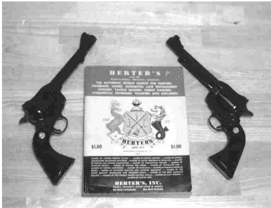
Powermags with the 1969 Herter catalogue