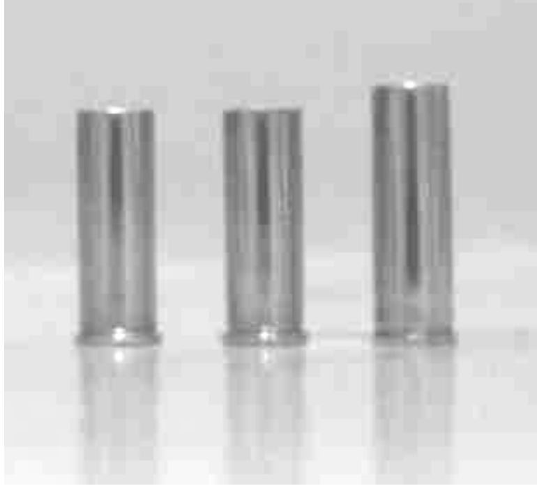
L to Right: .401 Powermag, .41 Rem Mag, .401 Bobcat