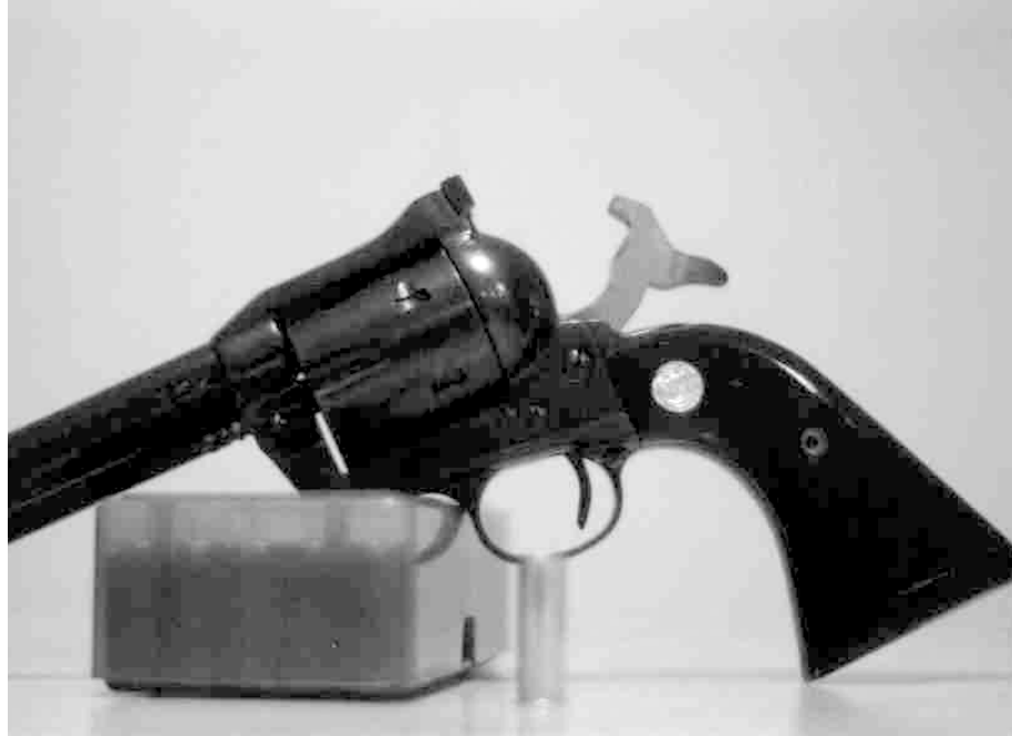
.401 Powermag: View of the hammer.