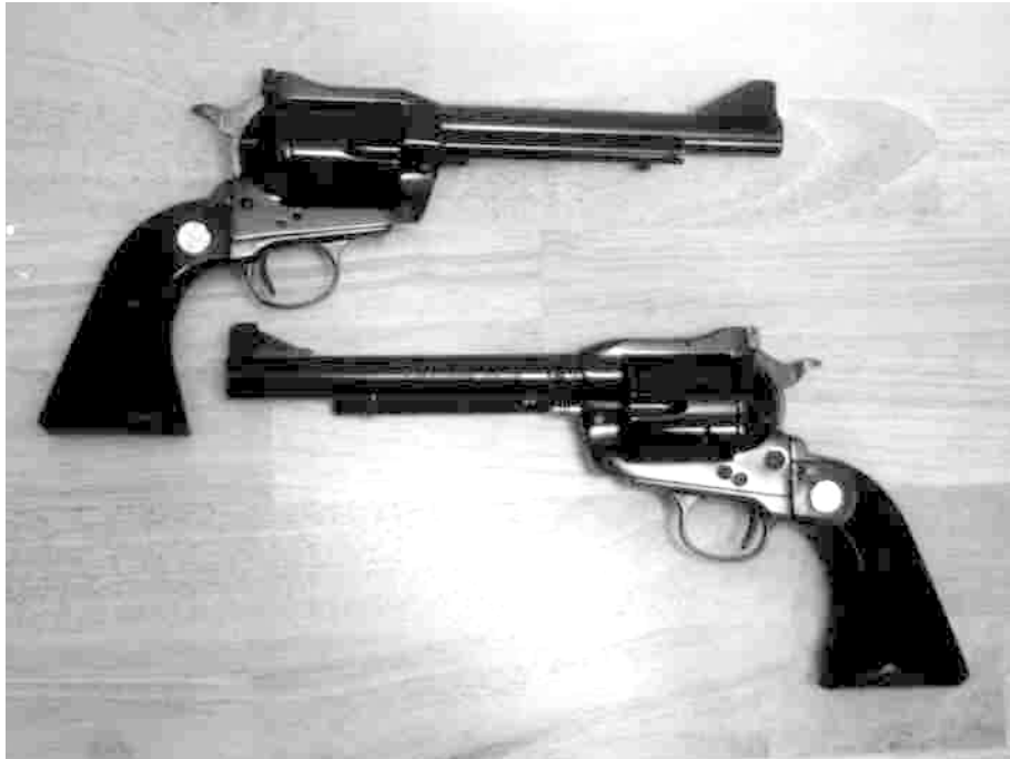
Top: .401 Herter Powermag, Bottom: .357 Magnum