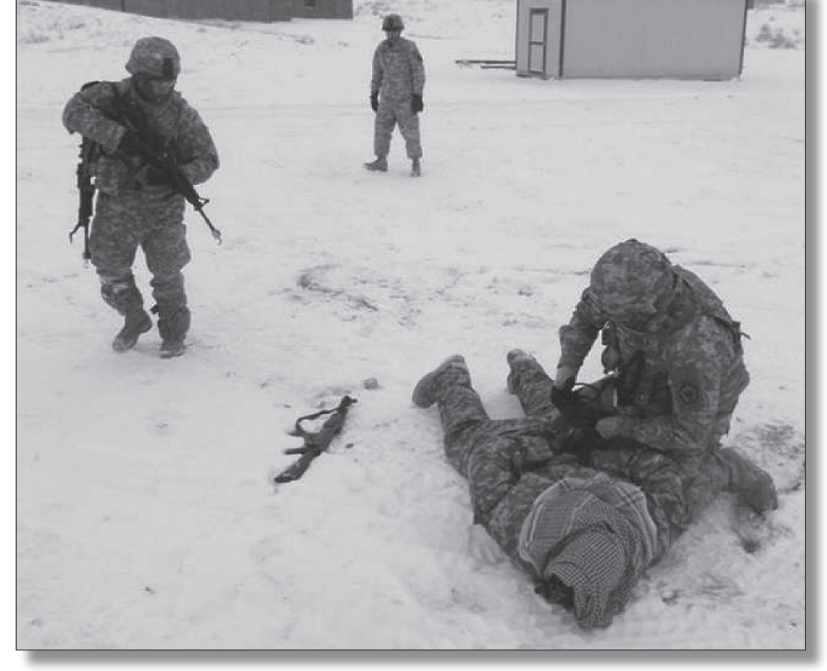
During a 48-hour squad stakes exercise, Soldiers detain a suspect while an evaluator looks on.

Leaders select the type and technique of rehearsals and are most effective when they combine and integrate them into their timeline.