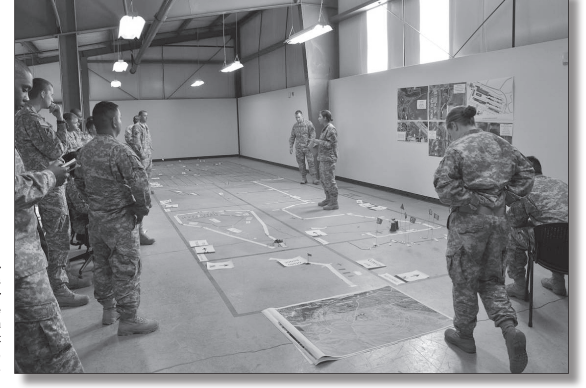
A large-scale terrain model helps the 52d Engineer Battalion prepare to construct a C-130 airfield at Camp Guernsey, Wyoming.

The eight-step training model has significant overlap with TLPs, making it especially effective for leaders at the company level and below. Leaders can implement the eight-step training model to develop effective training and simultaneously implement TLPs.