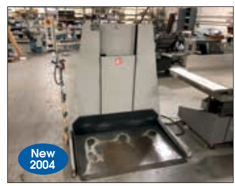
POLAR MOHR LIFT LW-1000-4