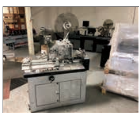
KIRK RUDY TABBER MODEL 535