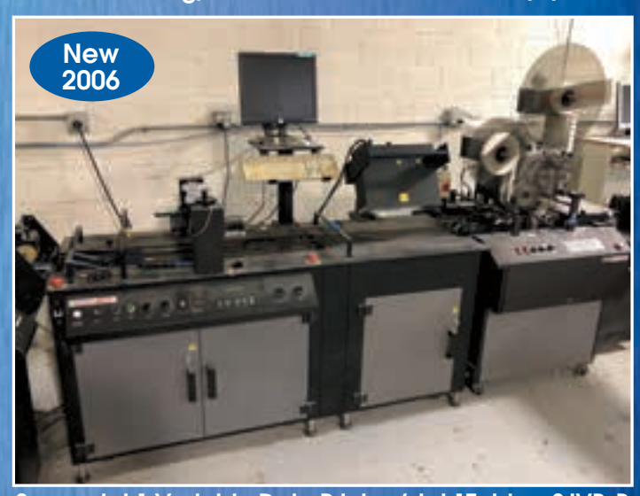
Horizon Model SPF-30 Stichliner Saddle Booklet Maker Secap Jet 1 Variable Data Printer / Jet 1Tabber SJVB-B