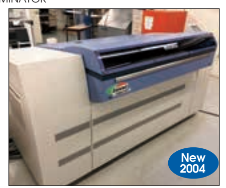
FUJI FILM CTP MODEL T9000 CTP II SCREEN/JAVELIN LUXEL