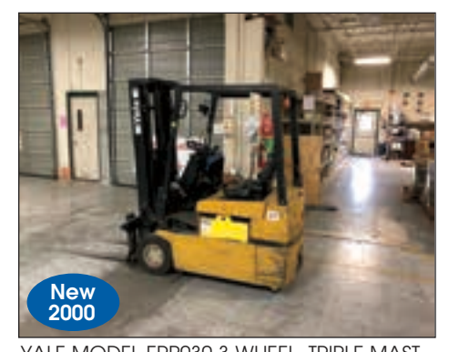
YALE MODEL ERP030 3-WHEEL, TRIPLE MAST-3000LB