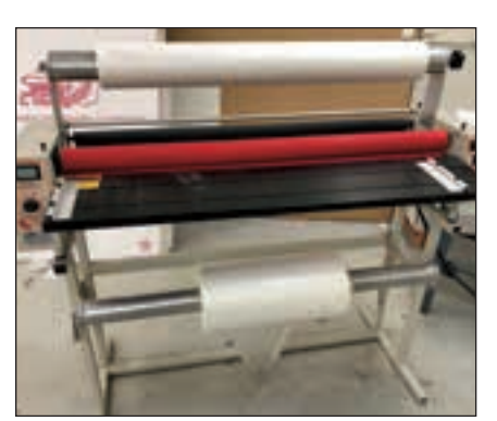
PLS MODEL PL-244 WF HOT ROLL LAMINATOR