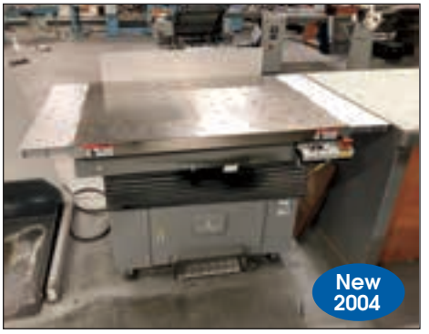
POLAR MOHR JOGGER R4