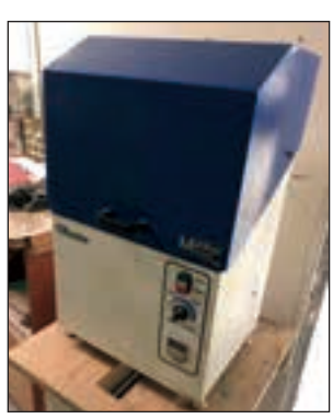
GF INNOVATIONS VORTEX MIXER MODEL MXR10I