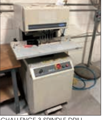
CHALLENGE 3-SPINDLE DRILL MODEL MS-S