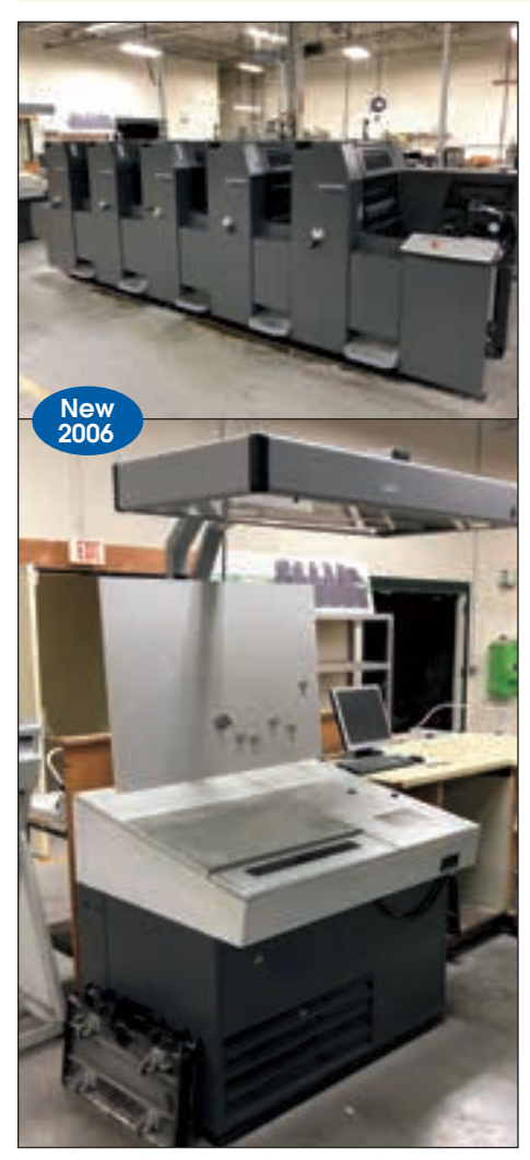
HEIDELBERG PRINTMASTER PM-52-5, CONTROL CONSOLE