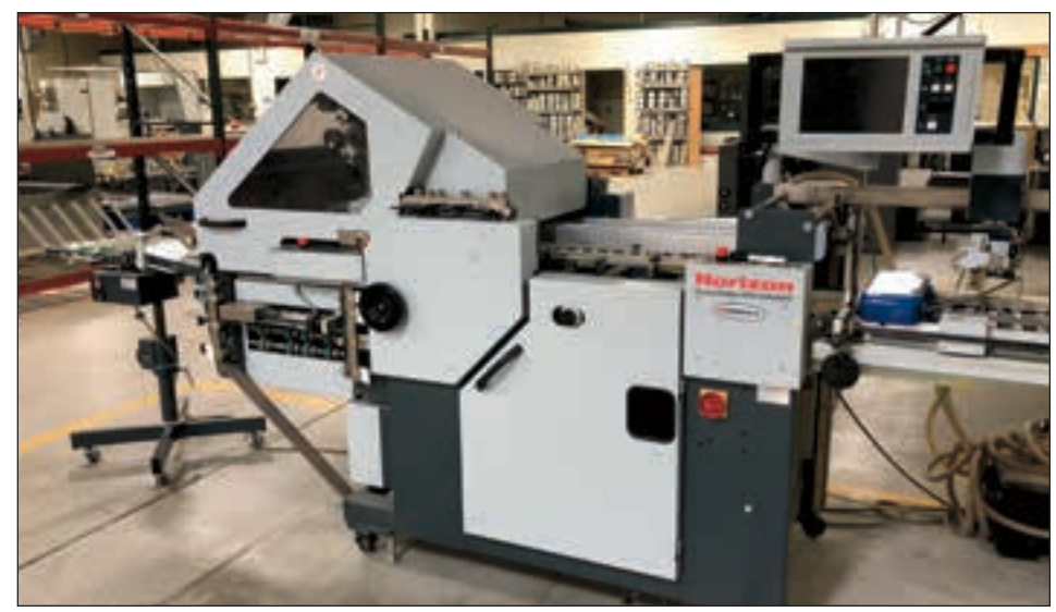
STANDARD HORIZON CROSS & AUTO FOLDING MACHINE MODEL AFC544AKT