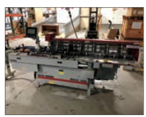
MAILCRAFTERS INSERTER MODEL EDGE SERIES 9800, 5-POCKET