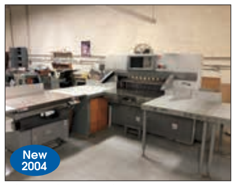
POLAR MOHR 45" MODEL 115X