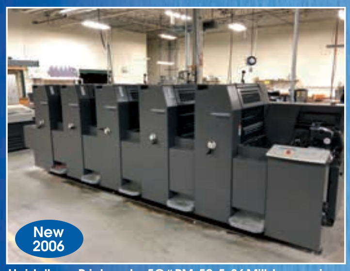
Heidelberg Printmaster 5C # PM-52-5, 36 Mill. Impressions

SALE DATE: THURSDAY, FEBRUARY 7, 1:00 PM (ET) INSPECTION: WEDNESDAY, FEBRUARY 6, 9 AM TO 4:30 PM (ET)