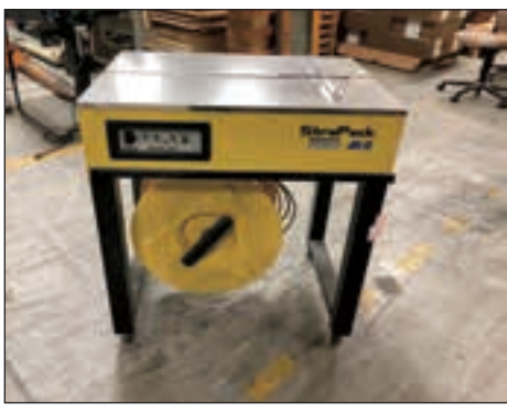
STRAPACK JK-2 SEMI AUTOMATIC STRAPPING MACHINE