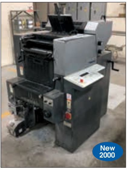
HEIDELBERG PRINTMASTER 2C MODEL QM46-2, 11.5" X 17"