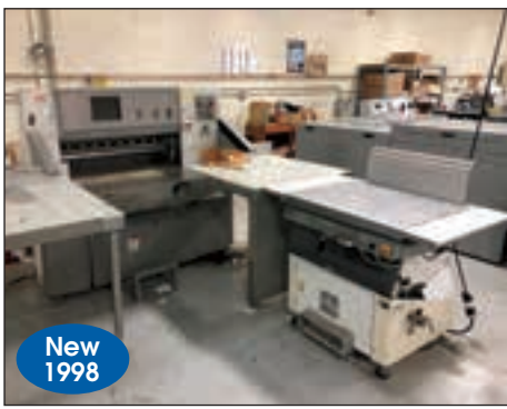
POLAR MODEL 36" MODEL 92E