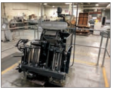
HEIDELBERG ORIGINAL PLATEN PRESS