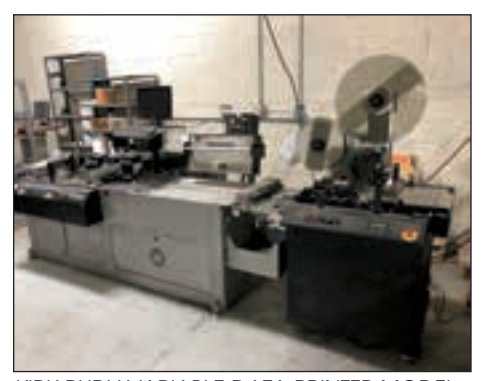
KIRK RUDY VARIABLE DATA PRINTER MODEL 215/KIRK RUDY TABBER