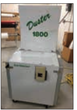
VARISPEED 1800 DUSTER