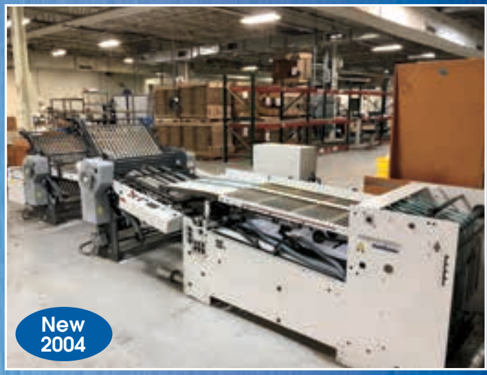
Heidelberg/Stahl Folder Model RD2-78 4/4/4