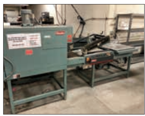
SHANKLIN SHRINK TUNNEL /WRAPPER