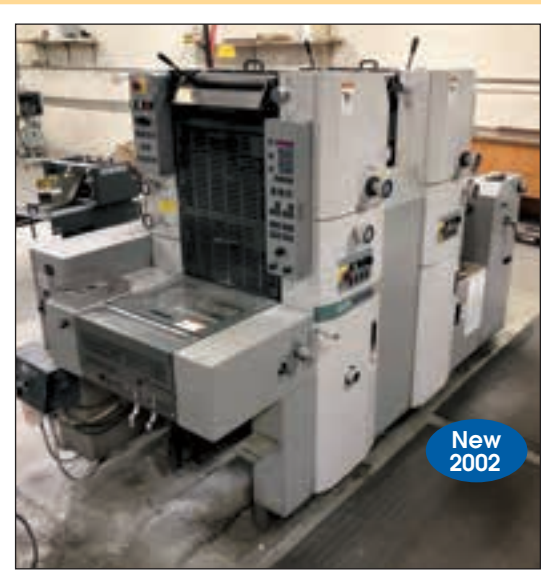
HAMADA 2C MODEL H234A, 11 1/2" X 17"