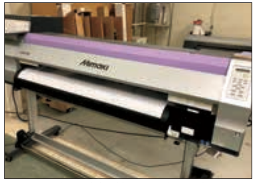
MIMAKI MODEL CG-130FX, 66" CUTTING PLOTTER