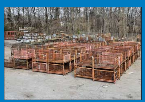
Large Quantity of Wire Baskets