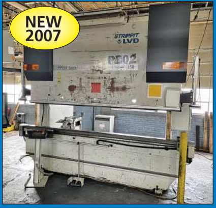
165 Ton x 10' LVD PPEB 150/10 Turbo 8-Axis CNC Press Brake