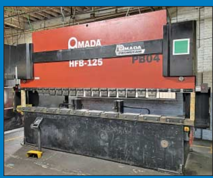
137 Ton x 157" Amada HFB-125 5-Axis CNC Press Brake