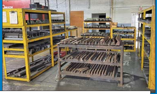
Large Quantity of Spare Press Brake Dies by Wilson and Others