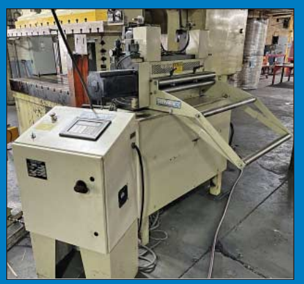
24" CWP SMXSE24H ServoMax SE Feeder