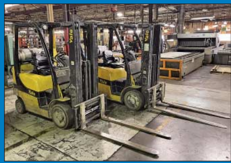
(4) LP Gas Lift Trucks

58" Wulftec Model WLP 200 Rotary Stretch Wrapper