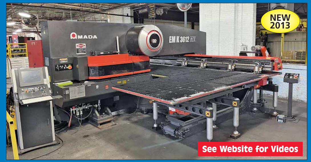
33 Ton Amada EMK 3612 M2 CNC Servo Driven Turret Punch with (4) Auto Index Heads