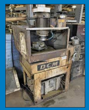
DCM Model PDG 5-3AF Punch Grinder