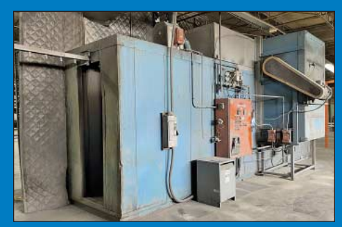
Industrial Heat Ent. Intl. Adhesive Cure Oven