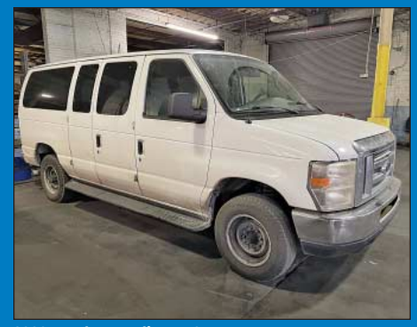
2008 Ford Econoline 350 Van