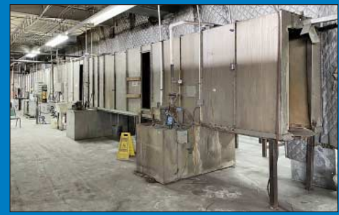
80' 5-Stage Stainless Steel Parts Washer