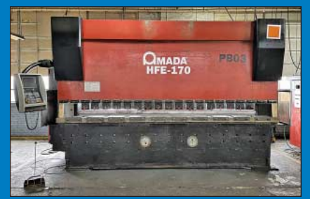
187 Ton x 167" Amada HFE-170-4S 6-Axis CNC Press Brake