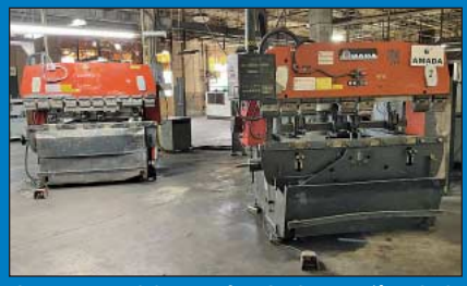
(2) 55 Ton x 78.8" Amada RG-50 Up-Acting CNC Press Brakes