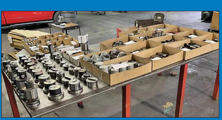
Large Quantity of Spare Punch Tooling

Large Quantity of Spare Press Brake Dies; including Standard Dies, Wilson European Dies, Punches, Etc.