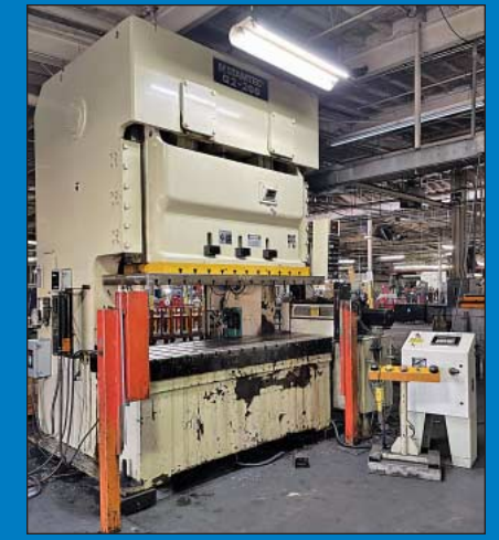
200 Ton Stamtec G2-200 Double Crank Gap Frame Press

Fanuc ARC Mate 120i 6-Axis Robotic Welding System; Type A05B-1212-B201, No. R99476385, F-43903 with Fanuc R-J3 Controller and 225 AMP Lincoln Invertec STT II Surface Tension Transfer Process Power Supply; S/N E99X03881, Pendant Control