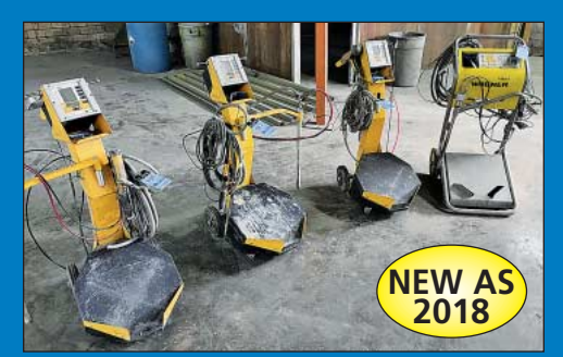
(3) Gema OptiFlex 2 B Manual Powder Gun