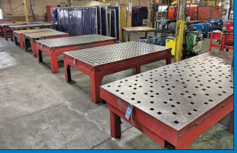
(10+) Various Acorn Tables by Acorn Iron, Weldsale & Others up to 5' x 8'

BTU, 60" Wide x 60" Deep x 72" High Inside Dimensions