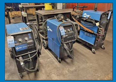
(8) Miller Tig and Mig Welders

36" Timesaver Model 237-1M Speedbelt Sander; S/N 10229 36" Timesaver Model 337-M33 Speedbelt 3-Head Sander; S/N 6829 with Dustkop Dust Collector 90" G&P Machinery Stroke Sander