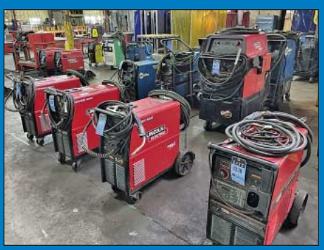
(12) Lincoln Tig and Mig Welders