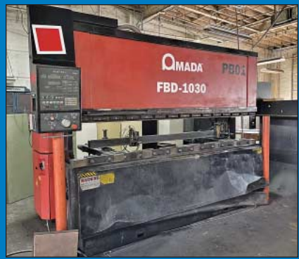
110 Ton x 118" Amada Model FBD-1030E 3-Axis CNC Press Brake