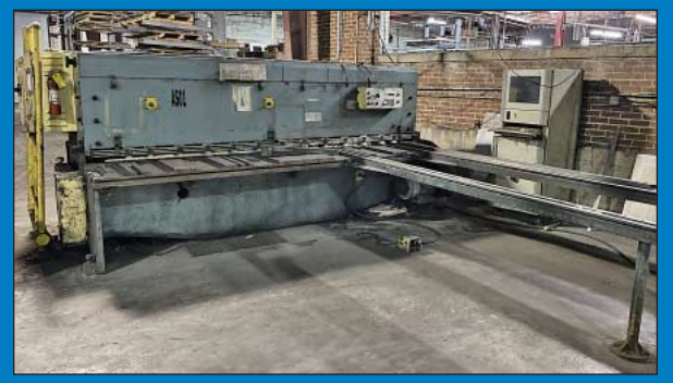
1/4" x 10' Amada M-3060 Mechanical Shear

PTR150-4488 Natural Gas Cleaning Furnace; S/N N/A, 398,000