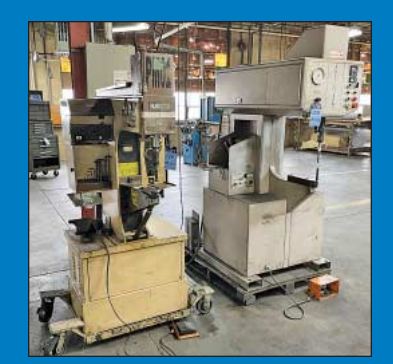
10 Ton Auto-Sert and 6 Ton Haeger Insertion Presses