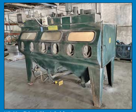
HD Maxiblast Blast Cabinet