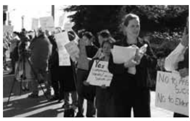
"True Compassion Advocates" protest your right to Death With Dignity.