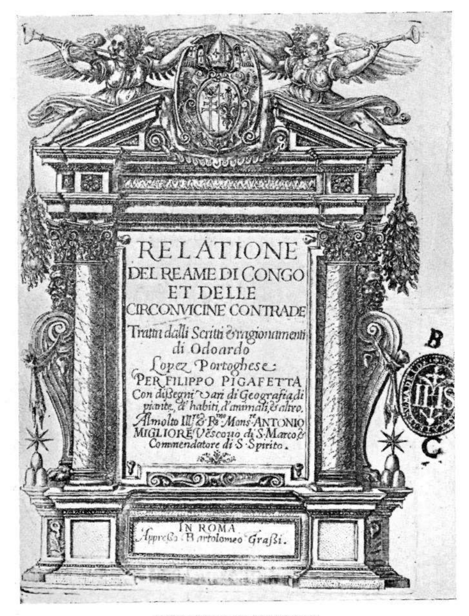
TITLE PAGE OF PIGAFETTA In possession of Rhodes-Livingstone Museum, Livingstone, N.R.