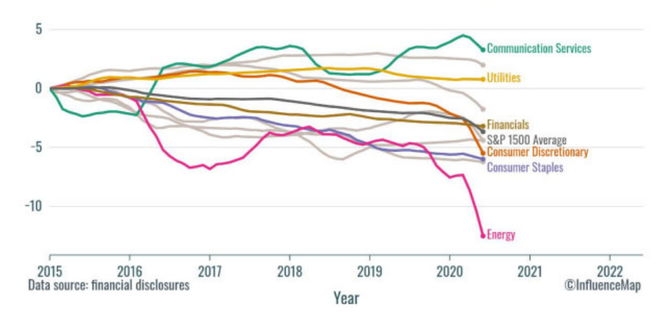
Change in Bond Ratings of Sectors in the S&P 1500 Change in the 3-month running average of issuer ratings since 2015 (%)

BlackRock—which executes the bond purchases on behalf of the Fed—has recognized that "climate risk is investment risk." Yet the Fed, acting on behalf of U.S. taxpayers, has purchased a disproportionate amount of fossil fuel bonds.