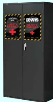
Standard option 72" x 36" x 18"