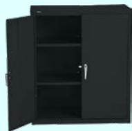
Compact option 42" x 36" x 18"