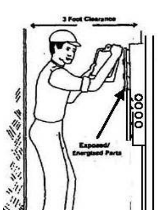
Wall not grounded. e.g. Plasterboard on Wood Studs

In this illustration, the worker is working on a switchboard, parts of which are exposed and energized. The minimum clearance under these conditions is 3 feet from the face of the switchboard to the opposing wall.