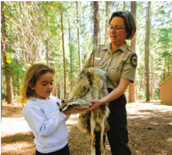
A park Junior Ranger learns about wildlife by handling a coyote skin.

two largest trees—the Agassiz Tree and the Palace Hotel Tree. The fairly strenuous four-mile River Canyon Trail runs between the North Grove and the Stanislaus River. Along the Lava Bluffs Trail, hikers can view the scenic North Fork of the river.