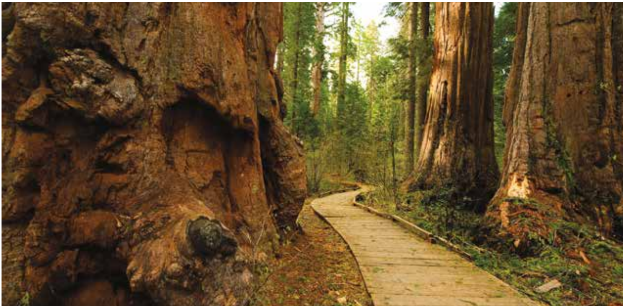
Giant sequoia trees on the North Grove Trail

Trails —The North Grove has a level, 1.5-mile self-guided trail. The .13-mile Three Senses Trail allows visitors to experience the feel, smell, and sounds of this magnificent forest. The five-mile South Grove Trail travels along Big Trees Creek and passes the park’s