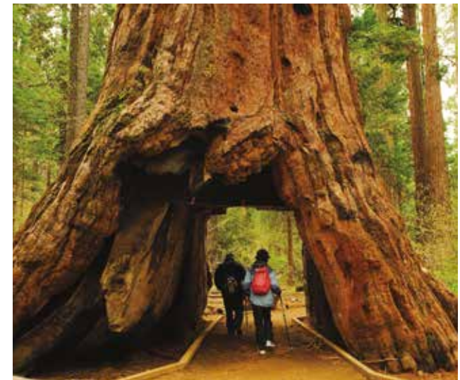
Pioneer Cabin Tree