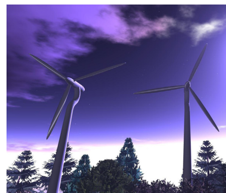
Figure 5: Wind Power

ESL's quantification methodologies provide multiple benefits. First, the simulation models provide concrete data on the unit energy and NO x emissions savings from which business can obtain SIP credits. Rewarding businesses financially for conserving energy will provide the necessary incentives for them to increase efforts to save energy. Second, designers