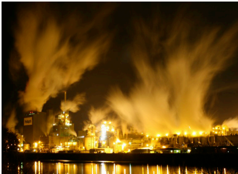
Figure 1: This nighttime picture of an industrial park provides a visual indication of its emissions.