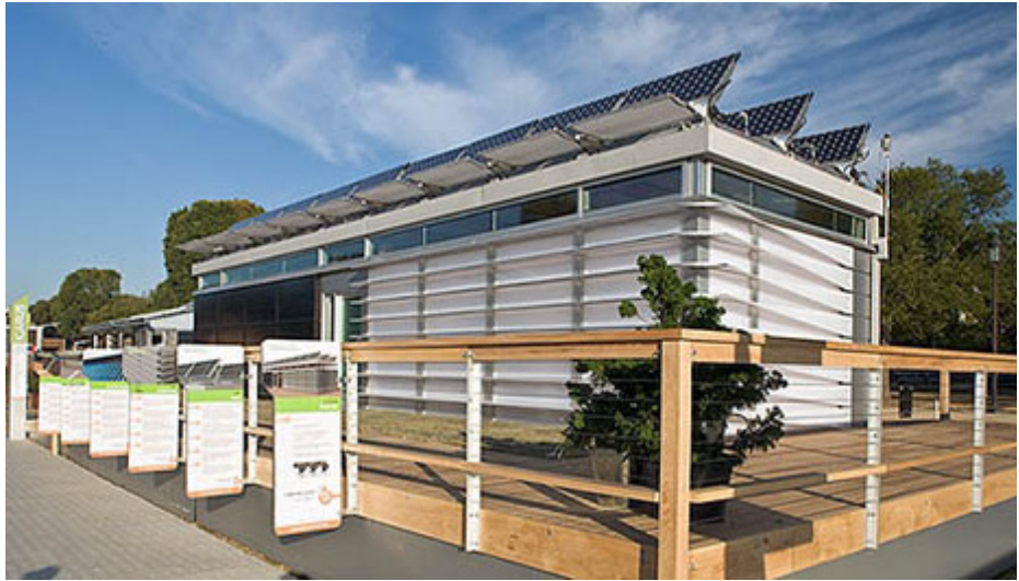
Figure 4: Solar Decathlon House; Georgia Institute of Technology

ESL has interfaced their models with a web-based design that allows open access to the system. Additionally, ESL has created an "Express Calc" simulation that allows users to compare energy outputs from pre- and code-compliant simulations with the input of only 12 parameters. Users have the option of running more detailed simulations if they choose.