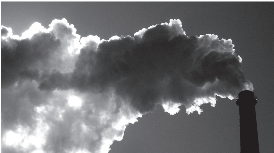
Figure 2: Smoke stack pollution

Texas is notorious for its poor air quality. Of the 254 counties in Texas, 41 have been designated as non-attainment or affected areas under National Ambient Air Quality Standards guidelines. Dallas, Harris, Tarrant, and Bexar are four of the biggest counties classified as non-attainment areas, and these counties account for approximately 40 percent of the state's population. Not surprisingly, motor vehicle use, industries, and housing starts are all concentrated in the counties with the highest populations, thus exacerbating their poor air quality.