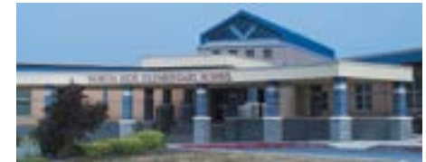
North Side Elementary

WEST HANOVER ELEMENTARY (3): 7740 Manor Dr. – seven miles east of Harrisburg on Rte. 22. From I-81 north – use Paxtonia exit, turn left at traffic signal (Rte. 22), follow three miles east to Manor Drive and turn left. School on right. From I-81 south – use Hershey (Rte. 39 south) exit, follow one mile. Turn right on Rte. 22, and follow one mile to Manor Drive and turn right. School on right.