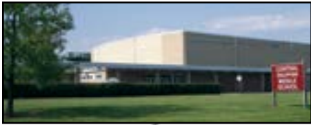
Central Dauphin Middle