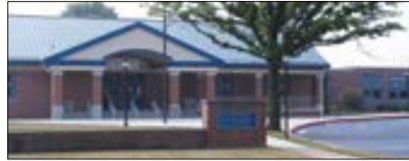
E.H. Phillips Elementary