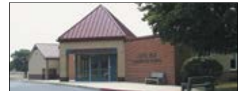
South Side Elementary