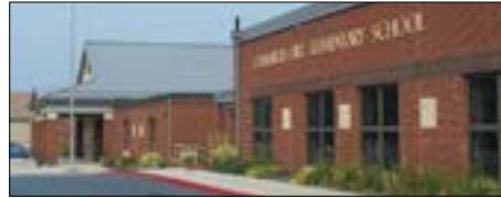
Chambers Hill Elementary