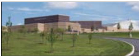
Central Dauphin High