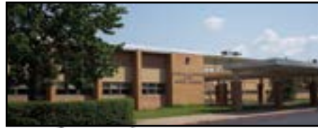
Central Dauphin East Middle