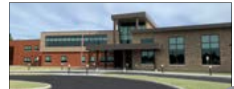
West Hanover Elementary