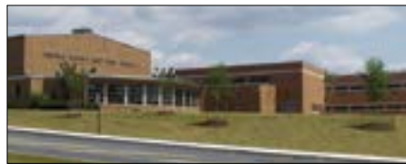
Central Dauphin East High