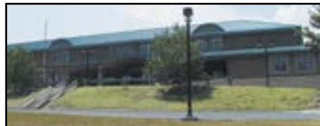
Mountain View Elementary