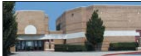
Middle Paxton Elementary