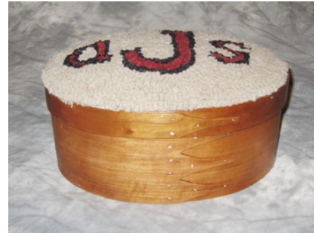
Dic Drees, Shaker Box with Hooked Monogram