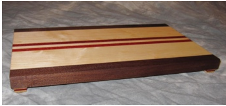
Sheldon Abrams, Cutting/Bread Board