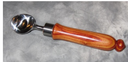
Len Swanson, Ice Cream Scoop