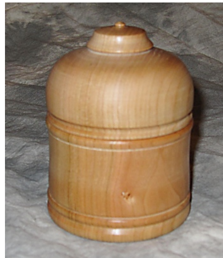
Jack Pine, Cherry Box