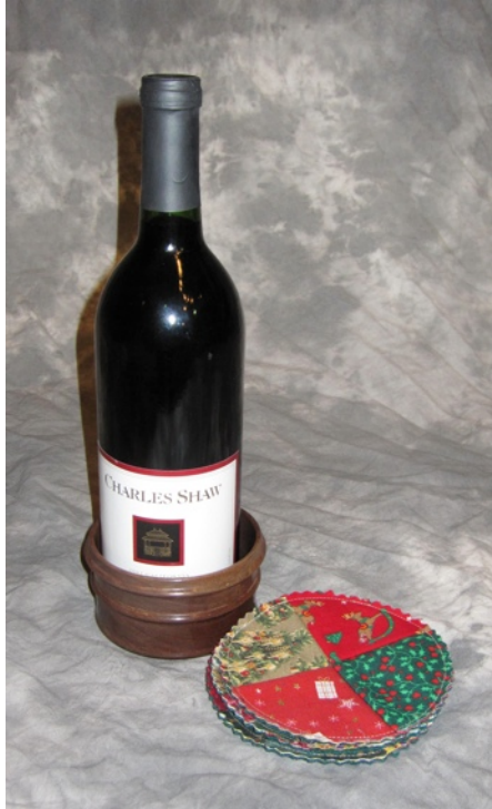
Jack Harkins, Quilted Fabric Coasters, Wine Coaster, Wine