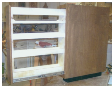
Fred Rizza, Under Counter Spice Rack