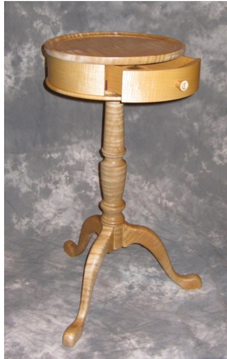
Don Carkhuff, Round Table with 3" Drawer