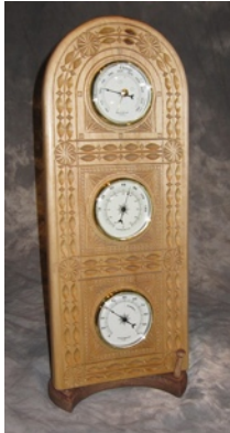
Milford Lau, Chip Carved Weather Station