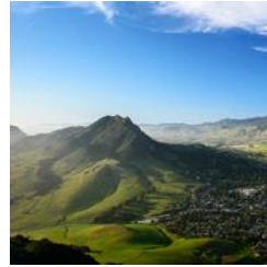
San Luis Obispo