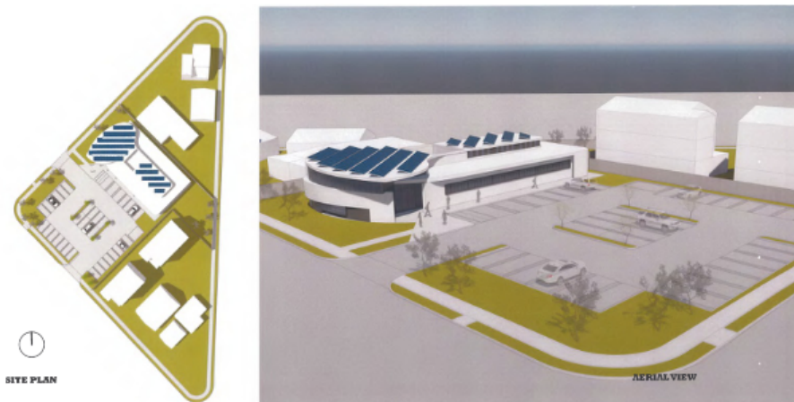
Fig 2, Aerial view and site plan of the La Puente One Stop Development Center.

2.2. Artists will not be eligible to apply if they have completed a civic art project with the Department of Arts and Culture in the last five years, whose budget was higher than $150,000.