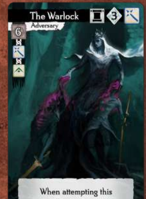
challenge, you may discard v to gain +1.