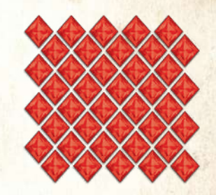
40 Experience Tokens