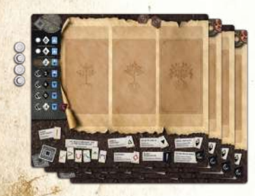
4 Player Boards with 4 Hero Markers