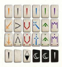
24 Runes 3 Strength • 3 Dexterity • 3 Constitution 3 Intelligence • 3 Wisdom • 3 Charisma 3 Core Runes • 3 Dark Runes