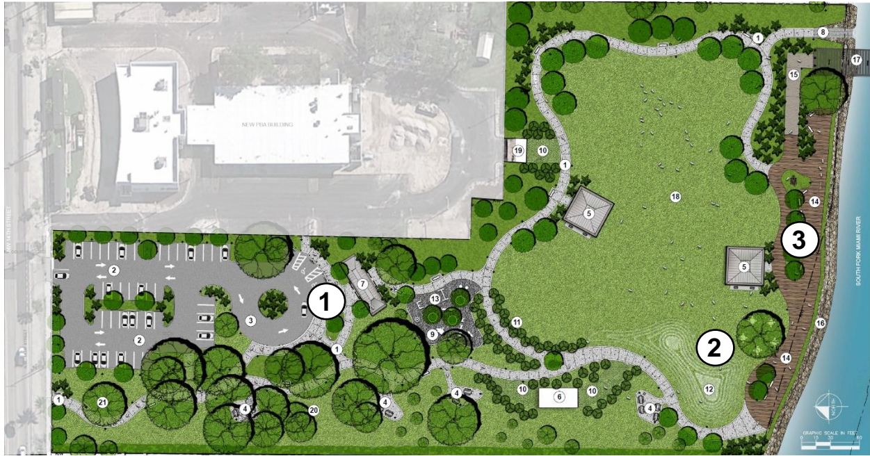
1. Entry Pavilion Breezeway 2. Play Landform 3. Riverwalk Promenade