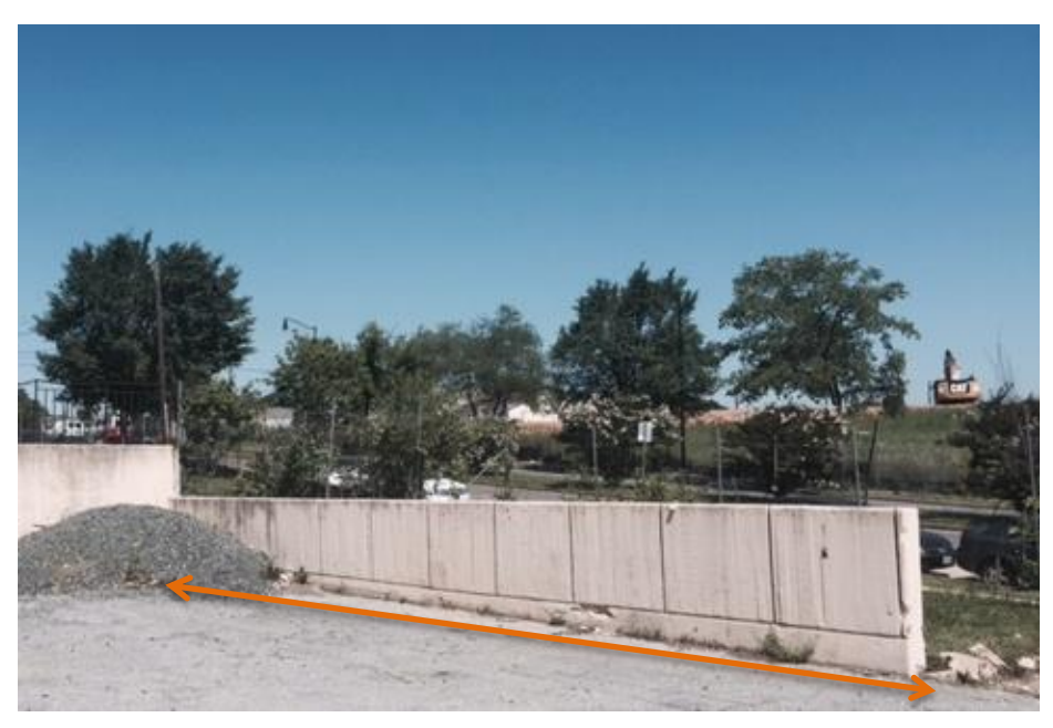
Wall 3 – dimensions: 44' long x 4' 4" tall