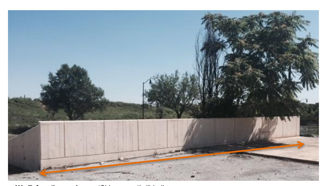
Wall 4 – dimensions: 42' long x 4' 4" tall