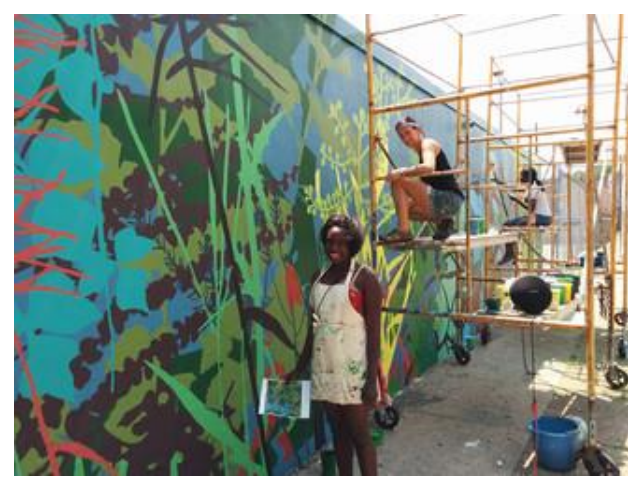
Murals Philadelphia, PA