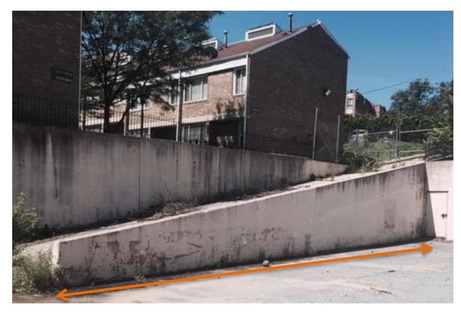
Wall 1 (lower wall) – dimensions: 57' long x 12' tall at highest point