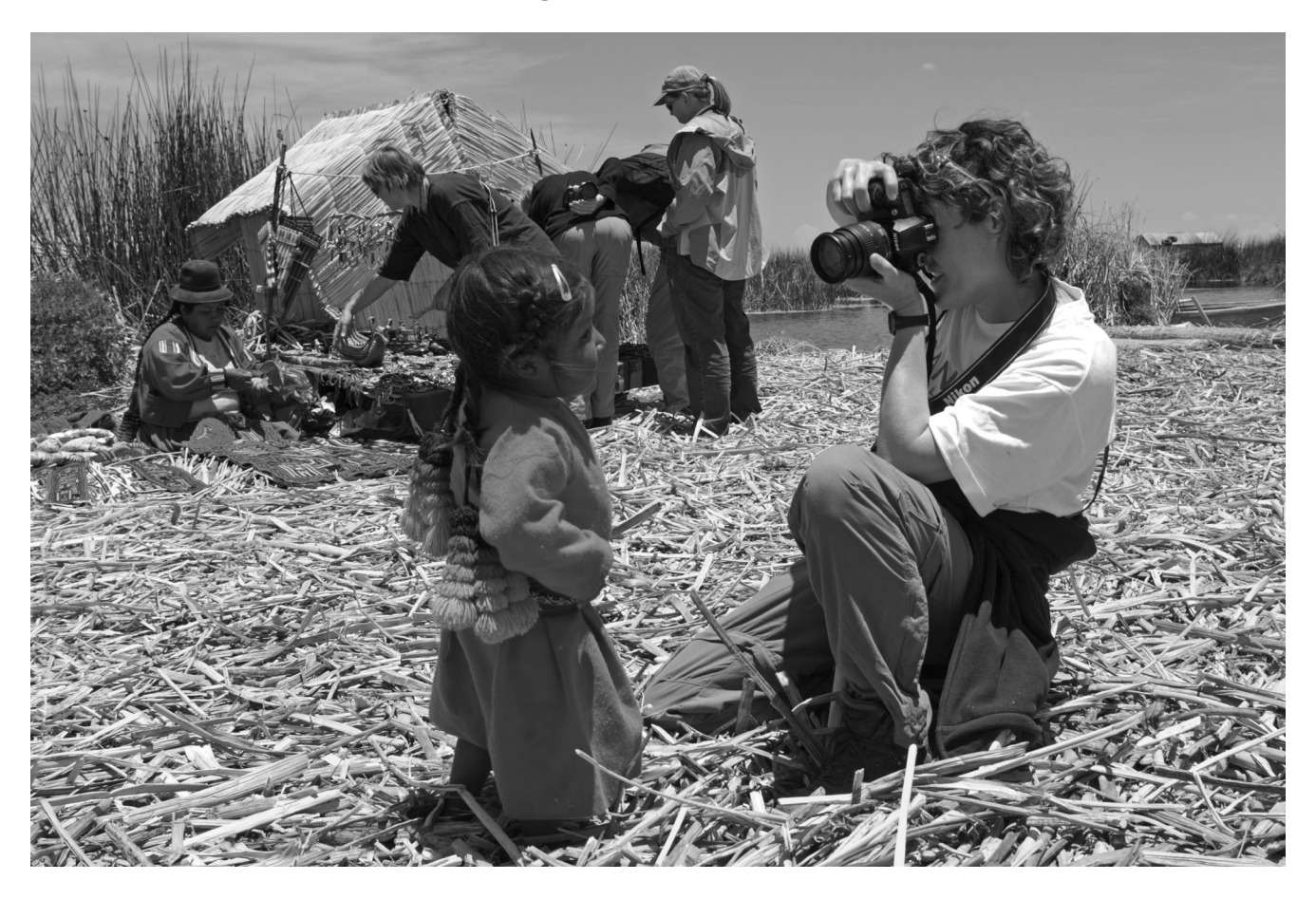
Fig. 4.1 for Question 4