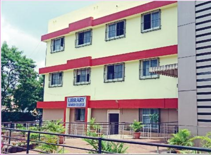
◀ Main Library Building