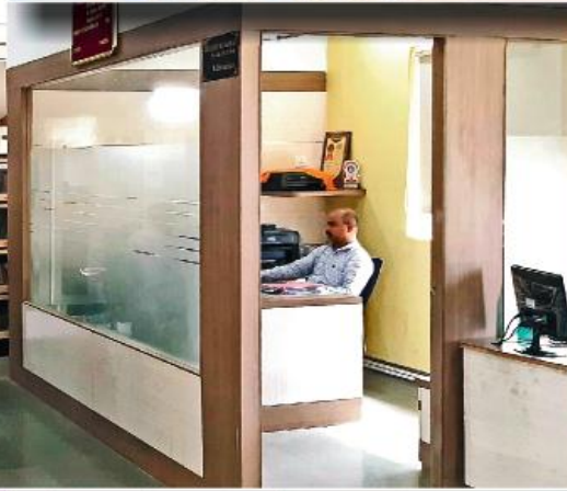
◀ Main Library