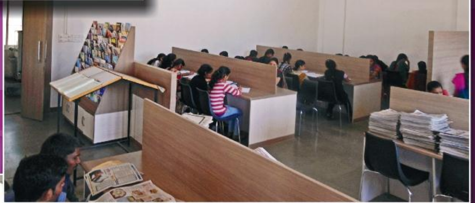
Reading Hall ▶