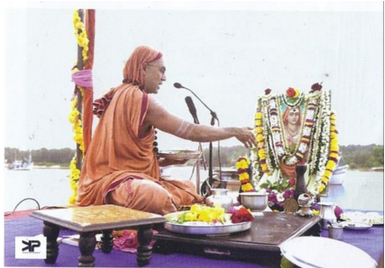
Homage to Âdi Shankarâ during Guru Pujan.