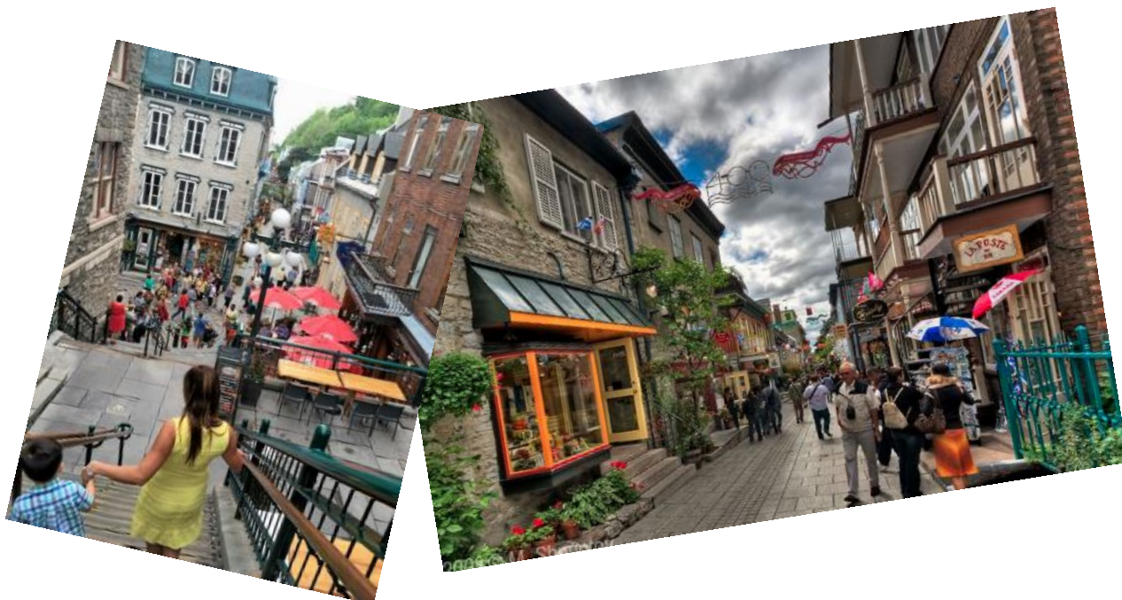
Breakneck Steps & Lower Town