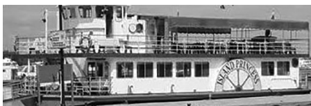
Island Princess – www.obcruise.com

Orillia Boat Cruises. We offer sightseeing, lunch and dinner cruises. Join us in the fall for our All-day Fall Color Cruise: This 6½- hour cruise sails from the Orillia Town Dock on Lake Couchiching, through Lock 42, up the