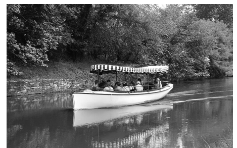
C&O Canal Launch Boat – Photo Courtesy of the National Park Service

Free launch boat tours run Memorial Day through Labor Day. Discover canal structures and their functions that made the C&O a water highway, while also learning about lives of the people that worked on and along the canal during a one hour boat trip. Tours