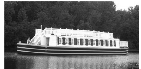
Volunteer – www.lasallecanalboat.org