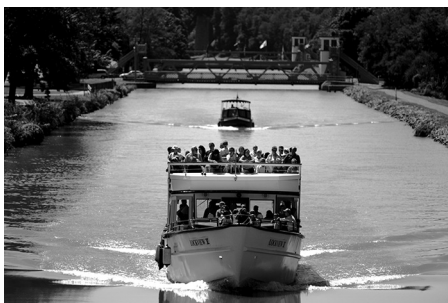
Lockport Cruise – www.lockportlocks.com

Experience "Life in the Past Lane" when you get on board for your cruise on the historic Erie Canal, a 363-mile waterway between the Hudson River with Niagara River and the Great Lakes and an important part of American history. Your fun and informative cruise will take you past five of the original 1800's locks. Three million gallons of water will fill Locks 34 & 35, the only double set on the Erie Canal, and raise the boat 50 feet. You'll pass under Lockport's "Upside Down Bridge," Lockport's "Big Bridge" (the widest bridge in the U.S. at 299 feet wide), through the "deep rock cut" and under lift bridges. The lively narration by the Coast Guard Licensed Captains is also accompanied by crowd-pleasing canal music, popular during the 1800's. Call us to schedule a cruise! Public Daily Cruise $18.50, adult; $10, ages 4-10. 210 Market Street, Lockport, NY 14094 716-433-6155 or 800-378-0352 info@lockportlocks.com www.lockportlocks.com Facebook @LockportLocksErieCanalCruises