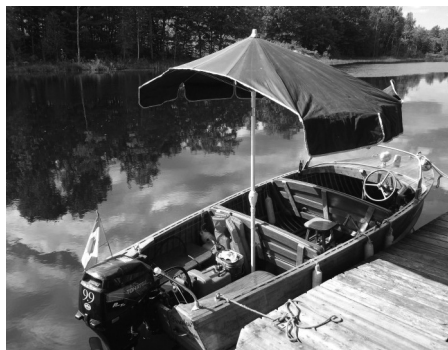
Piratos – Washago Cruise Lines

Washago Cruise Lines , cruising the historic Severn River in beautiful Muskoka. Board our 60-year-old vessel for a unique voyage on the historic Black, Green, and Severn river systems. The Piratos is driven by a quiet 4-stroke engine and can be covered upon request. Our journey may include The Old Mill, the confluence of the Black and Green rivers, the site