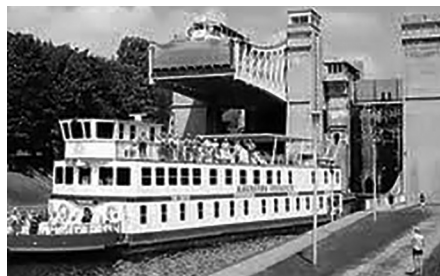
Kawartha Voyageur

The Rideau Canal offers a time capsule of quiet history as it was on completion in 1832. Of the 35 locks we travel through, all but 3 are constructed of hand-cut stone and are manually operated by the lock staff. The Rideau Canal was designated as a UNESCO World Heritage Site in 2007.