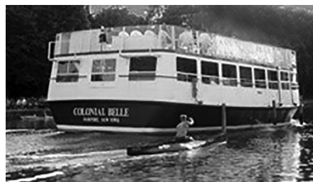
Colonial Belle- www.colonialbelle.com .

The Colonial Belle has been providing Erie Canal boat cruises from mid-May through October for over 20 years. Come aboard in Fairport, NY, just 20 minutes from Rochester.