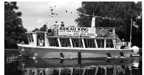
Rideau King – www.rideaukingtours.com

The Rideau King , a fifty-foot steel tour boat, sails Monday–Thursday every week between Ottawa, Merrickville and Westport, Ontario on the historic Rideau Canal. Constructed in the early 1800s, the Rideau Canal has served Canadians as a military, commercial, and vacation thoroughfare for almost 200 years. Recently designated a World Heritage Site, the Rideau Canal stretches from Kingston to Ottawa. Take our tour and discover one of the most beautiful and scenic waterways in North America. Friday through Sunday, the Rideau King is host to personal charters like weddings, anniversaries, birthdays and corporate events. This is a daylong trip and the price includes a motor coach return to your vehicle. Contact us by phone anytime between 9 a.m. and 6 p.m. EDT 1-613-269-9342; Rideau King Tours , P.O. Box 201, Merrickville, Ontario, Canada K0G 1N0; rideauking@bell.net ; www.rideaukingtours.com .