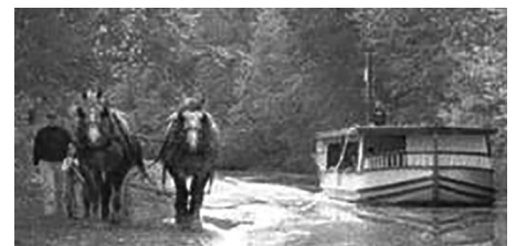
Monticello III – www.coshoctonlakepark.com

Weekdays - Charters only Saturday & Sunday-1, 2, 3, & 4 p.m. $8.00 for adults, $7.00 seniors (ages 60+), $6.00 for students (ages 6 - 18) and children 5 and under are free. 23253 State Route 83, Coshocton, Ohio 43812-9601; 740-622-7528; 740-622-3415; 800-877-1830. www.roscoevillage.com/attractions-activities/horse-drawn-canal-boat-rides Facebook @historicroscoevillage