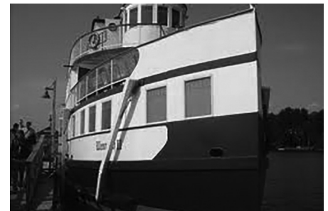
Wenonah II – realmuskoka.com/muskoka-steamships/

Muskoka Lakes Navigation Company –Hop aboard the RMS Segwun , the oldest operating steamship in North America. Enjoy the modern conveniences blended with historical charm aboard Wenonah II .