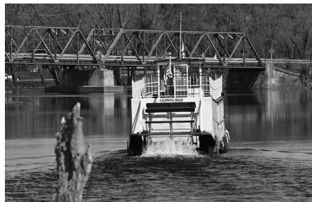
M/V Caldwell Belle

The Caldwell Belle provides tours along the upper Hudson River and Champlain Canal waterways. Her home port is located next to Lock C5 on the Champlain Canal near the Village of Schuylerville and in the town of Saratoga. Providing a variety of excursions and cruises that are sure to please, the M/V Caldwell Belle is an authentic chain-driven sternwheel riverboat able to navigate in waters as low as three feet! Mooring at Lock C5, 130 US 4 N, Schuylerville, New York; Mailing Address: P.O. Box 95, Schuylerville, NY 12871; 518-636-6146; mohawkmaidencruises@gmail.com; www.mohawkmaidencruises.com. Facebook @MowhakMaidenCruises