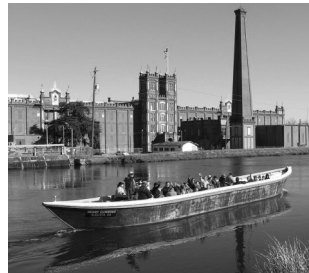
Petersburg Canal Cargo Boat

Augusta Canal National Heritage Area, 1450 Greene Street, Augusta, Georgia 30901; 706-823-0440; www.augustacanal.com . Facebook @AugustaCanalNHA