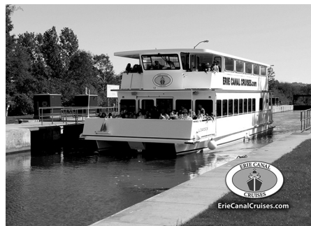
Lil' Diamond III – www.eriecanalcruises.com