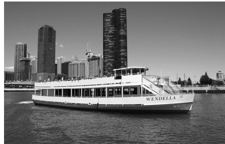
Wendela Boats – www.wendellaboats.com

Take a journey back in time aboard the Volunteer , a 70-passenger, mule-pulled 1840's replica canal boat, as it coasts gently up and down the I&M Canal . Bring your camera, grab a snack and something to drink at the Lock 16 Cafe & Visitor Center, and climb aboard for an hour of peaceful, historical fun! Every trip begins with "Mule Tending 101" as our period dressed guides introduce the passengers to their intrepid canal mules, Moe & Joe. The tour guide regales everyone with tales of the canal while the deck hands guide the boat a mile up the canal to the Little Vermillion aqueduct and back.