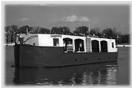
Sandpiper – www.sandpiperboat.com