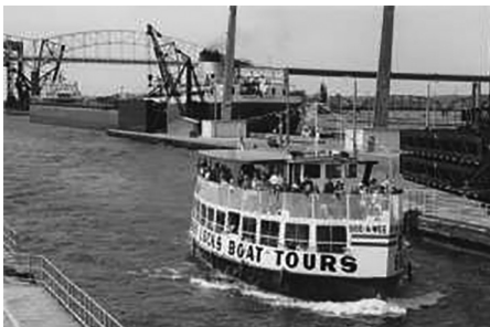
Soo Lock Boat Tours – www.soolocks.com

Soo Locks Boat Tours, P.O. Box 739, Sault Ste. Marie, MI 49783 Dock #1, 1157 East Portage Ave. Dock #2, 515 East Portage Avenue, 906-632-6301; sales@soolocks.com; www.soolocks.com, www.facebook.com/Soo-Locks-Boat-Tours-Dinner-Cruises-142998785746841/