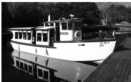
Ontario – www.eriecanalcamillus.com