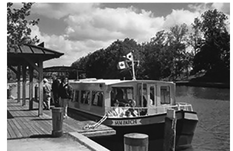
Sam Patch - www.sampatch.org

Corn Hill Navigation operates the historic Erie Canal replica packet boat Sam Patch on the Erie Canal from early May through October 31. Daily Erie Canal Cruises leave from 12 Schoen Place, Pittsford, N.Y. Daily cruises offered at noon, 2, and 4. Please see website for wine and dinner cruise dates. Adults – $16; Seniors 65+ and Active Military – $13 Students 13-22 – $13; Children 3-12 – $8; Children 2 and under – Free. 585-662-5748 for information and reservations. www.sampatch.org/ . Facebook @sampatch.org