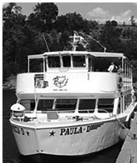
Paula D – www.paulsboatcruises.com

www.paulsboatcruises.com/ottawa_riv.htm ; office: 613-225-6781; dock: 613-235-8409; paulcruises@aim.com 219 Colonnade Road, Ottawa, ON K2E 7K3