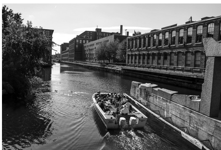
Lowell National Historical Park - Courtesy NPS

Boat tours are $12 for adults, $10 for seniors (62+), $8 for students (age 6–16), and free for children 5 and under. Spaces for tours, especially for boat tours, are limited and reservations