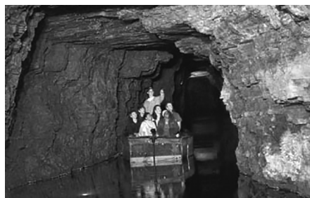
Lockport Cave and Underground Boat Ride - www.lockportcave.com

Marvel at artifacts left by miners on the Erie Canal over a century ago. And view cave formations in their early stages of development. Visitors are awestruck as they take a ride that has been described as both "peaceful and eerie" as the boat glides through the lifeless water, illuminated only by small, sporadically placed electric lights. 5 Gooding Street, Lockport, NY, 14094; 716-438-0174; www.lockportcave.com . Ticket Office: 5 Gooding Street, Lockport, NY, 14094. Rates: Adults: $16.00, Children (6-13): $10.25 Children 5 and under: $3.25 Facebook @LockportCave