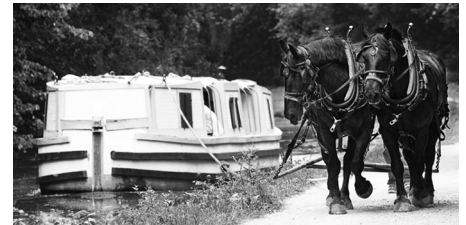
St. Helena III – www.discovercanalfulton.com

We recommend arriving 30 minutes prior to your ride time in order to purchase tickets and view the DVD presentation entitled “Our Canal Heritage” before you board the canal boat. For more information: 330-854-6835; 125 Tuscarawas St, Canal Fulton, Ohio. canalway@cityofcanalfulton-oh.gov ; Web site: cityofcanalfulton-oh.gov/departments/canal-boat-operations/ Facebook @DiscoverCanalFulton