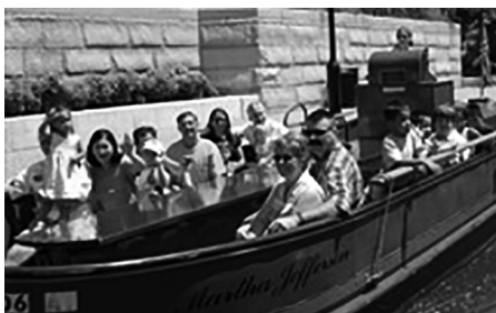
James River and Kanawha Canal – www.venturerichmond.com

Facebook @venture.richmond 800-649-2800; 804-788-6466.