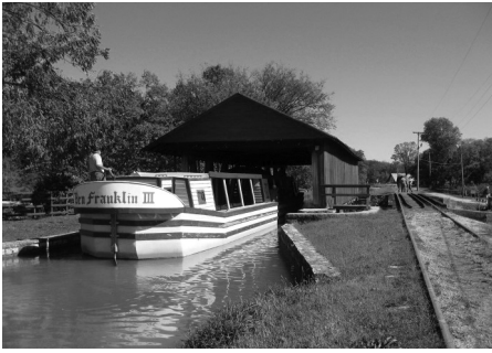
Ben Franklin III – www.indianamuseum.org

Step aboard the Delphi for a trip down the Wabash & Erie Canal in Delphi, Indiana. The boat runs on Saturdays and Sundays from May 12, 2018 through Labor Day at 1:30, 2:30 and 3:30 p.m. Public rides are $7 per adult, $4 per child. Special arrangements are required for our chartered tours. Prices for chartered tours are $150 for the first ride and $100 for each additional ride. The Delphi holds approximately 30 people. Rides last approximately 40 minutes.