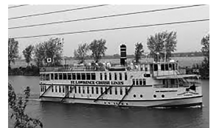
St. Lawrence Cruise Lines – www.stlawrencerivercruise.com

On the southern portion of the Trent-Severn Waterway, between