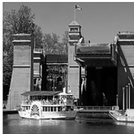
Peterborough Lift Lock www.liftlockcruises.com

888-535-4670; info@liftlockcruises.com , www.liftlockcruises.com .