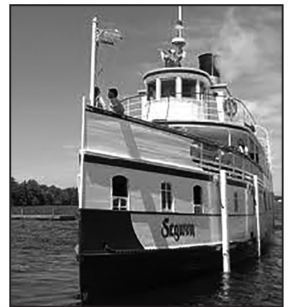
RMS Segwun