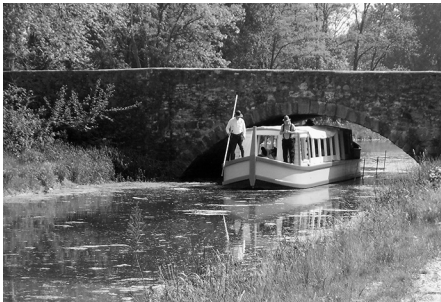
Delphi – www.wabashanderiecanal.org

The Johnston Farm & Indian Agency is proud to own and operate one of Ohio's working canal boats still drawn, as it was nearly two centuries ago, by a team of mules. Guests may enjoy a ride aboard the General Harrison of Piqua , a replica 70-foot-long canal boat often used for transportation of passengers and cargo in the 19th century. Costumed guides direct the mule-drawn boat to provide an authentic and memorable experience for all. For hours of operation and events visit us at www.johnstonfarmohio.com or by calling 937-773-2522. Johnson Farm & Indian Agency, 9845 Hardin Rd, Piqua, Ohio 45356.