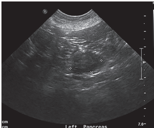
FIGURE 1. Ultrasound image of mass lesion within the left wing of the pancreas. Approximately 50% of insulinomas are not visualized by this technique.

Most insulinomas are solitary masses that can be detected intraoperatively with gentle palpation of the pancreas. Intraoperative ultrasound with IV 1% methylene blue has been used for additional visualization of the pancreatic lesion but is of questionable value.