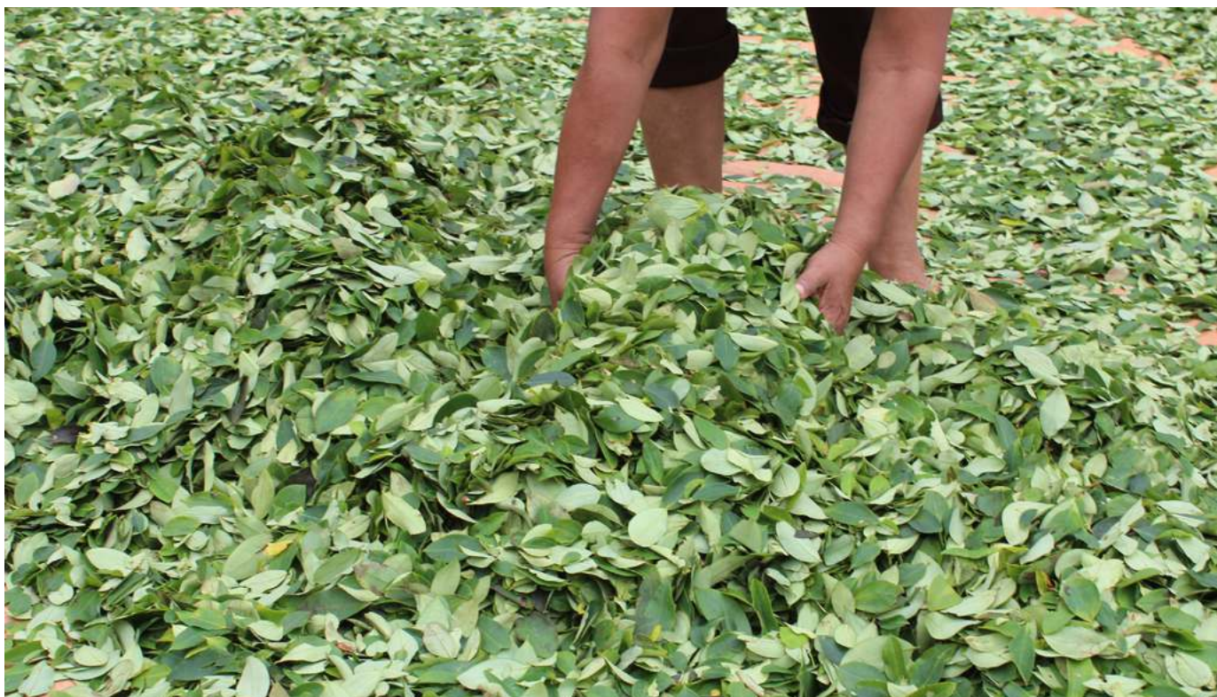
Coca is dried in Bolivia.

following the same treaty procedure, but there are differences to be taken into account. The main legal issue relates to article 19 of the VCLT, which requires that a reservation must not be "incompatible with the object and purpose of the treaty." Those overall aims of the Single Convention are expressed in the preamble's opening paragraph regarding concern about "the health and welfare of mankind" and the treaty's general obligation to limit controlled drugs "exclusively to medical and scientific purposes." Making a reservation exempting a particular substance from the treaty's general obligation to limit drugs exclusively to medical and scientific purposes is explicitly mentioned in the Commentary on the Single Convention as an option that could be procedurally allowable, for coca leaf as well as for cannabis. 47 While the absence of any accompanying cautionary text seems to imply that exemption by means of a reservation of a specific substance from the general obligations would not in itself constitute a conflict with the object and purpose of the treaty as a whole, this would certainly be an important legal discussion to be had in the context of crafting reservations. The same issues would arise with an inter se agreement (see above), which comes close to a form of "collective reservation."