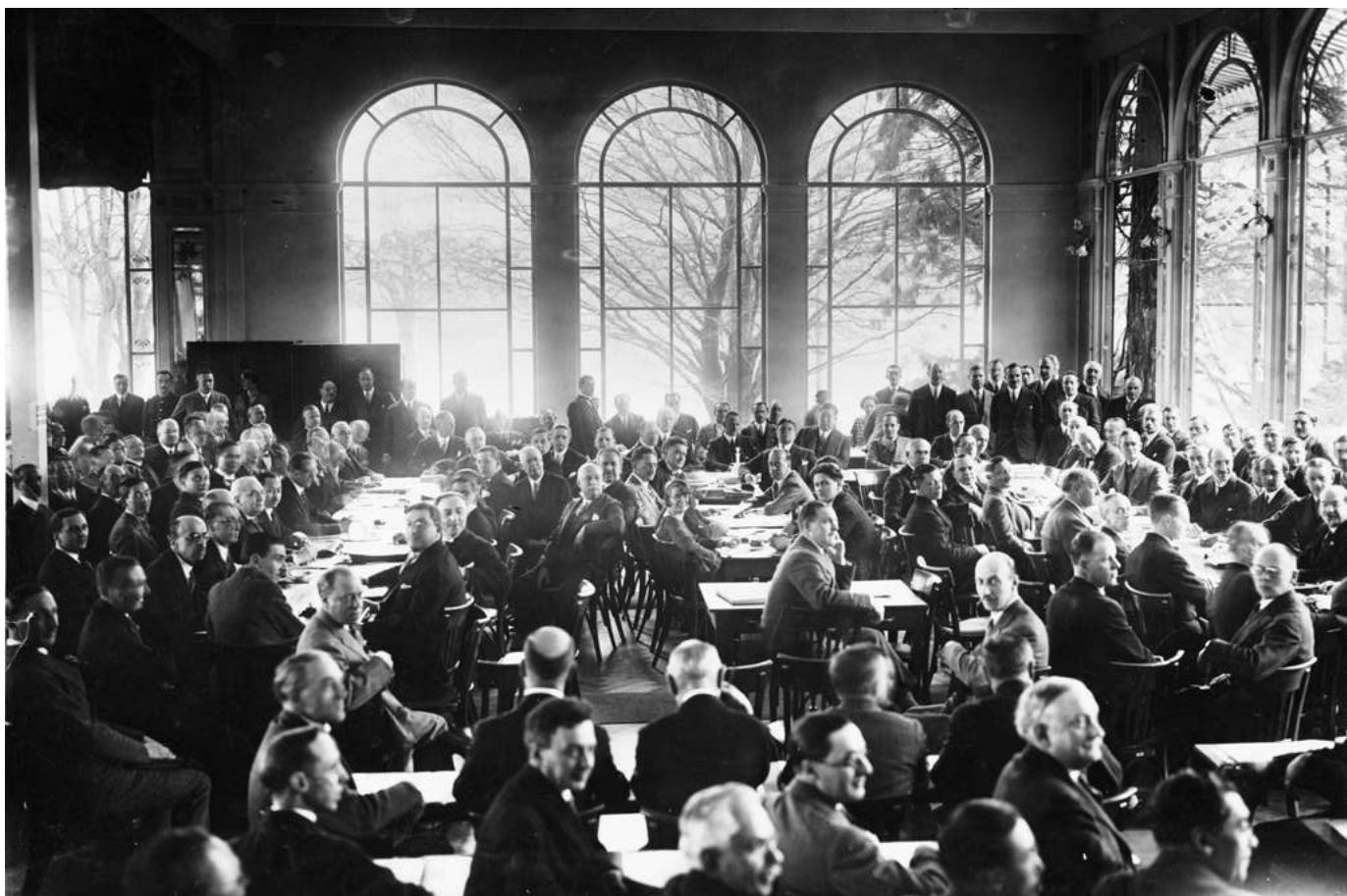
Second Opium Conference in Geneva, 1924-1925.

The Rise and Decline of Cannabis Prohibition (Transnational Institute & Global Drug Policy Observatory, March 2014), https://www.tni.org/en/publication/the-rise-and-decline-of-cannabis-prohibition