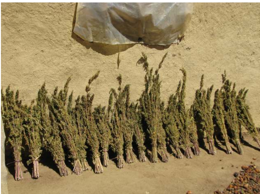
Cannabis drying in Morocco.

Moreover, what we can now see is that it is not the case that States will face significant condemnation from the international community for cannabis reforms that are increasingly common practice across the world. Opting for reform and acknowledging non-compliance can help set the stage for treaty reform options that can be implemented collectively among like-minded States, such as the inter se option.