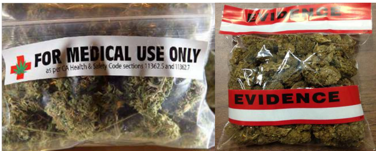
Above, cannabis as both a licit medical product and police evidence.