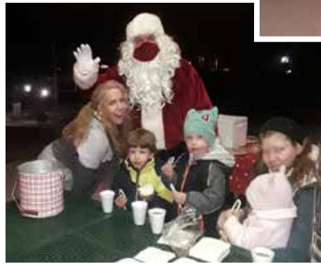
Santa was there and handed out candy canes to the children asking them about their toy wish list.

The Canterbury HOA Board would like to thank all the volunteers who helped make this event possible.