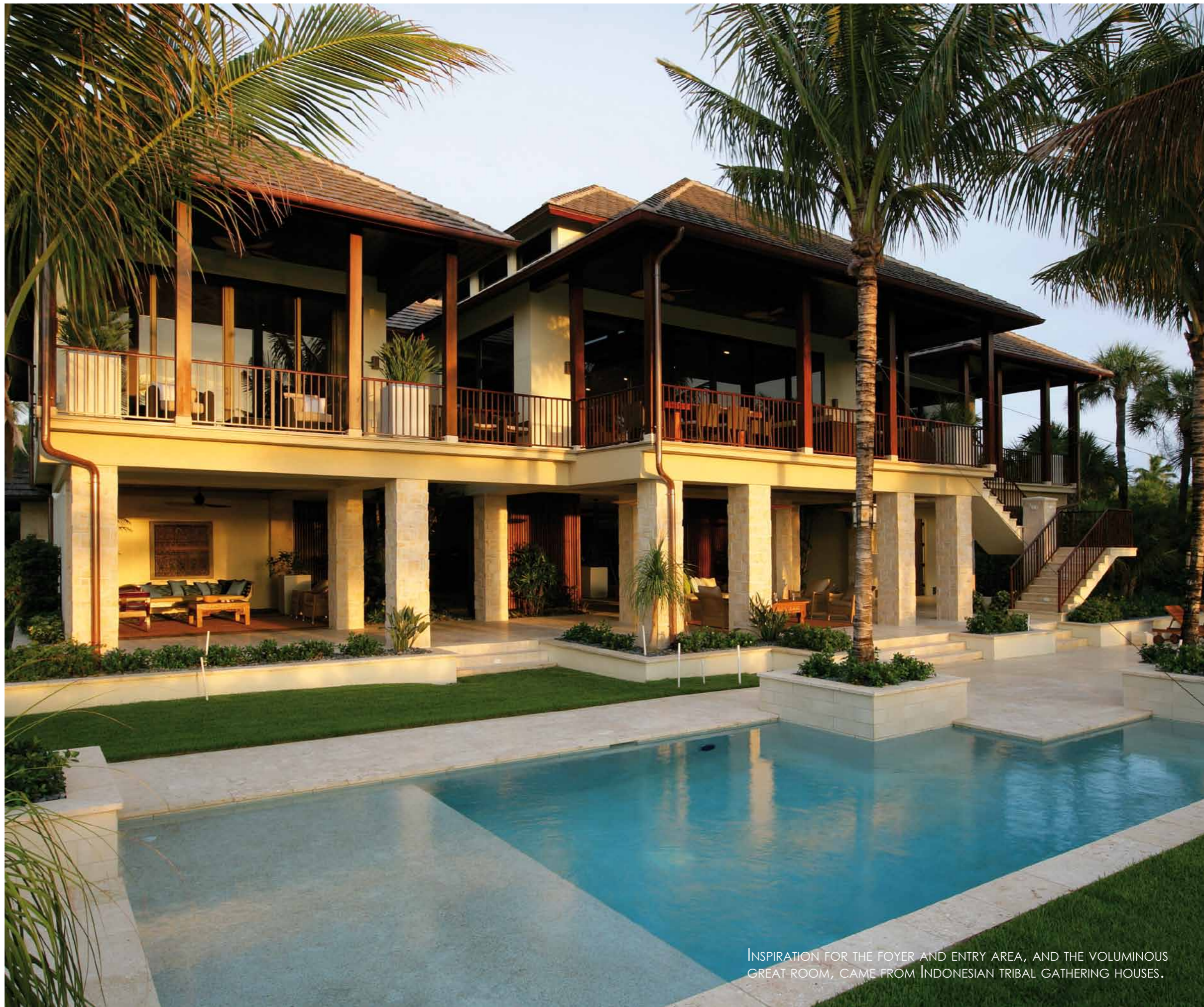
INSPIRATION FOR THE FOYER AND ENTRY AREA, AND THE VOLUMINOUS GREAT ROOM, CAME FROM INDONESIAN TRIBAL GATHERING HOUSES.

"These are hard woods, rainforest trees, but farmed," says Jenny. "The wavy grain of the sapele and the melon tone of the quartz countertop are subtle touches that instil character." ►