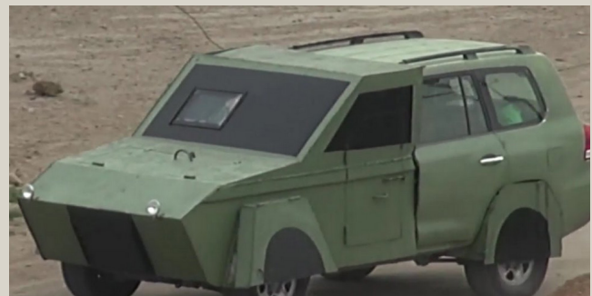
An ISIS stage 2 camouflaged SVBIED used against Iraqi forces in western Mosul. (ISIS video release, February 2017)

After a while, SVBIED workshops began experimenting with other colors, and soon up-armored SVBIEDs appeared painted dark red, light blue, and even bright yellow. The prevalence of these colors grew once fighting began in western Mosul, with SVBIEDs in bright green, blue, red, and yellow used on a more regular basis. With these new and diverse colors, ISIS aimed to make it more difficult for Iraqi forces to recognize and counter SVBIEDs. 13