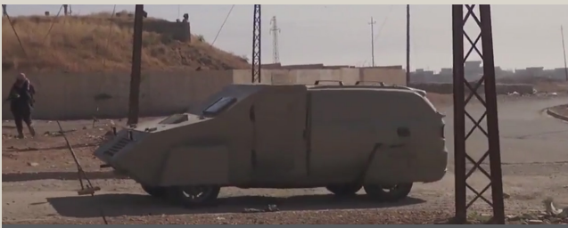
An ISIS desert-colored up-armored SVBIED used on the outskirts of Mosul. (ISIS video release, November 2016)

Even after Iraqi forces reached the outskirts of the city in late October, ISIS continued to use desert-colored SVBIEDs until December. However, when the Iraqi forces penetrated the city's outer defenses, all-white up-armored SVBIEDs began to appear, replacing the desert-colored vehicles. This was the first stage of the "camouflaged SVBIED."