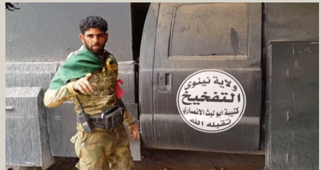
An ISIS black SVBIED captured by Liwa Ali al-Akhbar in Salahuddin Province in late 2015. (Deleted youtube video, Stahlgewitter Sy)

well as neighboring Salahuddin and Dijlah. These new SVBIEDs were overhauled black pick-up trucks with similar modifications, including frontal slat armor. These vehicles stood out compared to the average up-armored SVBIED. Interestingly, the logo on the side of these SVBIEDs was always blurred out in official ISIS video releases.