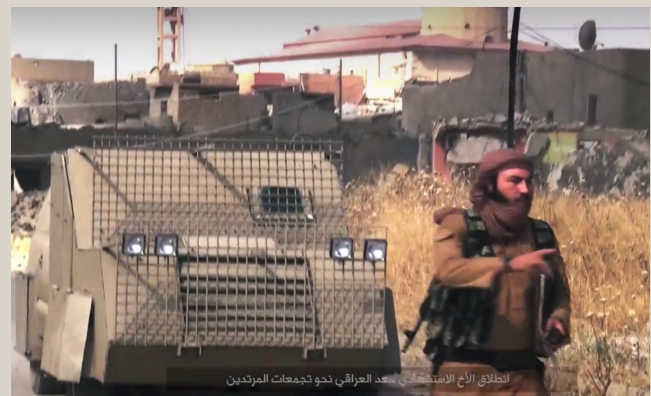
An ISIS up-armored SVBIED with slat/cage armor used on the outskirts of eastern Mosul.

Seeing as ISIS often operates at a numerical disadvantage, the use of up-armored SVBIEDs in combat functions was a powerful force multiplier that enabled a smaller attacking force to overrun larger enemy contingents. The primary military application of up-armored SVBIEDs has been its ability to initiate battles by softening static enemy defenses before a ground assault.