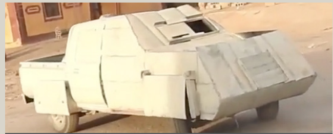
An ISIS SVBIED used in the Syrian desert north of the Euphrates.

After the fall of Raqqa, ISIS's territorial losses only continued. Both Syrian loyalist forces and the SDF began near-simultaneous offensives against ISIS-held areas in Syria. Between July and December 2017, Syrian loyalist forces captured nearly all of the central and eastern Syrian desert from ISIS control. This area included the cities of Deir ez-Zor, Mayadin, and al-Bukamal. Concurrently, the SDF managed to take nearly all territory north of the Euphrates River, except for a small strip of villages close to the Iraqi border around Hajin. Throughout fighting in central and eastern Syrian desert and in the deserts north of the Euphrates, ISIS reverted mainly to desert-colored and plain up-armored SVBIEDs.