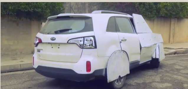
An ISIS all-white up-armored SVBIED used against Iraqi forces in eastern Mosul.

While white was the most common color for SVBIEDs in the battle of Mosul, some pick-up truck and SUV-based SVBIEDs also appeared in grey and black. These colored SVBIEDs demonstrate a deliberate effort to blend in with civilian vehicles and deceive Iraqi forces and U.S.-led coalition aircrafts by masking the SVBIEDs' armor and making them appear as unmodified civilian vehicles. 12 The change in color was mostly a product of the change in operational surroundings from open plains to sprawling urban terrain, and was a continuation of