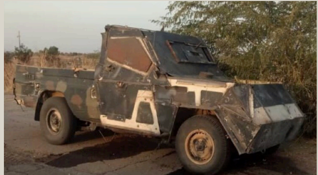
An up-armored SVBIED based on a pick-up truck seized by the Nigerian Army near the town of Baga.

Some parts of the armor, including the door, appeared to have been transplanted from a seized military armored vehicle. These advanced SVBIED designs suggest that ISWAP militants received detailed technological advice from ISIS mechanics in Syria or Iraq, either in person or online.