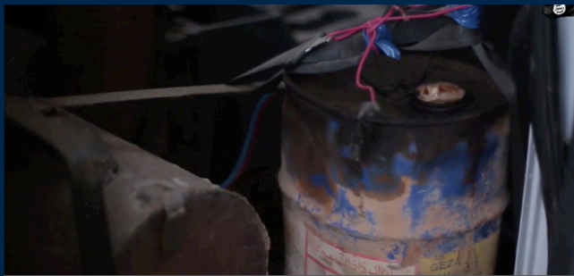
An oil barrel connected to an ISIS SVBIED payload in Furat Province.

A payload arrangement that includes crude oil in barrels and jugs. This is employed to increase the primary blast effects upon detonation of the main payload and