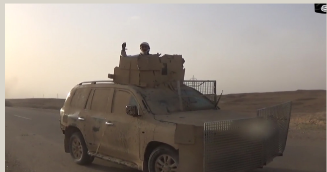
An ISIS two-man up-armored SVBIED in Anbar Province.

In the same vein, ISIS soon introduced a two-man SVBIED design. In this setup, the driver was accompanied by a rooftop gunner tasked with providing suppressing fire until the vehicle reached its intended detonation point. Typically reserved for tougher-than-average targets, two-man SVBIEDs have seen comparatively little use. They aren't restricted to a single vehicle type and a large variety of vehicles have been used as two-man SVBIEDs, ranging from SUVs and military armored vehicles to heavy trucks and front-end loaders.