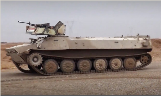
An ISIS military armored SVBIED in Salahuddin Province. (ISIS video release, November 2015)

Beyond the use of up-armored SVBIEDs based on pick-up trucks, heavy trucks, and military armored vehicles, ISIS began designing and employing more complex, target-specific SVBIED designs aimed at particularly fortified targets. Heavy construction equipment like front-end loaders and bulldozers had already been used offensively, as their ability to remove earth berms and punch through roadblocks proved essential to clearing a path for follow-up attacks by up-armored SVBIEDs. Soon, ISIS went one step further and began using up-armored front-end loaders and bulldozers as SVBIEDs themselves.