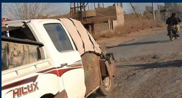
An ISIS SVBIED is guided by a local fighter on motorcycle in Hasakah Province. (ISIS Photo Report, February 2018)

During the battle of Mosul, attacking SVBIEDs would almost always be accompanied by an ISIS-operated quadcopter drone that followed them to the target. The fighters operating the drones were in continuous radio contact with the SVBIED drivers, and were thus able to direct them around roadblocks and new threats in real time, often circumventing Iraqi army defenses and striking columns of armored vehicles from directions thought to be secured. This tactic was used both during the battle of Raqqa and sporadically in fighting across the central and eastern Syrian deserts. In a February 2018 ISIS video from the Hajin pocket, an ISIS drone operator could be heard directing an SVBIED driver during attack: