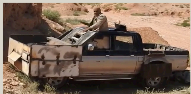
ISIS up-armored SVBIED used against Syrian loyalties in Homs Province. (ISIS video release, September 2016)

Though unrefined at the beginning, the eventual standardized up-armored SVBIED would come to feature improvised armor plating concentrated at the front of the vehicle, with metal plates focused on shielding the engine block, windshield, and tires. The plate covering the engine block typically had slats cut out of it in order to prevent overheating, and the driver's viewing port usually consisted of a rectangular hole either covered with protective glass or coupled with a smaller metal plate that could be slid into place to form a more narrow rectangle when the vehicle came under fire.