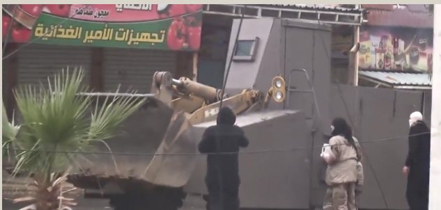
An ISIS up-armored SVBIED in Nineveh Province, made from a front-end loader (ISIS video release, January 2017)

ISIS rose to prominence in 2013-14, and at its peak, controlled territory in Syria and Iraq larger than the land area of Great Britain. 7 To facilitate management of this huge swathe of land, ISIS divided it into more than a dozen wilayat (provinces), each with a centrally appointed wali (governor) responsible for administration. Each province also had a series of diwans (departments) responsible for managing everything from health care, education, finance, and agriculture to internal security, judicial affairs, and war. 8 Diwan al-Jund , the military and defense department, oversaw the manufacturing and use of SVBIEDs in each province. To increase the efficiency of their military operations, some provinces also set up official “suicide battalions” of SVBIEDs that accompanied other ISIS vehicle formations into battle, clearing the way before a final push. 9