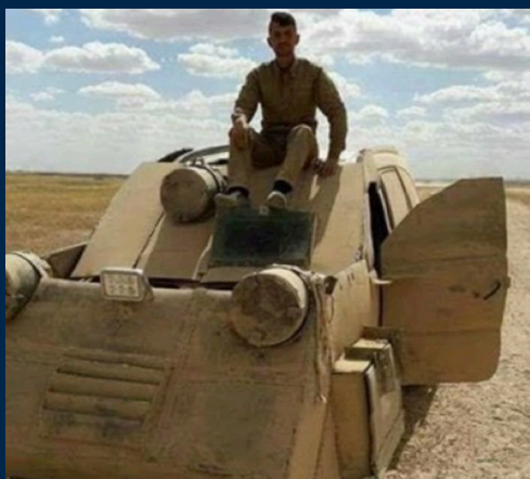
A vehicle captured by Iraqi forces. (Iraqi forces, August 2017)

A formation in which IEDs or anti-tank mines are deliberately mounted in specific directions in order to direct explosive energy outwards toward the target, rather than produce a simple explosion. In some versions, explosives are mounted on the doors and windshields on the interior of the SVBIED to