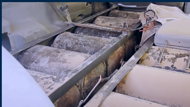
IEDs used in an ISIS SVBIED. (ISIS video release, August 2017)

A cluster of daisy-chained cylindrical metal IEDs welded in place in the rear section of the vehicle. The IEDs are typically aimed to the sides. This arrangement is most common in civilian-vehicle SVBIEDs, whether covert or up-armored.