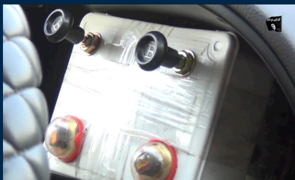
A SVBIED detonation mechanism employed by ISIS.

At the outset of ISIS's use of SVBIEDs, detonation technology was unrefined and rudimentary. Soon, however, detonation systems in SVBIEDs were improved to prevent a premature detonation by the driver, and the "white box" detonation system became the standard. The box features two sets of safeties and firing switches on separate firing circuits. Each safety must be pressed before the corresponding firing switch is activated, so as to prevent an accidental premature detonation. This also increases the chances of a successful detonation in case either of the firing circuits contains faulty wiring. Some SVBIEDs also include further precautions such as an additional set of safety and firing switches, grenade fuse-based firing switches or suicide belts worn by the drivers.