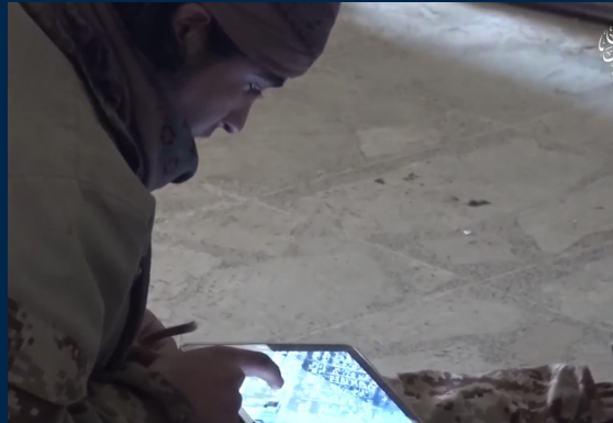
An ISIS fighter studies satellite imagery. (ISIS video release, April 2017)

Since many SVBIED drivers are unfamiliar with the area in which they are operating, they require special training and support to successfully reach their target. As drivers prepare to conduct an SVBIED attack, they study either footage recorded with a hobby drone or satellite imagery of the target site to learn the attack route. Additionally, they are sometimes guided to the frontline by local ISIS fighters on motorcycles. More recently, however, ISIS has introduced a new innovation in its support system through the widespread use of hobby quadcopter drones.