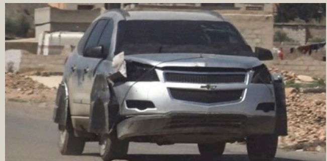
An ISIS stage 3 camouflaged SVBIED used against the SDF east of Tabqa.

This modification dramatically increased the covert nature of the SVBIED in an explicit continuation of innovation across provinces, from Mosul to Raqqa. It seemed as if the ISIS contingent in Raqqa had picked up where those in Mosul had left off, introducing new innovations to the camouflaged SVBIED designs.