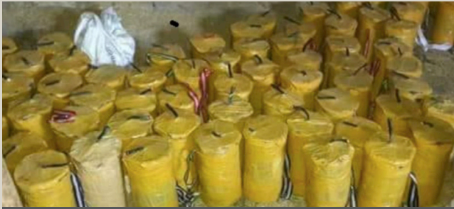
Picture allegedly showing IEDs that were used as the payload in the July 2018 Basilan SVBIED attack.

The cylindrical metal IEDs shown in the picture appeared similar to those that typically make up SVBIED payloads in Iraq and Syria. Each IED is designed to function independently in a one-off IED attack, but also works as a daisy-chained SVBIED payload. While this design isn't unique to ISIS, it is likely that ISEAP, like ISWAP, somehow received transferred knowledge from ISIS manufacturers in Syria or Iraq.