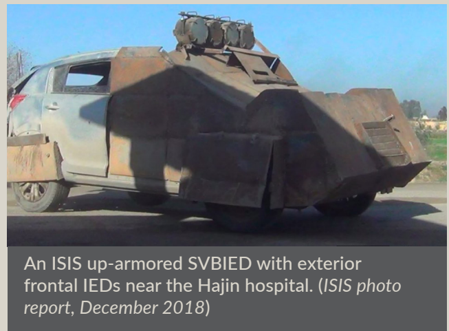
An ISIS up-armored SVBIED with exterior frontal IEDs near the Hajin hospital.

The camouflaged SVBIEDs used by ISIS after the fall of Raqqa – while impressive – were not designed for the sparsely populated desert terrain of the Hajin pocket. The new design addressed this and the constant aerial surveillance in the remaining parts of the Hajin pocket by prioritizing deadliness over stealth. While most heavily used in the Hajin pocket, SVBIEDs with exterior frontal IEDs and this type of complementary payload can be traced back to the battle of Mosul.