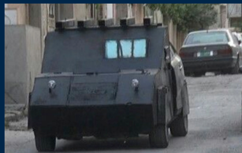
An ISIS up-armored SVBIED fitted with rooftop rockets.

This upgrade was introduced in Western Mosul as Iraqi forces advanced on the remaining ISIS contingent in this part of the city. This innovation, however, saw limited use by ISIS. Only around a dozen examples were ever manufactured, most of which were captured intact by Iraqi forces, rendering their effectiveness questionable.