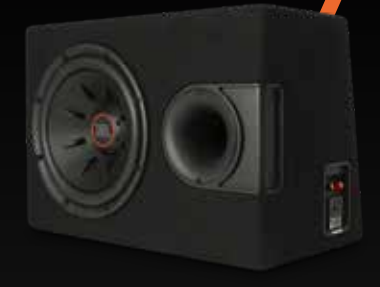
12" (300mm) 1100-Watt subwoofer ported enclosure with SSI