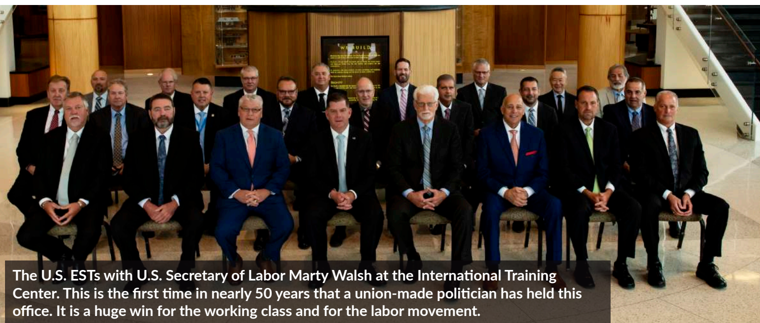
The U.S. ESTs with U.S. Secretary of Labor Marty Walsh at the International Training Center. This is the first time in nearly 50 years that a union-made politician has held this office. It is a huge win for the working class and for the labor movement.

I like the union for what it stands for and I believe wholeheartedly in what we're trying to accomplish as an organization. I enjoy the work but more importantly, I enjoy working with the people around me. We have people who make themselves available around the clock to help members. We have staff going to different departments to find answers, and staff speaking with members who are looking for guidance for long periods of time. I see it and I appreciate all the hard work everyone puts into helping each other.