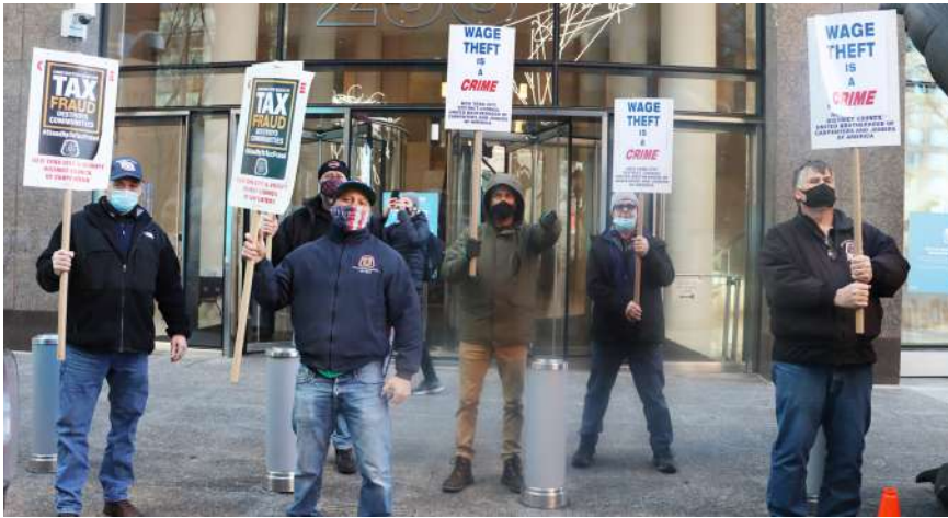
Members stand up to wage theft at 250 Vesey Street.