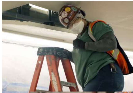
Members hard at work at the East Side Access project.

"I tell them, this is a historic job and if you're lucky enough, you get a job like this once in your career. Be proud of what you're doing. You're going to take your kids to see this. This is a historic job and you are part of it."