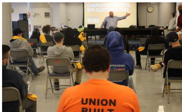
RISE training for apprentices on March 22nd.

In early 2021, we began the RISE campaign by interviewing candidates over zoom. Our members stepped up to the plate by joining training sessions to prepare for meeting the candidates and asking poignant questions. After the interviews, members discussed what they liked about the candidate and what didn't resonate with them. Getting to know the candidates we endorse is a huge part of staying politically active. Through our member-led endorsement process, we were able to successfully elected candidates who will stand up for union issues and work with us on future campaigns. Thank you to all our members who participated! Visit http://carpenters-rise.flywheelsites.com to learn more!