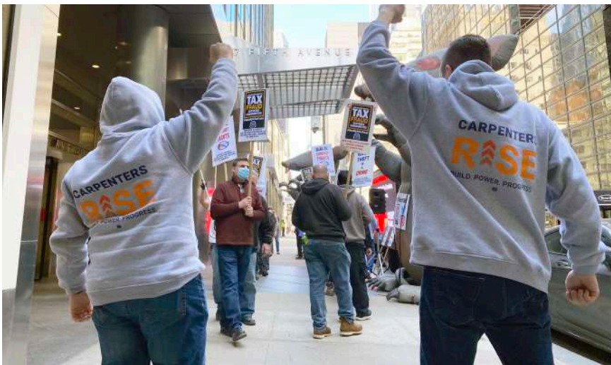
Members stood outside the Waldorf Astoria Towers Development to protest the hiring of Trident, a non-union company that provides no healthcare and has no area standard wages.