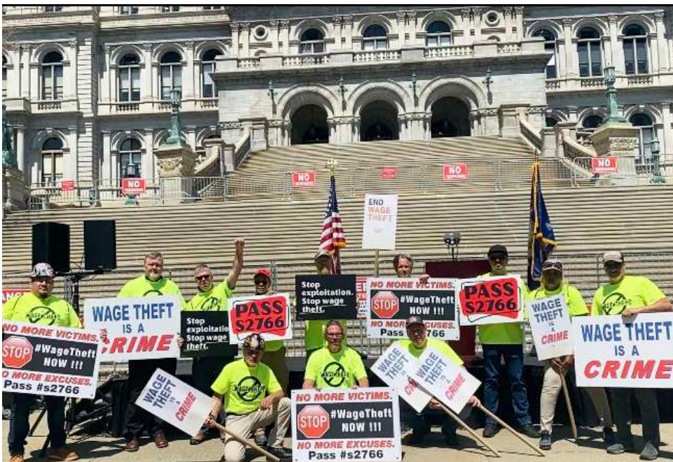
Members traveled up to Albany to let lawmakers know we won't stand for stolen wages!