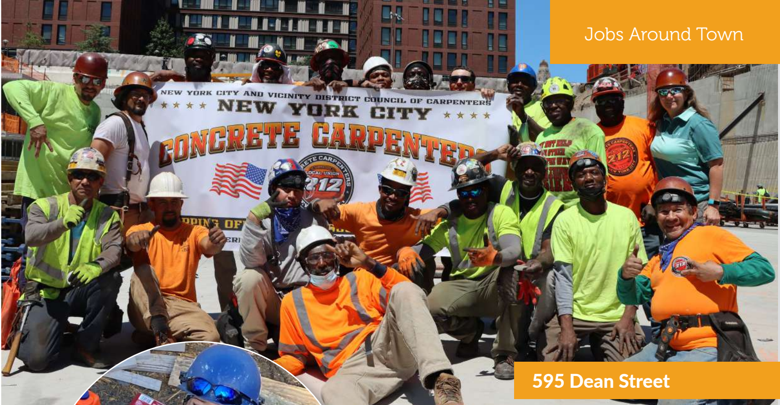
595 Dean Street