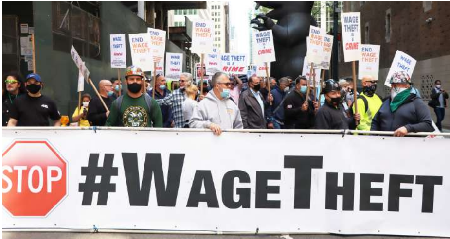
Members march at the wage theft rally.