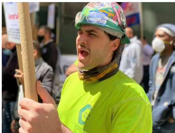
Members marching to pass the wage theft bill.