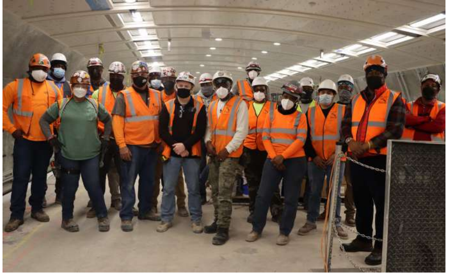
The Creative Construction team at the East Side Access Project.

"We are a small minority company and it was a challenge for us," he said. "There were those that said we couldn't do it because of the size of the project – we're talking about almost 200,000 sq. ft. (that's 3 ½ football fields!) of metal pan ceiling and aluminum, the logistics of securing the materials then transporting it, and making sure it worked. So far, we brought out almost 1,080 crates of materials. But we were able to get it done."