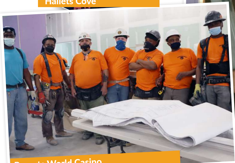
Resorts World Casino