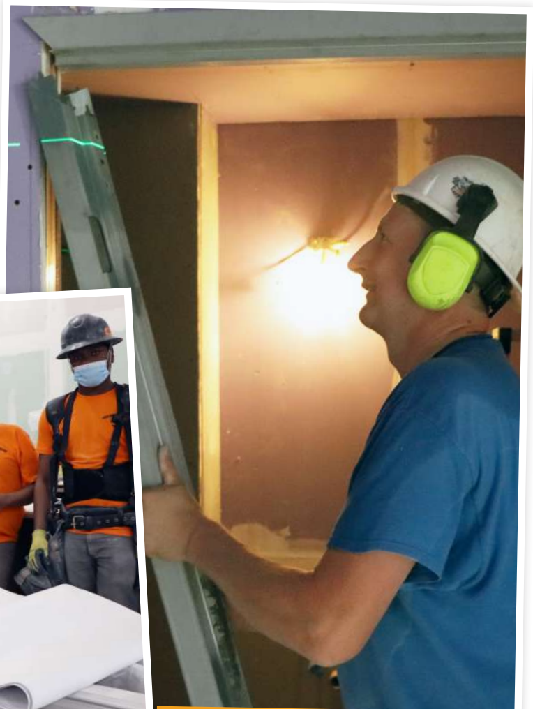
Bishop Valero Residence