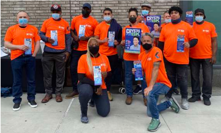
Members supporting City Councilwoman Crystal Hudson, District 35 in Brooklyn.

As the New York City June 22nd primary election drew near, our members came out for our endorsed candidates in full force! As carpenters, we support those who support us. We marched on streets, knocked on doors, canvassed for candidates, and spread the word that carpenters are rising on the political front. It is up to us to become a political powerhouse and take back market share. Check out some of the work our members did for labor-friendly candidates below.