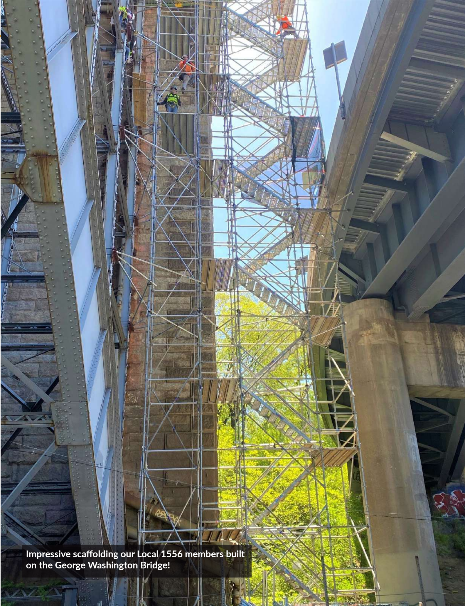
Impressive scaffolding our Local 1556 members built on the George Washington Bridge!