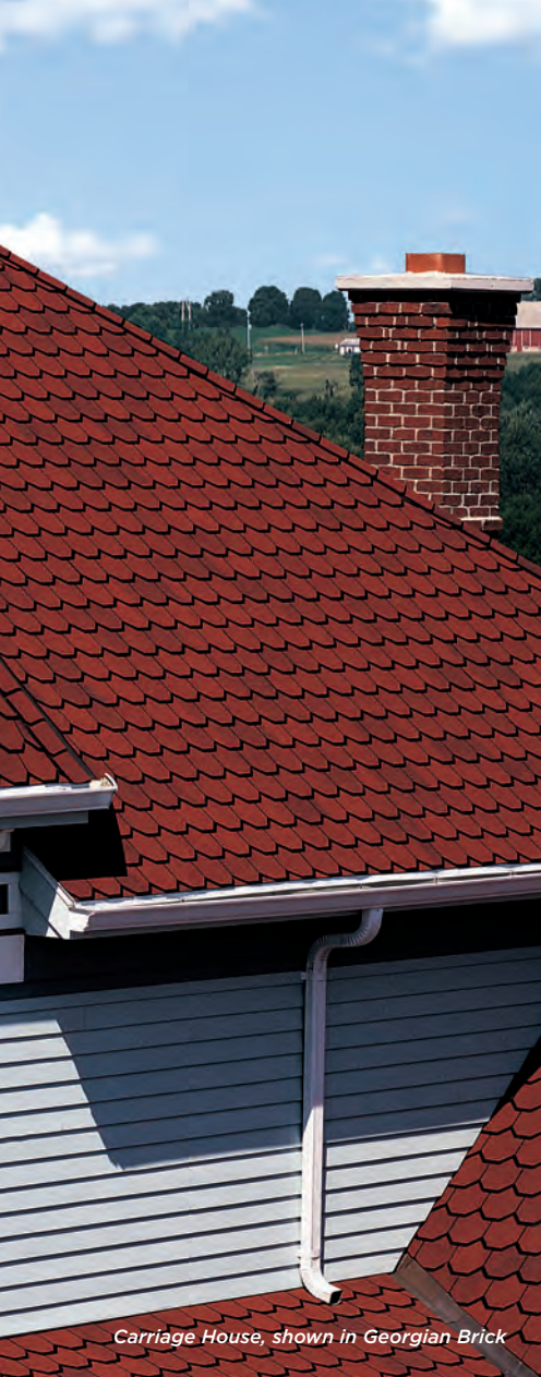
Carriage House, shown in Georgian Brick