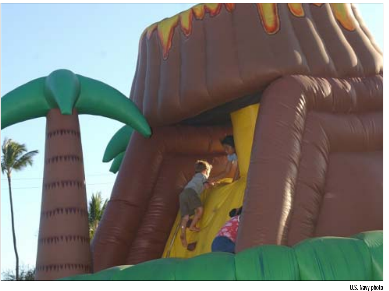
Keikis get a chance to crawl climb, and jump around in the inflatables by Xtreme Fun. There will be an assortment of keiki and adult activities available.

For more information on the July 4th Block Party, visit the MWR Website at www.greatlifehawaii.com or call 473-0606.