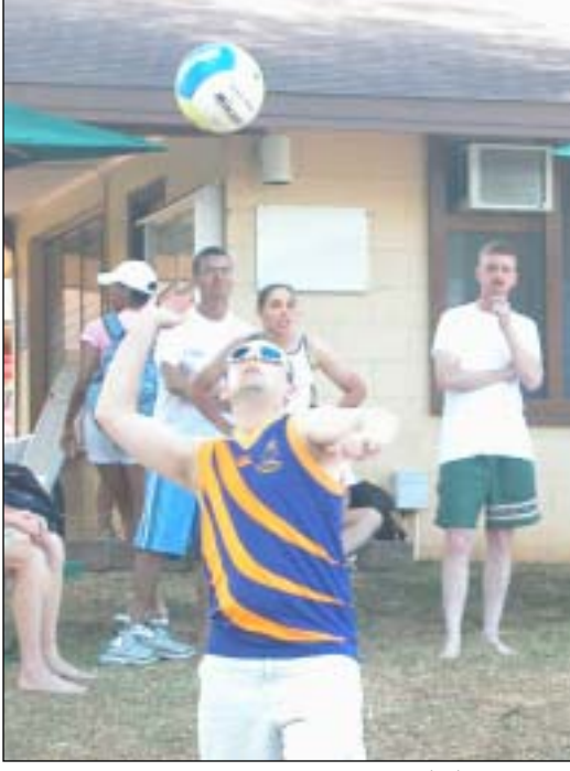
A player from (get team) sets up a serve during Wednesday's game in which the Columbia team destroyed the Lake Champlain team in the third of three games with a score of 10-1.