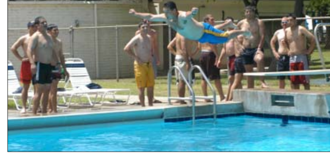
Contestant soars through the air trying to win the title Champion Belly Flopper as crowd looks on.

Several other RIMPAC events are scheduled throughout July. For a listing of all sporting events, see B section.