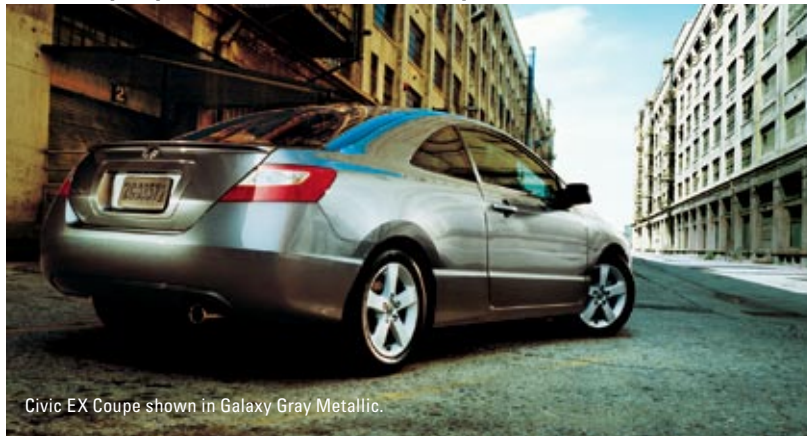
Civic EX Coupe shown in Galaxy Gray Metallic.