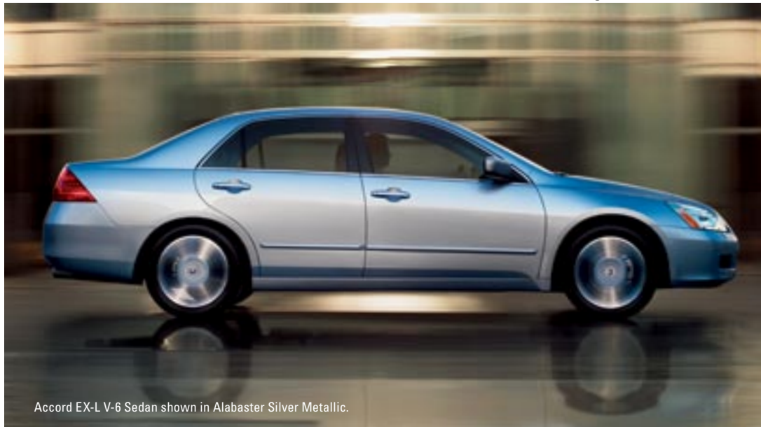
Accord EX-L V-6 Sedan shown in Alabaster Silver Metallic.

Leather and satellite navigation 4 are available.