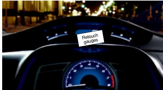
The two-tier instrument panel is a quick read.