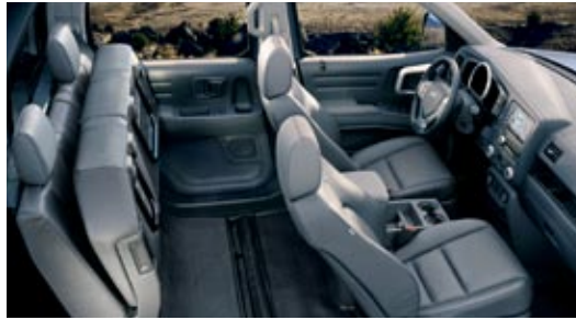
The rear seat flips up for even more cargo room. 14

*Horsepower and torque calculations reflect SAE J1349 procedures revised August, 2004.