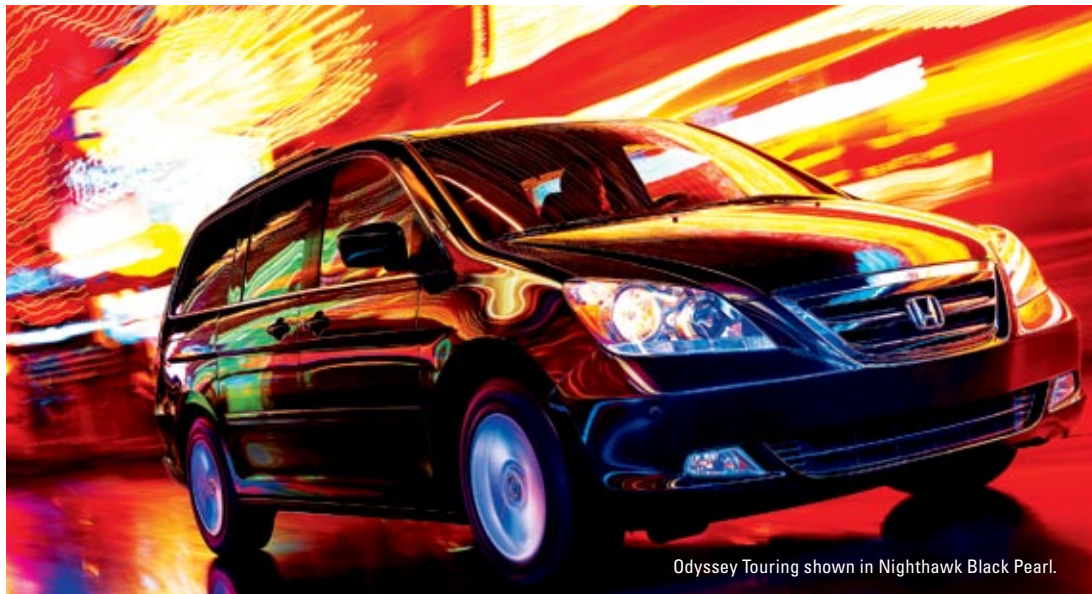
Odyssey Touring shown in Nighthawk Black Pearl.

The Odyssey has long defined what a minivan can be. And year after year, the Odyssey proves itself a favorite among owners and automotive critics alike. It repeated its Best Van win in Car and Driver's 2006 "5Best" Trucks 9 competition, and Automotive Lease Guide has again awarded its Minivan Residual Value Award to the Odyssey for 2006. 13 People who drive one are quick to understand that Odyssey is more than transportation—it's a rolling showcase of technology, advanced safety and fun-to-drive performance. You could say it's the essence of everything Honda knows—in minivan form.