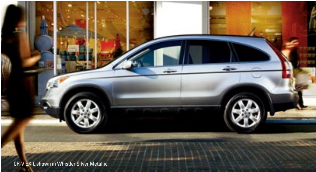
CR-V EX-L shown in Whistler Silver Metallic.

It's something new to crave. Sure, the CR-V has always offered a lot to love. But one look tells you that the all-new 2007 CR-V has taken desire to a whole new level. From its alluring sheet metal to advanced technology and available leather seating, this CR-V is everything you want. And true to its core values, it's also everything you need. Five adults can soak up its spacious comfort, with lots of cubic space left for cargo. 14 And every new CR-V comes with a full complement of safety features, including six airbags and Vehicle Stability Assist (VSA). So the new CR-V is a lot more than just an irresistible new face.