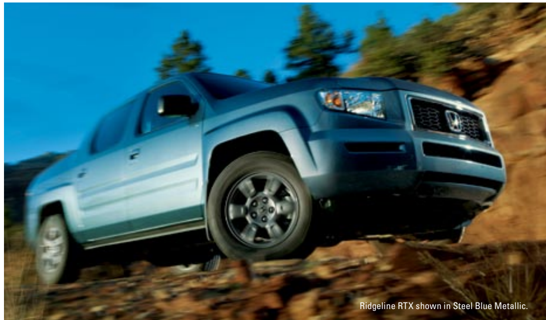
Ridgeline RTX shown in Steel Blue Metallic.

Right out of the gate, the Ridgeline made its point, earning the 2006 “North American Truck of the Year” award. It’s tough, big and plenty powerful. And it’s a Honda, so it’s got plenty of versatility, innovation and performance, too. For starters, check out the huge, lockable In-Bed Trunk and an interior just as comfortable as it is functional. Then get out on a rough road and feel how 247 hp flowing through VTM-4® 4WD can smoothly power you ahead. The results are in—the Ridgeline is all truck. And then some.