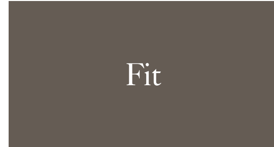
The new Fit makes small feel big.