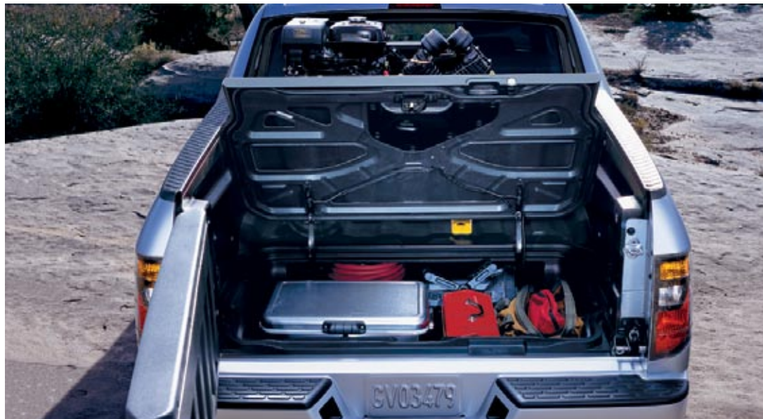
There's never been an In-Bed Trunk™ – until now.

Honda delivers an FCX to a Southern California family – the world's first individual customers of a fuel-cell vehicle