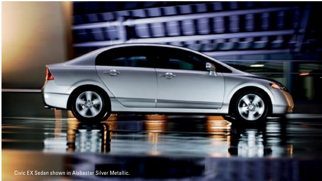
Civic EX Sedan shown in Alabaster Silver Metallic.

This is no time to stand still —the 2007 Honda Civic Sedan has all the moves to take you to the next level. It delivers inspiring power while using fuel responsibly. 3 Handling is quick and precise thanks to its meticulously engineered steering and suspension systems. Its aerodynamic shape slips through the wind, and it boasts the latest in Honda safety technology. And you can even get the available Honda Satellite-Linked Navigation System™ 4 with voice recognition to help you keep the good times on course.