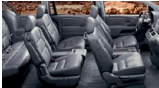
Luxury meets roominess in the Touring model.

5 Horsepower and torque calculations reflect SAE J1349 procedures revised August, 2004.