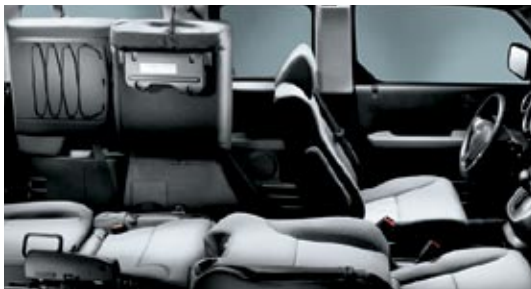
Go 64 ways with Element's ingenious seats.