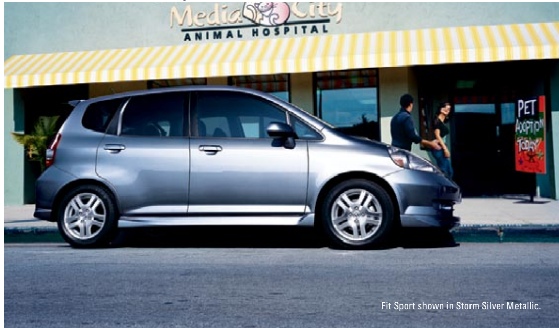
Fit Sport shown in Storm Silver Metallic.

Why be predictable? In the new Honda Fit, you make up the rules as you go. It's smart-sized, quick on the draw and up for anything but the usual. Its eager engine and compact size mean a great power-to-weight ratio for zigging and zagging through the day. Multiple seating modes can make room for five rowdy pals or an unexpected amount of odds and ends—or some of each. It's perfect when you're all about finding lots of new ways to go your own way. Work. Play. Make a scene. Because life's too short to follow someone else's rules.