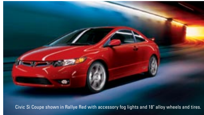
Civic Si Coupe shown in Rallye Red with accessory fog lights and 18" alloy wheels and tires.

Say two letters—Si—and you've said a mouthful. The Civic Si Coupe has the goods befitting the king of sport compacts. 197 hp. Six speeds. No compromises. If you're ready to rule, wrap yourself in those bucket seats and see what the deep bolsters are for.