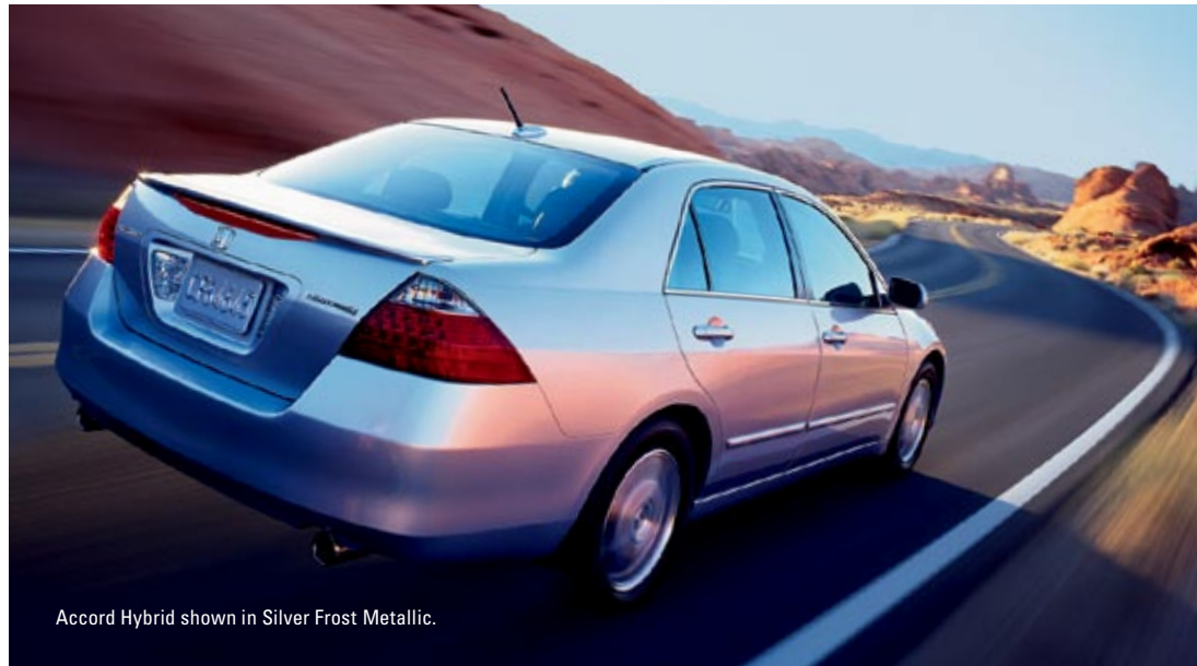
Accord Hybrid shown in Silver Frost Metallic.

Yes, hybrids are about great fuel economy and ultra-low emissions. But with the 2007 Accord Hybrid, it's also about scintillating high performance. Because along with its 35-mpg 3 highway rating, this Hybrid puts as much as 253 horsepower to work making your driving a lot more enjoyable. And luxurious comforts and conveniences aren't forgotten here at all—you may feel a little spoiled enjoying things like the supple leather trim and the dual-zone automatic climate control system. There's even a power moonroof to bring sunny skies or starry nights inside. Leave it to Honda to make social responsibility fun.