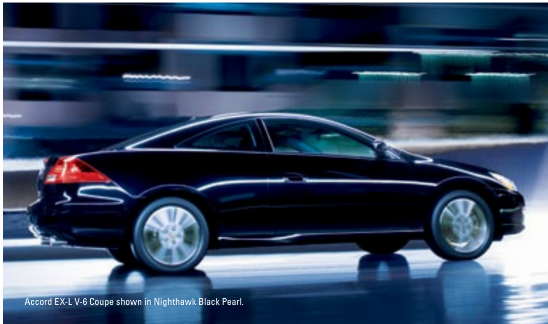
Accord EX-L V-6 Coupe shown in Nighthawk Black Pearl.

The Accord Coupe is the complete package, offering legendary Honda quality, cutting-edge technology and a long list of safety features, including standard Vehicle Stability Assist™ (VSA®) on V-6 models. Plus, it's truly a driver's car, and has been meticulously engineered to deliver precise cornering, brisk acceleration and strong braking. And yes, it will readily accommodate you as well as four lucky others in luxurious comfort and sophisticated style. But we all know where the luckiest one of all gets to sit.