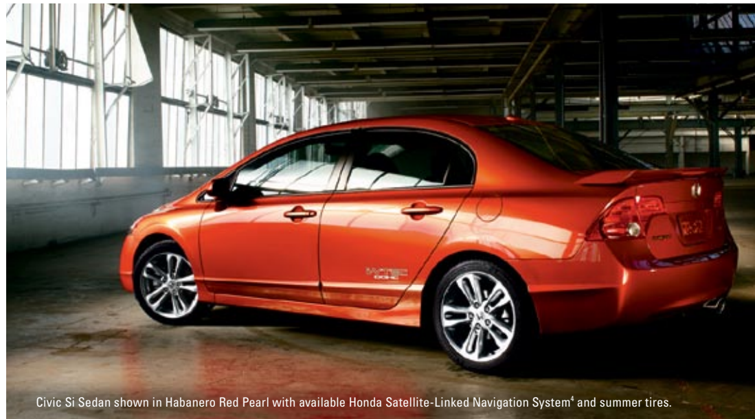
Civic Si Sedan shown in Habanero Red Pearl with available Honda Satellite-Linked Navigation System 4 and summer tires.

It's time you listened to your wilder side. For '07, we took all the high-performance technology of the Si Coupe and combined it with the extra spaciousness of the Civic Sedan. The Si's 197-hp rush comes from the latest member of Honda's legendary K20 engine family, with an 11:1 compression ratio and an 8000-rpm redline. Add the sport-tuned suspension, and you're ready for serious G-forces. All that, and you can even tell your practical side that it has four doors. That should keep it quiet.