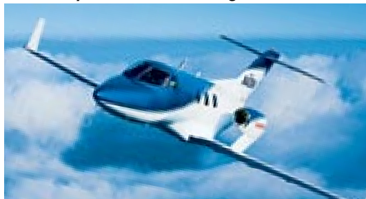
Reaching new heights in the HondaJet™