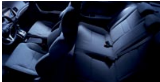
Civic Coupe specializes in comfort and style.

Front, Front Side and Side Curtain Airbags Driver's and Front Passenger's Active Head Restraints Driver's and Front Passenger's Seat Belt Reminder Anti-Lock Braking System (ABS) Electronic Brake Distribution (EBD) Vehicle Stability Assist™ (VSA 4 ) with Traction Control (Si) Daytime Running Lights (DRL)