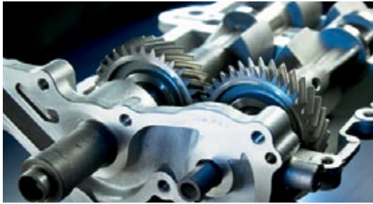
The Si kicks out nearly 100 horses per liter.