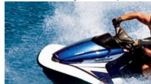
You can even rule the waves on a Honda.