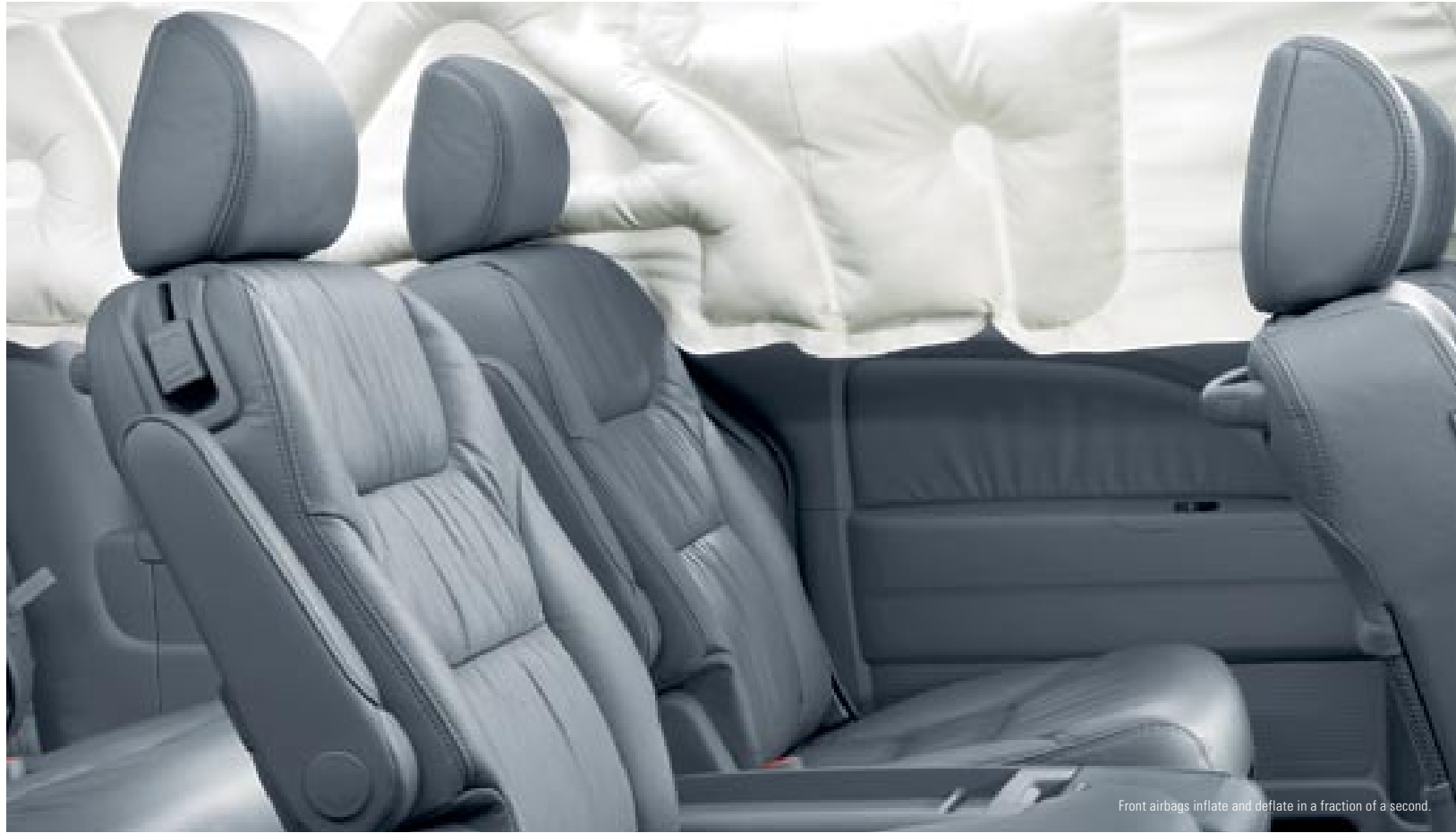
Front airbags inflate and deflate in a fraction of a second.

Honda Accord becomes the first SULEV on the market