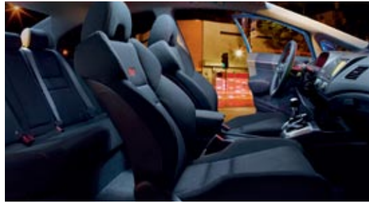
When you're in here, high performance reigns.