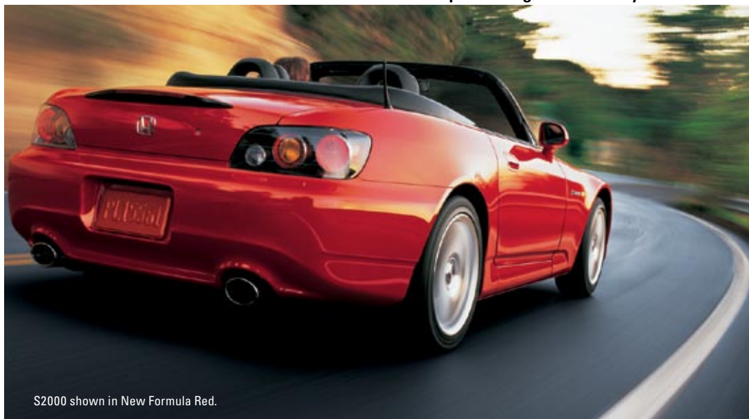
S2000 shown in New Formula Red.

Its cockpit is designed to focus your senses.