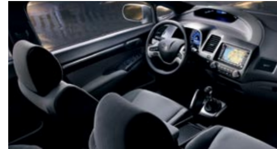
Advanced style distinguishes a spacious cabin.