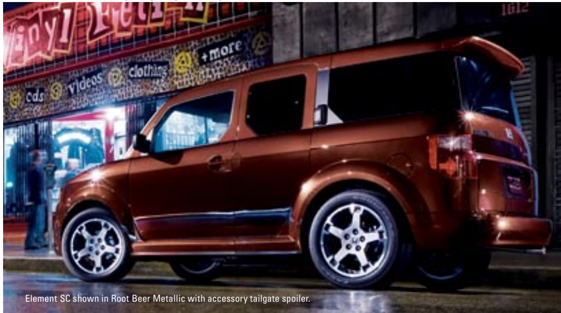
Element SC shown in Root Beer Metallic with accessory tailgate spoiler.

The Element embodies a unique attitude—call it a freedom from convention. And it turns out, not trying to fit in has made Element just the thing for almost anything you're up to. Element's seats for four are so versatile and flexible, there are no fewer than 64 configurations for people and cargo. Wide-opening side cargo doors and the clamshell tailgate make loading and unloading a snap. And for '07, there's the new SC model with a low stance, sharpened suspension, slick interior and decidedly street-ready attitude. So no matter how you live life, the Element offers plenty of ways to get out and live it your own unique way.