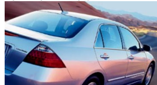
Honda offers Accord and Civic hybrids.