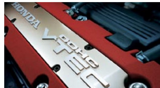
Honda builds more engines than anyone else.