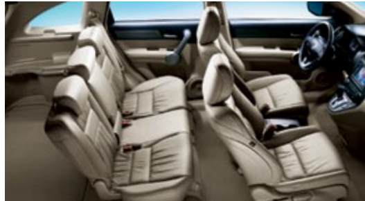
CR-V even offers an available navigation system. 4

It's something new to crave. Sure, the CR-V has always offered a lot to love. But one look tells you that the all-new 2007 CR-V has taken desire to a whole new level. From its alluring sheet metal to advanced technology and available leather seating, this CR-V is everything you want. And true to its core values, it's also everything you need. Five adults can soak up its spacious comfort, with lots of cubic space left for cargo. 14 And every new CR-V comes with a full complement of safety features, including six airbags and Vehicle Stability Assist (VSA). So the new CR-V is a lot more than just an irresistible new face.