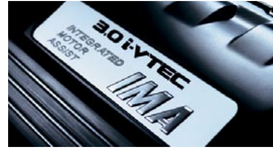
High mileage meets high performance.

Honda's legacy of innovation is unmatched in the vehicle industry. We have long acted on our spirited commitment to developing environmentally responsible technology. The results include world-changing advancements in fuel economy, low emissions and leading-edge hybrids. And as always, our engineers' attention is focused on the future. In fact, a Southern California family is already driving a limited-production Honda FCX hydrogen fuel-cell car in the Los Angeles area on a daily basis. It's all part of Honda's Environmentology.™