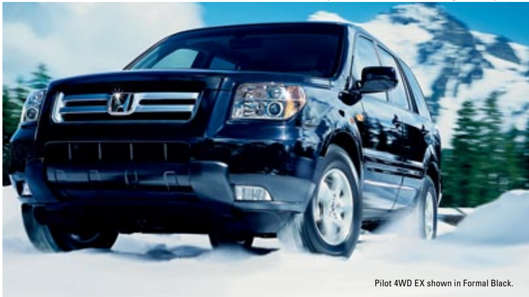
Pilot 4WD EX shown in Formal Black.

You can opt for leather and a navigation system. 4