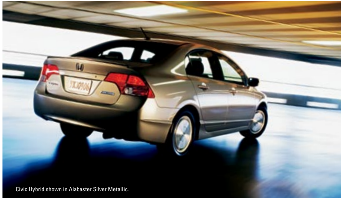
Civic Hybrid shown in Alabaster Silver Metallic.

*Horsepower and torque calculations reflect SAE J1349 procedures revised August, 2004.