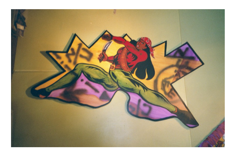
Fig. 1. Citlali exploding out of a distorted map of Texas. By Deborah K. Vasquez. "Ya Vine Pa'tras" (Kitchen installation and "Citlali" art exhibit). Esperanza Peace and Justice Center, San Antonio, Texas. December-January 2002.

Performing her insurgent role within the space of a typically racist and sexist symbolic imaginary and within the geopolitical realm of Texas, Citlali becomes a subversive modern day Chicana super hero who re/members her pre- and postcolonial history and culture, challenges stereotypes of women of color, and addresses pressing issues that affect Chicana/os and/or Latinos in their daily lives. While many classic super hero comics have been set in New York City (Reynolds 18), Citali is deeply rooted in her home in San Antonio, Texas, a drive away from the Mexican border. Vasquez says that Citlali is "very proud of who she is, proud of her humble beginnings, and very conscious of the situation her people are in" (Ayala). She refuses to be defined by, in her words, "gringos [or] their vendido cultural brokers [Chicana/o sell outs]" who profit from distorted histories of brown-skinned people.<sup>3</sup> Citlali's identity is contextualized within a history of comics and super hero mythology as well as Chicana/o political art. Interviews with the artist and performative analyses of representative Citlali graphics and text are conducted to theorize the potential of cultural performances of "macha femme" to carve out alternative spaces within dominant discourses and offer marginalized communities a vision of social resistance and empowerment.