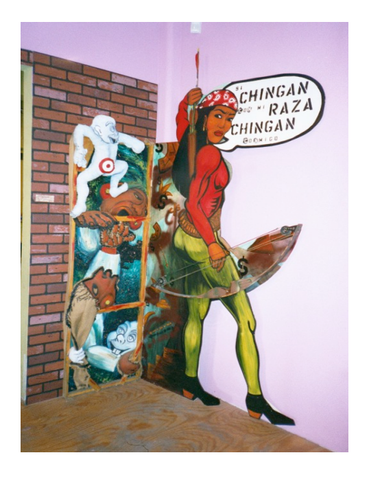
Fig. 3. Citlali with bow and arrow. By Deborah K. Vasquez. "Ya Vine Pa'tras" (Kitchen installation and "Citlali" art exhibit). Esperanza Peace and Justice Center, San Antonio, Texas. December-January 2002.

In another installation panel Citlali wields a wicked looking knife to cut down indigenous bodies being lynched for the entertainment of a crowd of runty looking white figures and to leap, hypermuscular legs spread wide apart, out of a distorted graffiti-marked map of Texas. One installation panel portrays Citlali with a wild look in her eyes as she shoots bolts of electricity out her fingertips. In the February 2002 La Voz comic strip critiquing the press's lack of knowledge about Chicano art, Citlali is drawn in mid-air with one leg extended, delivering a powerful boot kick to the jaw of the signature cartoonish white figure as journalist. In the next panel, the white figure lies on the ground, eyes closed and tongue hanging out of his mouth. With her boot on his arm, she sneers at the viewer, yelling "Next!!!" Images of Citlali in violent confrontations with media makers, art critics, neocolonizers, etcetera, serve as a kind of rhetorical culture jamming by powerfully literalizing both the sustained violence of neocolonialist practices and the specter of oppressed peoples rising up to fight back. These images also flaunt the macha femme's monstrous power and graphically challenge representations of women, and especially Latinas, as the "weaker" sex. Instead of feeling alienated because of her super hero status, Citlali exploits this energy and her potential to envision and enact social change.