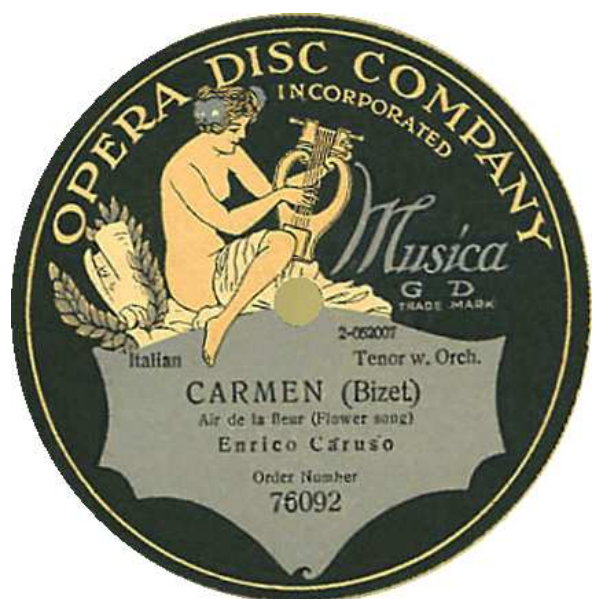
Opera Disc 76092 (GER)