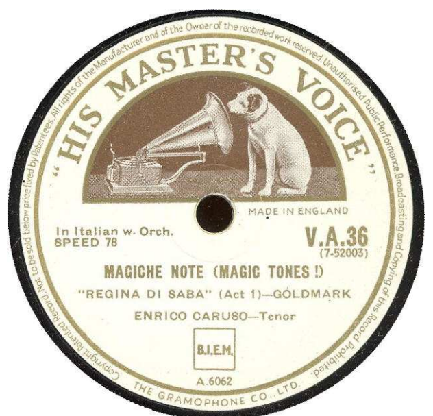
HMV VA 36