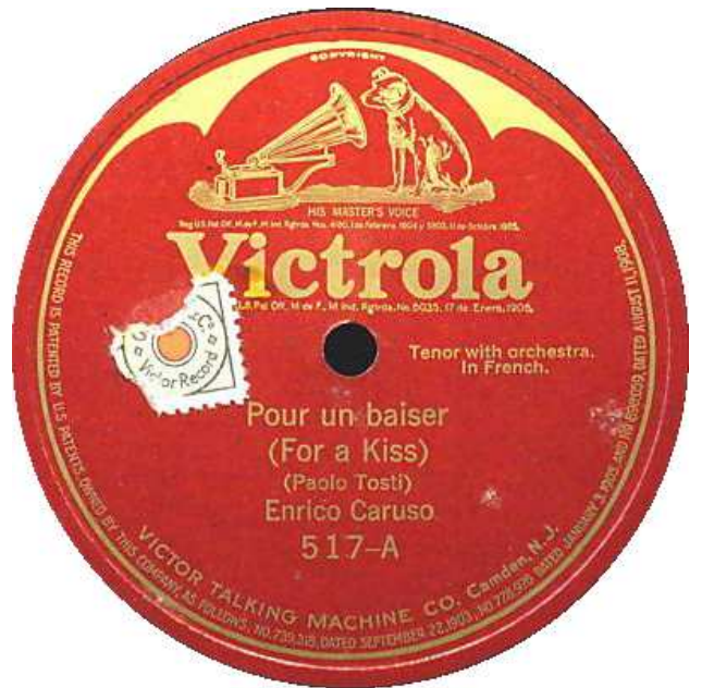
Victrola 87042 - Victrola 517