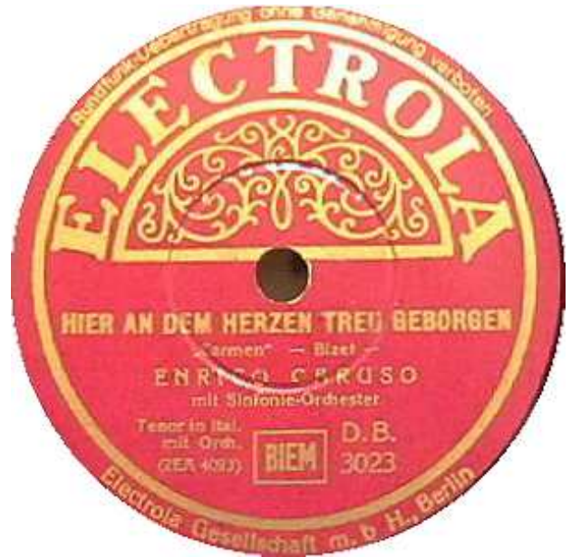
Electrola DB 3023