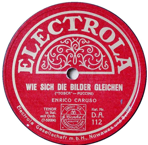
Electrola DA 112 (GER)