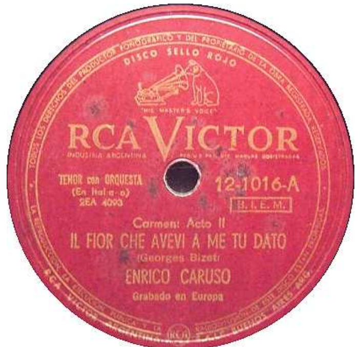
RCA Victor 12-1016 (ARG)