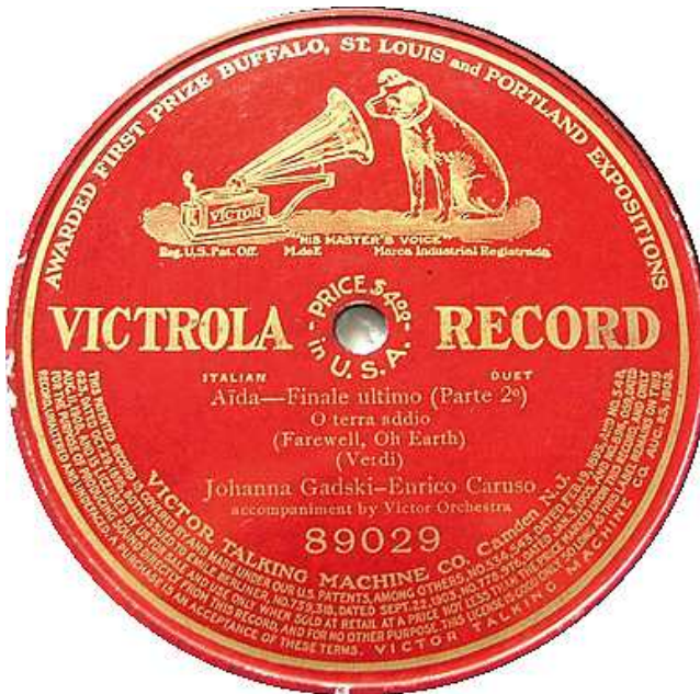
Victrola 89029 - 5 lines patent - 4$