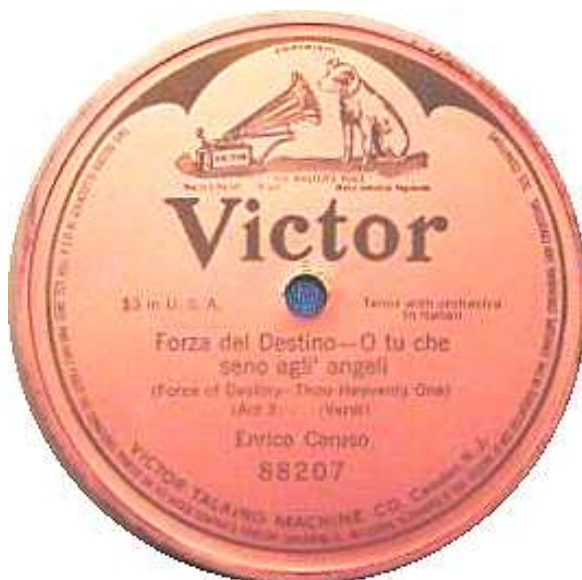
Victor 88207 - 3$