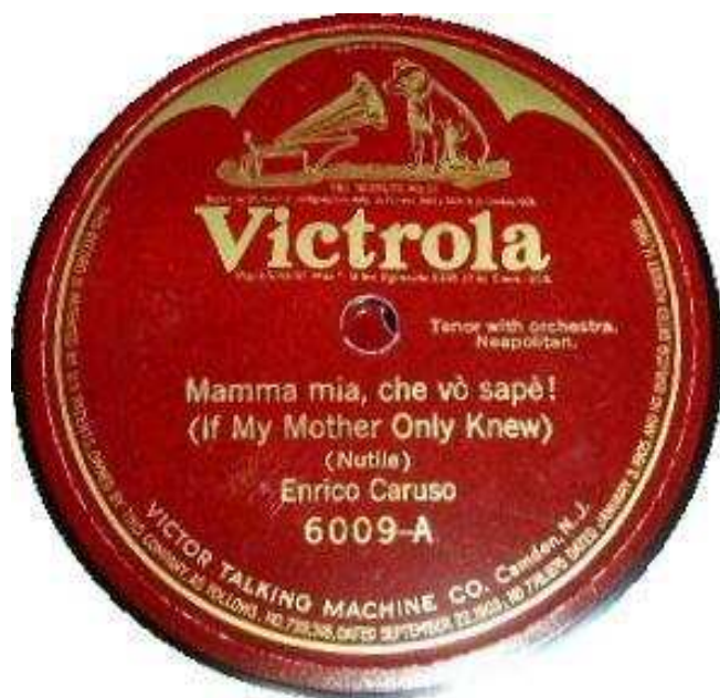
Victrola 6009 Patent Aug. 1908