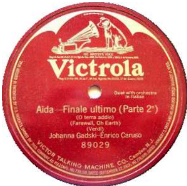
Victrola 89029 - Patent 1908