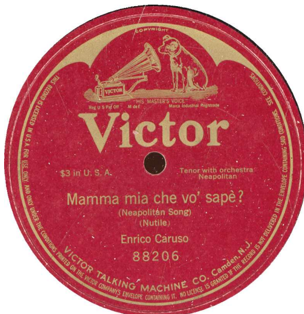
Victrola 88206 - 5 lines patent - Victor 88206 - Envelope