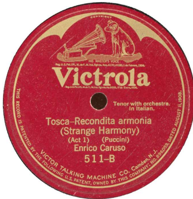
Victrola 511 Patent Aug. 1908