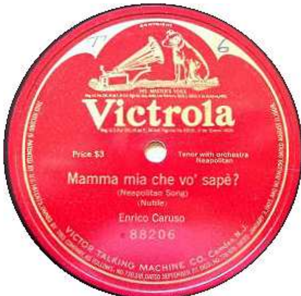
Victrola 88206 - med pris 3$ Patent Aug. 1908