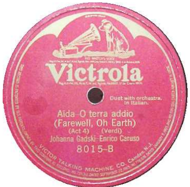
Victrola 8015 - Patent 108