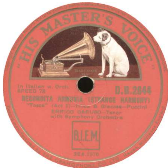
HMV DB 2644 - RR