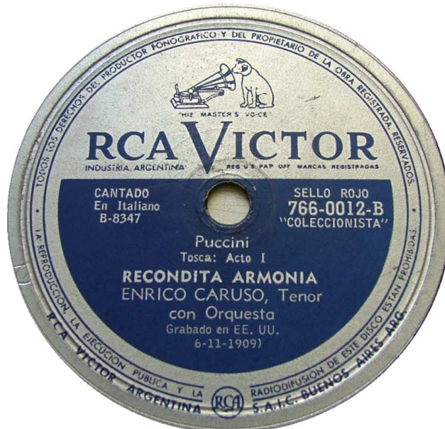
RCA-Victor 766-0012 - Argentina