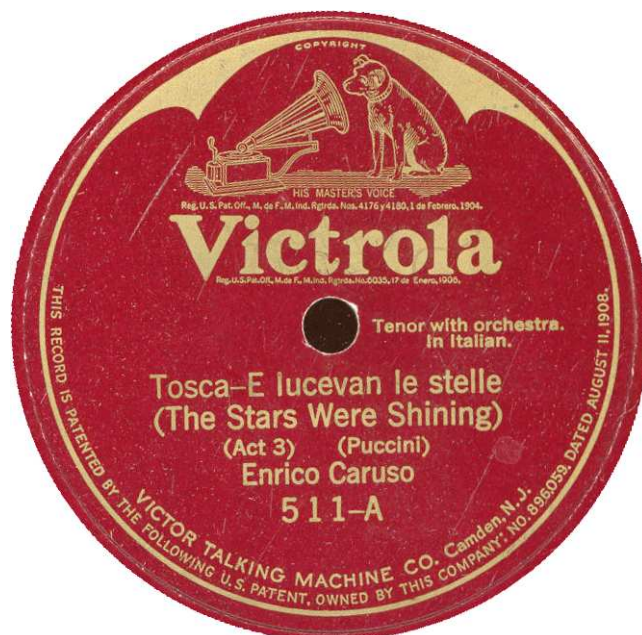
Victrola 511 Patent Aug. 1908