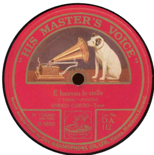
HMV DA 112