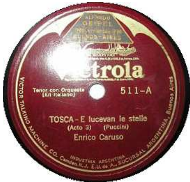
Victrola 511 - Argentina