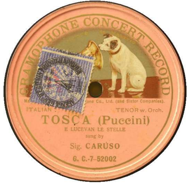
Victrola 511 (ARG) - GCR G.C.-7-52002