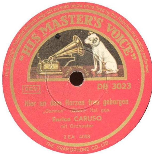
HMV DB 3023 (GER)