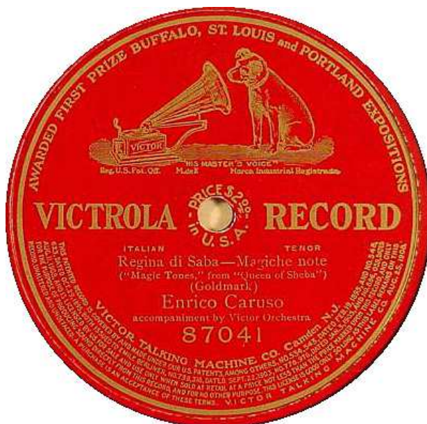
Victrola 87041 - 5 lines patent - pris 2$