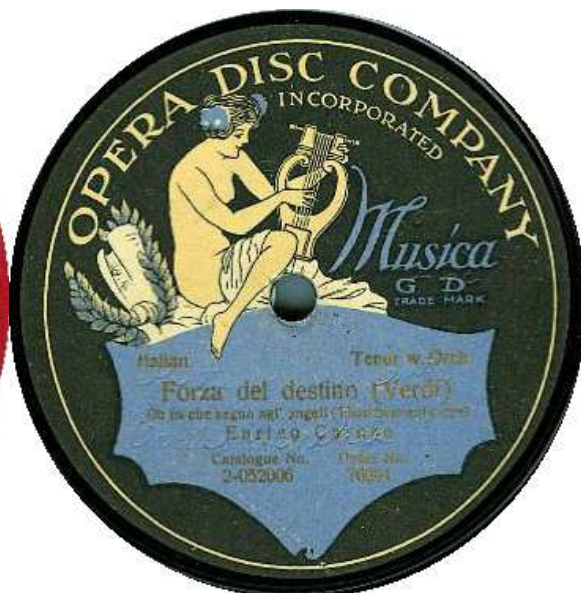
Opera Disc 76091