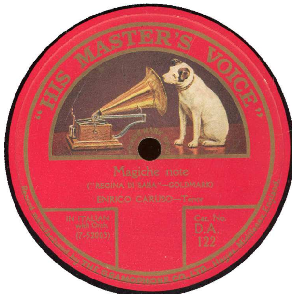
HMV DA 122