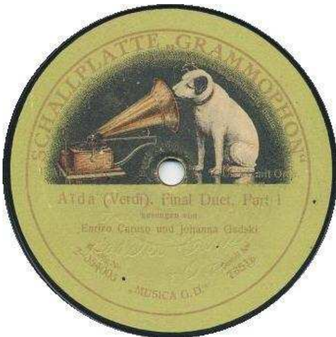
Schallplatte Grammophon 78516