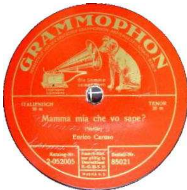
Grammophon 85021 (GER)