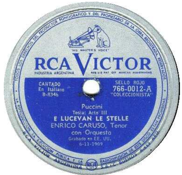
RCA-Victor 766-0012 - Argentina

B-8347 Recondita armonia - Tosca - Puccini - with orchestra Victor 87043 ES Victrola 511 b/E lucevan le stelle - Tosca - Puccini - med ork. HMV 7-52004 ES Polyphon 7-52004 ES HMV DA 112 b/E lucevan le stelle - Tosca - Puccini - w/orch. Electrola DA 112 (GER) b/E lucevan le stelle - Tosca - Puccini - w/orch. Gramola DA 112 (Czech) b/E lucevan le stelle - Tosca - Puccini - w/orch. Opera Disc 74528 (GER) ES Opera Disc 80010 (GER) b/E lucevan le stelle - Tosca - Puccini - w/orch. RCA Victor 766-0012 (ARG) b/E lucevan le stelle RCA Victor 11-8569 RR b/Bori: Sempre (12") (recreations) HMV DB 2644 RR b/Agnus Dei - Bizet - in latin (recreations) (12")