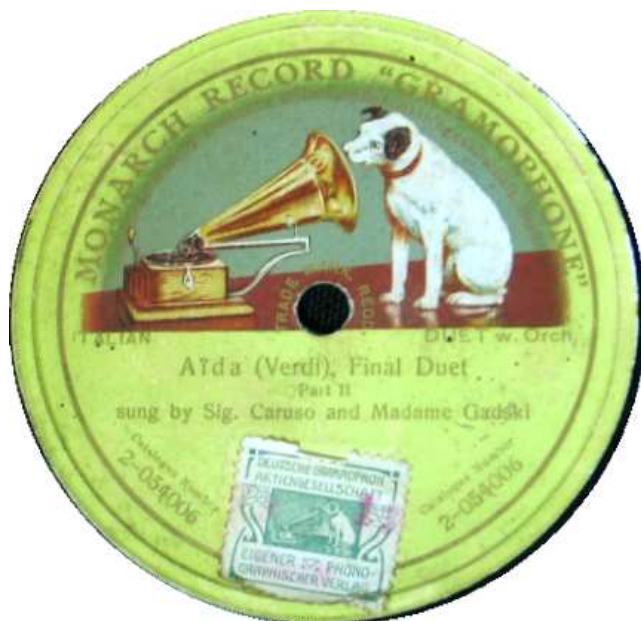
Grammophon 78517 - MRG 2-054006