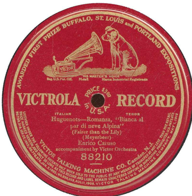
Victrola 88210 - 3 lines patent