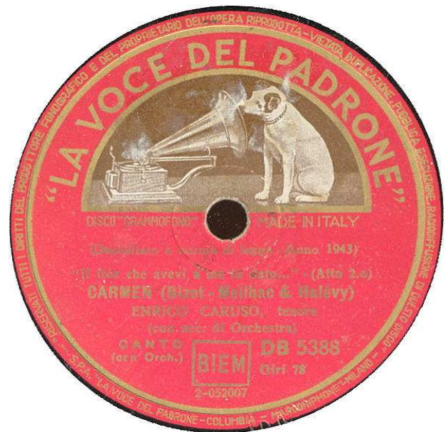
HMV DB 5388 (ITAL)