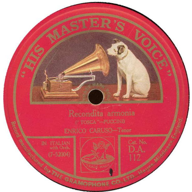
HMV DA 112