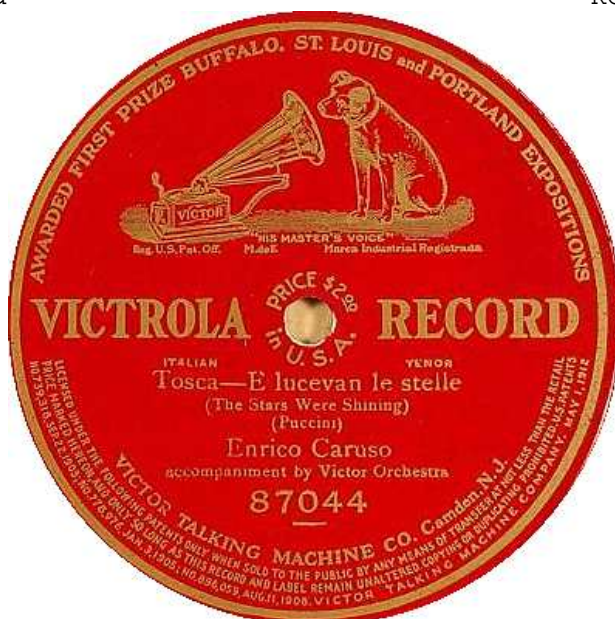
Victrola 87044 - 3 lines

B-8346 E lucevan le stelle - Tosca - Puccini - with orchestra ES Victor 87044 ES Victrola 87044 b/Recondita armonia - Tosca - with orchestra S/8 Victrola 511 ES GCR G.C.-7-52002 ES HMV 7-52002 b/Recondita armonia - Tosca - with orchestra S/8 HMV DA 112 b/Recondita armonia - Tosca - with orchestra S/8 Electrola 112 (GER) b/Recondita armonia - Tosca - with orchestra Gramola DA 112 (Czech) ES Opera Disc 74526 (GER) b/Recondita armonia - Tosca - with orchestra Opera Disc 80010 (GER) b/? TR. (vinyl) RCA 17-0336 b/Recondita Armonia RCA Victor 766-0012 (ARG)