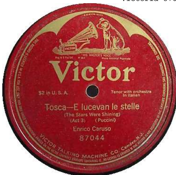
Victor 87044 - 2$