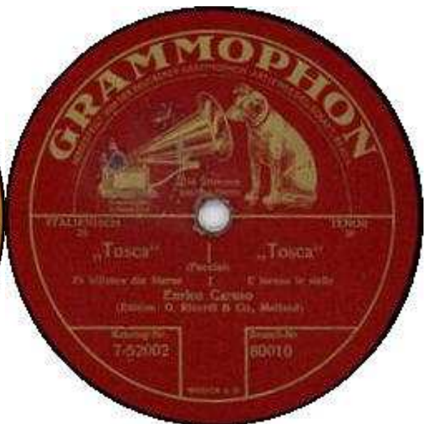
Künstler Schallplatte "Grammophon" 80010 (GER)