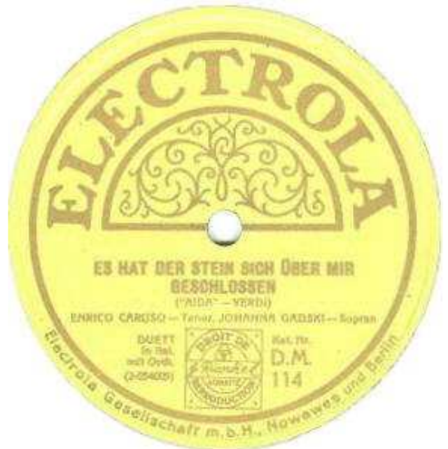
Electrola DM 114