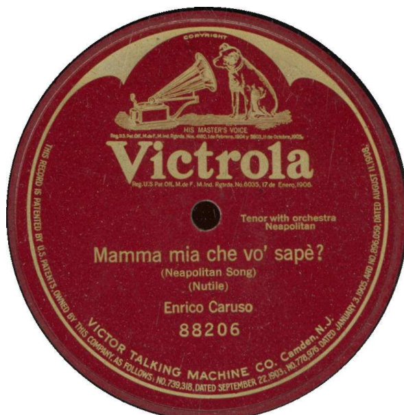
Victrola 88206 - uden pris Patent Aug. 1908