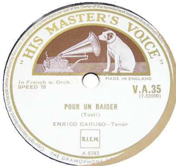
HMV VA 35