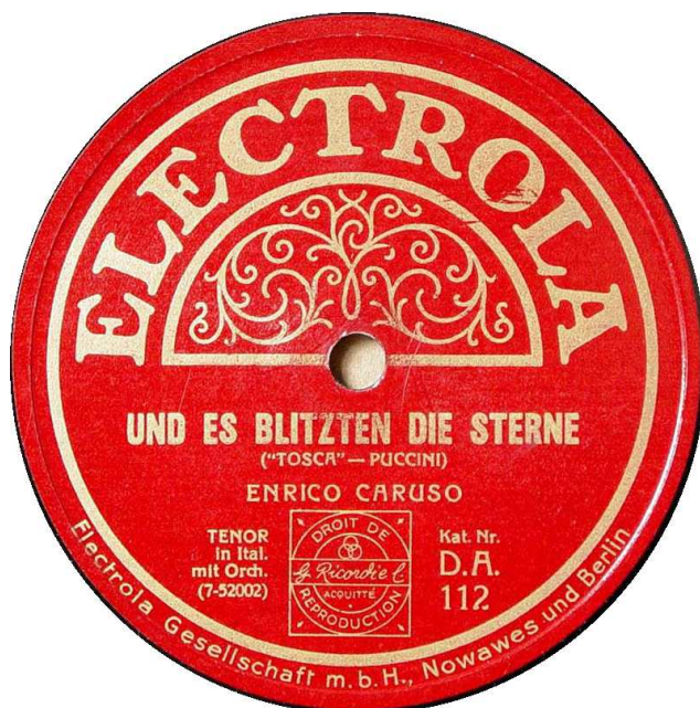
Electrola DA 112 (GER)