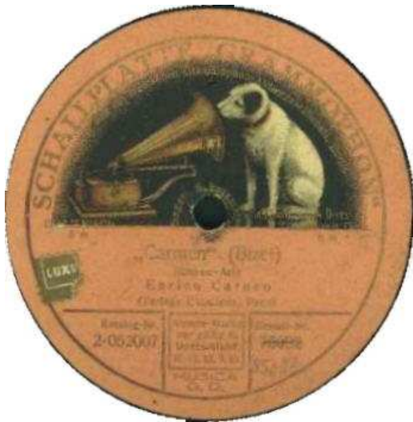
Schallplatte Gramophon 76092