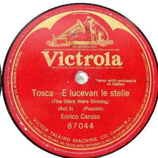
Victrola 87044 - no price