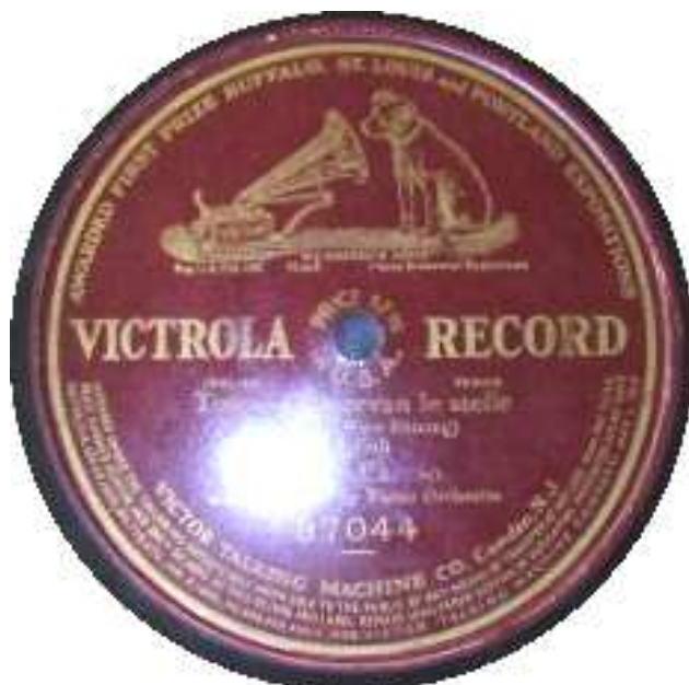
Victrola 87043 4-liner patent