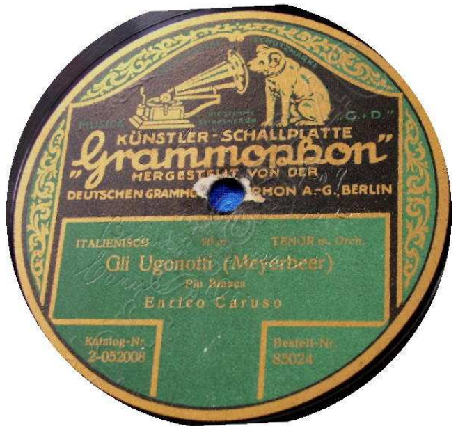
Grammophon 85024 (GER)