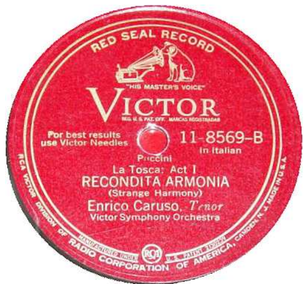
Victor 11-8569 - RR