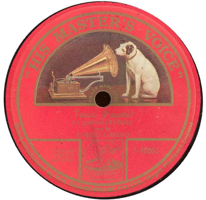
HMV 7-052002 - two different issues