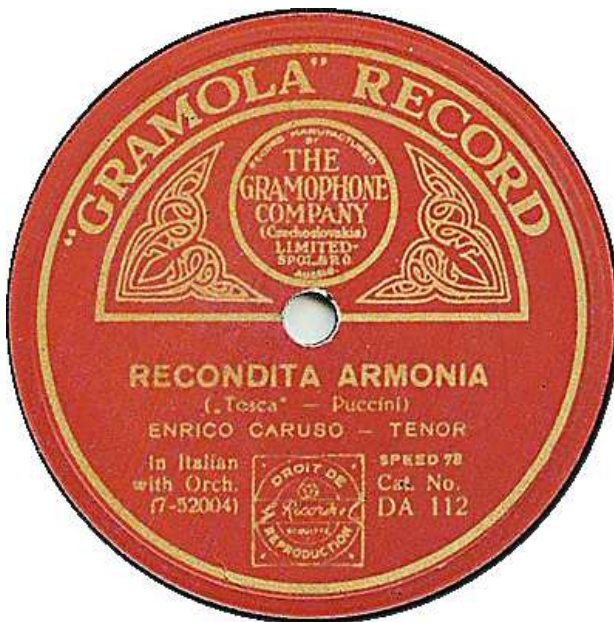
Gramola DA 112 (Czech)