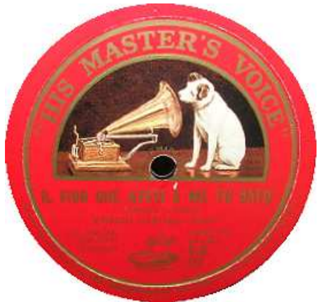
HMV DB 117