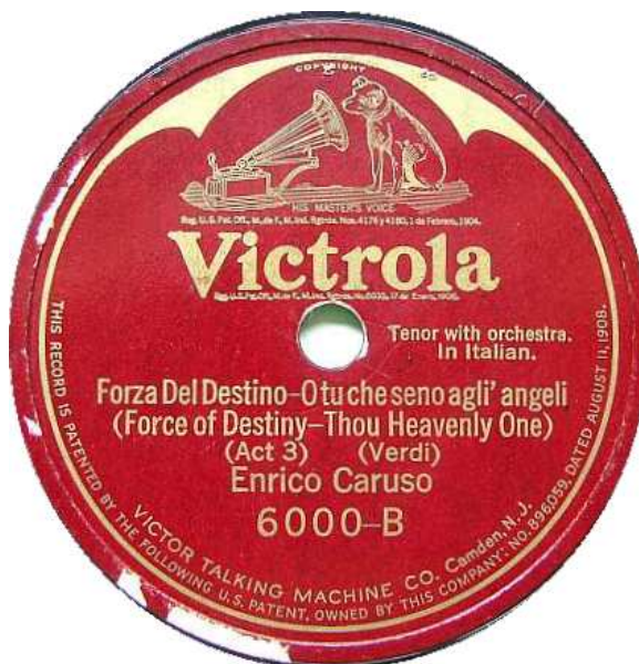
Victrola 6000 Patent Aug. 1908