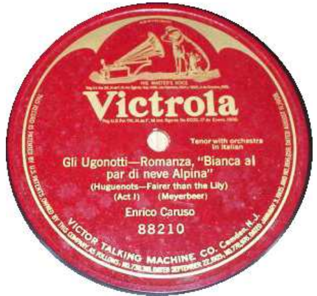
Victrola 88210 Patent Aug. 1908