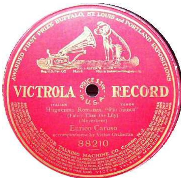
Victrola 88210 - 5 lines patent

C-8351 Bianca al par - Huguenots - Meyerbeer - with orchestra ES 5 lines Victrola 88210 ES 3 lines Victrola 88210 b/Sprito gentil - La Favorita - Donizetti Victrola 6005 ES HMV 2-052008 b/Uocchie celeste - De Crescenzo HMV DB 115 ES Opera Disc 76093 (GER) b/??? Grammophon 85024 (GER) b/M'appari - Martha - Flotow - ends with "Ah, morro" Opera Disc 85011 (GER) b/Deserto in terra - Don Sebastiano - Donizetti RCA Victor 15-1037