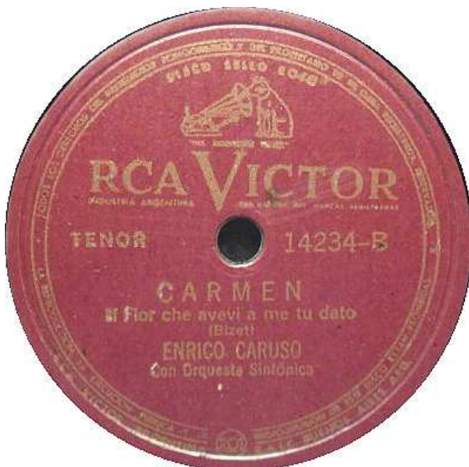
RCA Victor 14234 (ARG)