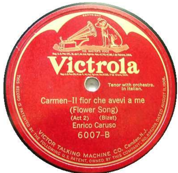
Victrola 5-lines 88209 - Victrola 6007 - Patent Dated Aug. 1908