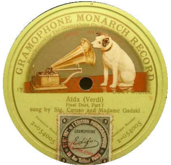
Victrola 89028 Patent Aug. 1908 - GMR 2-54005