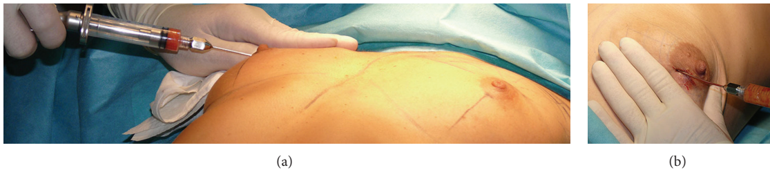
FIGURE 3: Purified fat and BMMNCs mixture reimplantation: (a) and (b) breast augmentation procedure (bicompartamental grafting).

is designed to deliver approximately 0.50 mL of tissue for each full brush of the operator's thumb. Minimally manipulated fat combined with BMMNCs was reimplanted strictly in two planes only: into the retroglandular and prefascial space and into the superficial subcutaneous plane of the upper pole of the breast (bicompartamental grafting) (Figure 3).