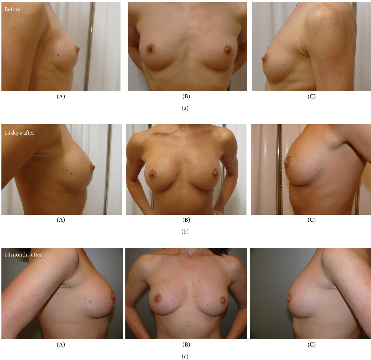
FIGURE 4: Clinical outcomes and aesthetic results after BMMNCs-enriched lipograft for primary bilateral breast augmentation: preoperative views (top), and postoperative views at 14 days (middle), postoperative views at 12 months (bottom); (A) right view, (B) front view, and (C) left view.

actions could be beneficial for the stimulation of angiogenesis in transplanted fat by BMMNCs administration. Although an optimal method of cells-assisted autologous fat grafting for primary breast augmentation should be standardized, further strong-evidence-based studies are necessary to confirm the findings of this approach [48, 49].